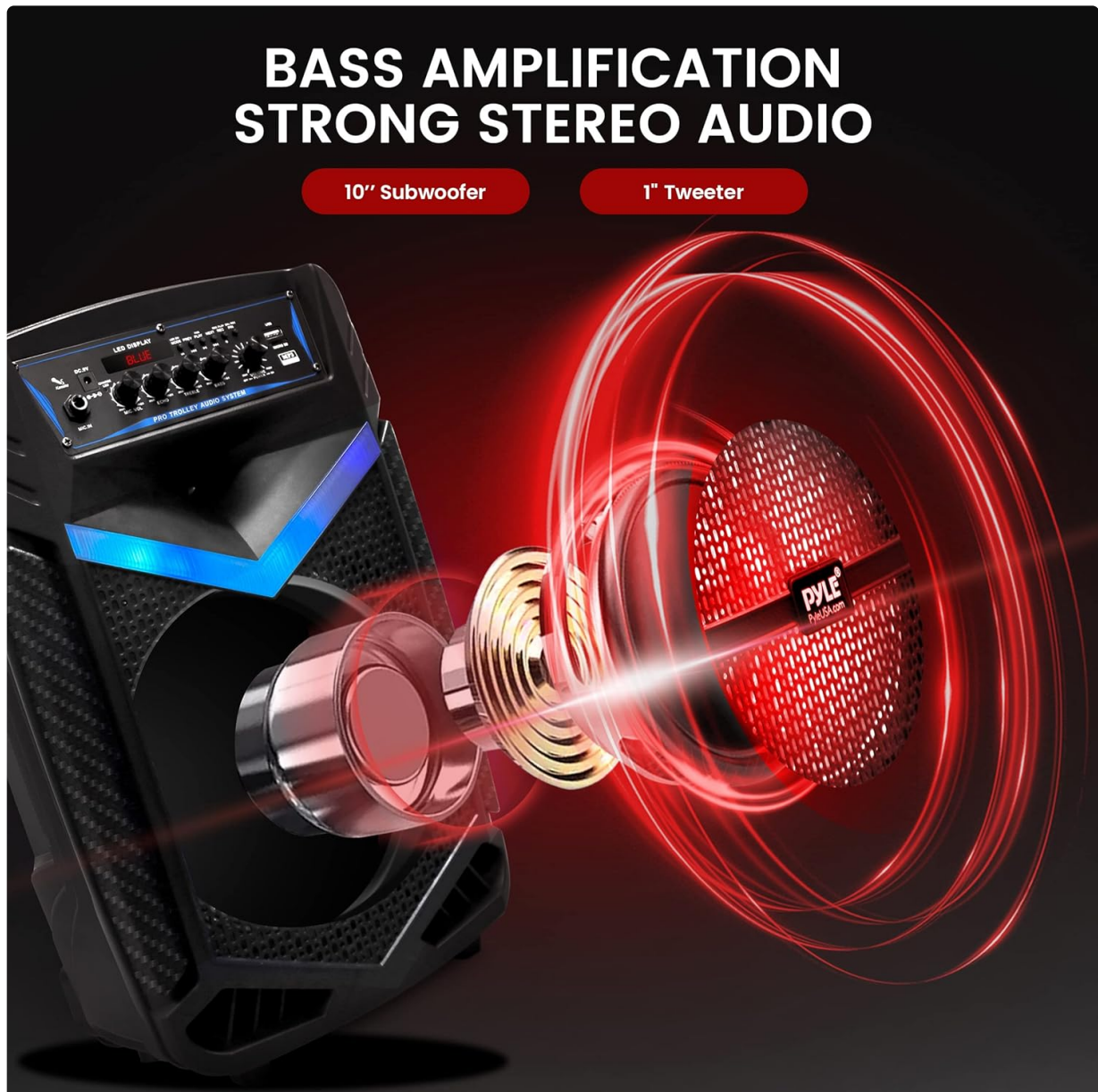
Figure 2: The speaker system features a 10-inch subwoofer and a 1-inch tweeter for powerful sound output.