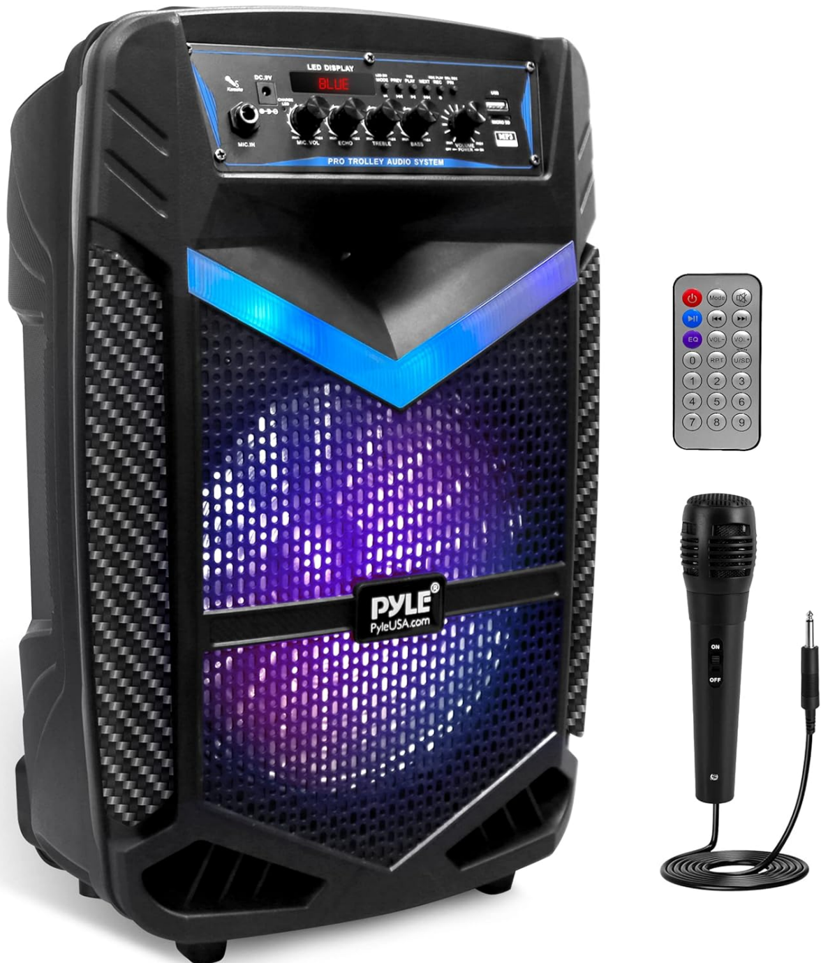
Figure 1: Pyle Portable Bluetooth PA Speaker System with included microphone and remote control.