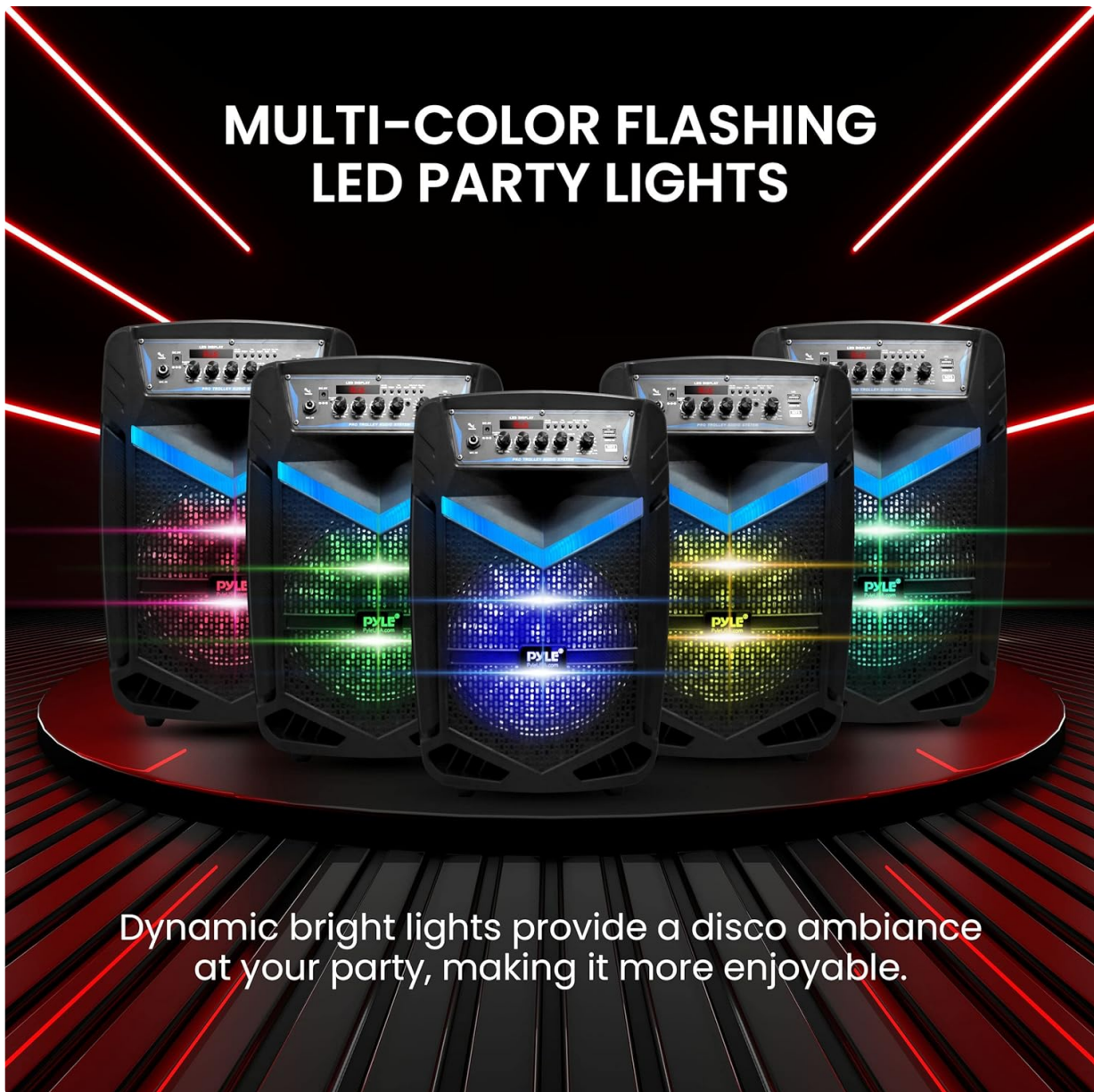
Figure 4: The speaker features multi-color flashing LED lights for an enhanced party atmosphere.