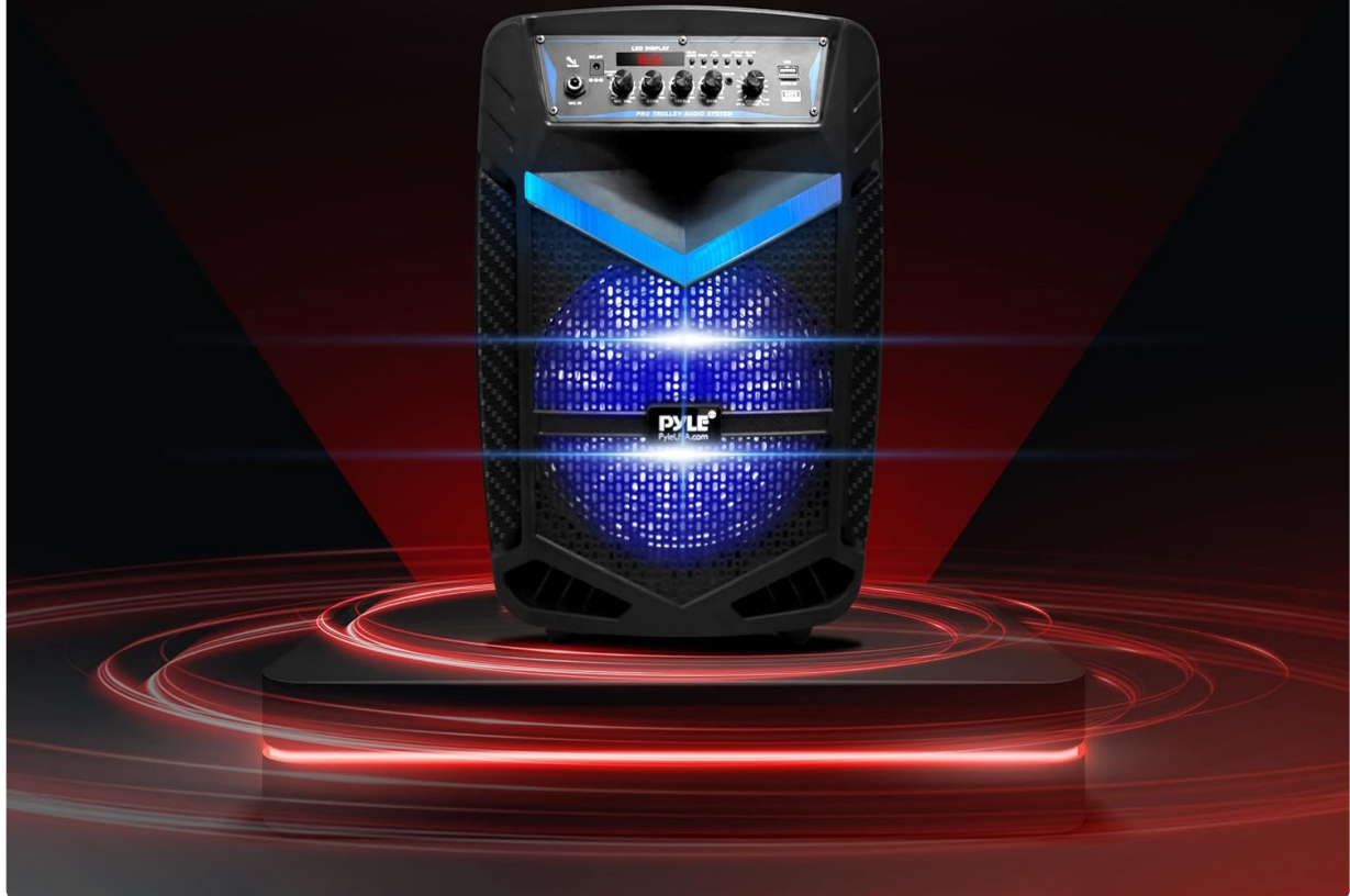
Figure 3: Various input options including Bluetooth, Microphone, USB, Micro SD, AUX, and FM Radio.