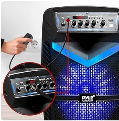
Figure 5: Connect the power adapter to the DC 9V input for charging.