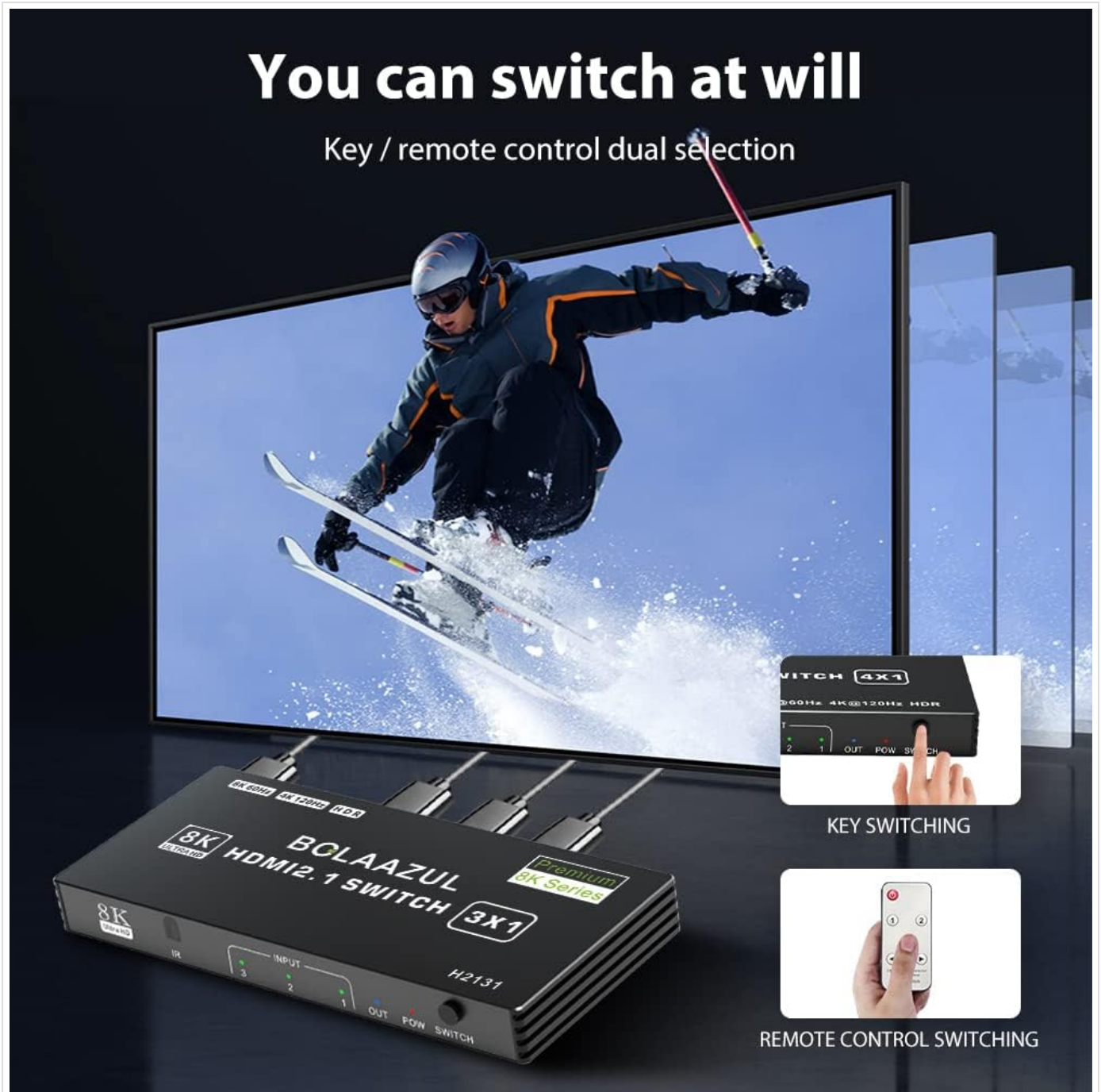
Image: Demonstrating both manual button switching and remote control switching for the HDMI switch.

The switch supports HDR (High Dynamic Range) up to 10 bits and 5.1 channel audio passthrough, ensuring optimal video and audio quality from your connected devices.