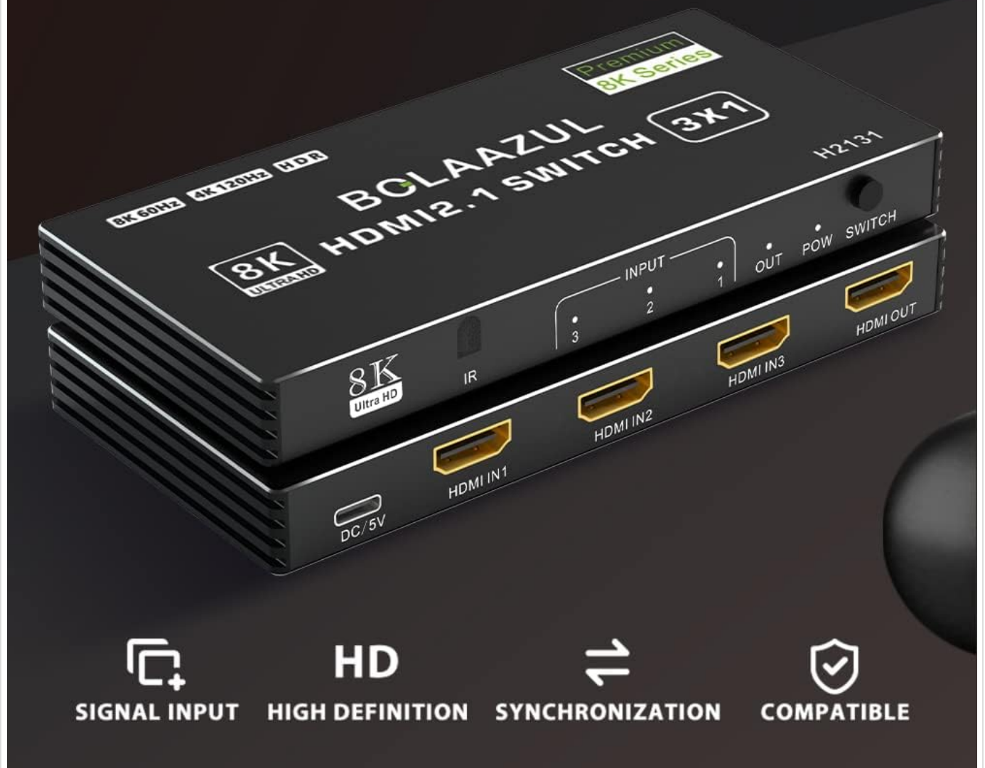
Image: BolAAZUL HDMI Switch with its remote control, USB power cable, and user manual.

Slim and simple, saving spaces, easy to use and carry