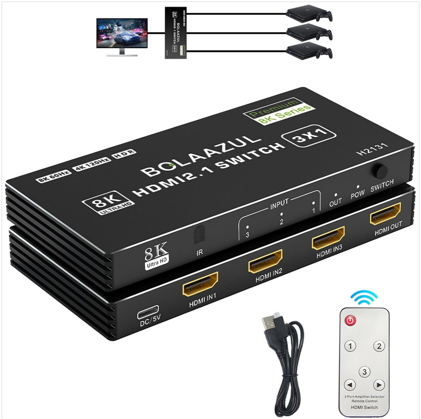
Image: Connection diagram illustrating the setup of the HDMI switch with multiple source devices and a single display.