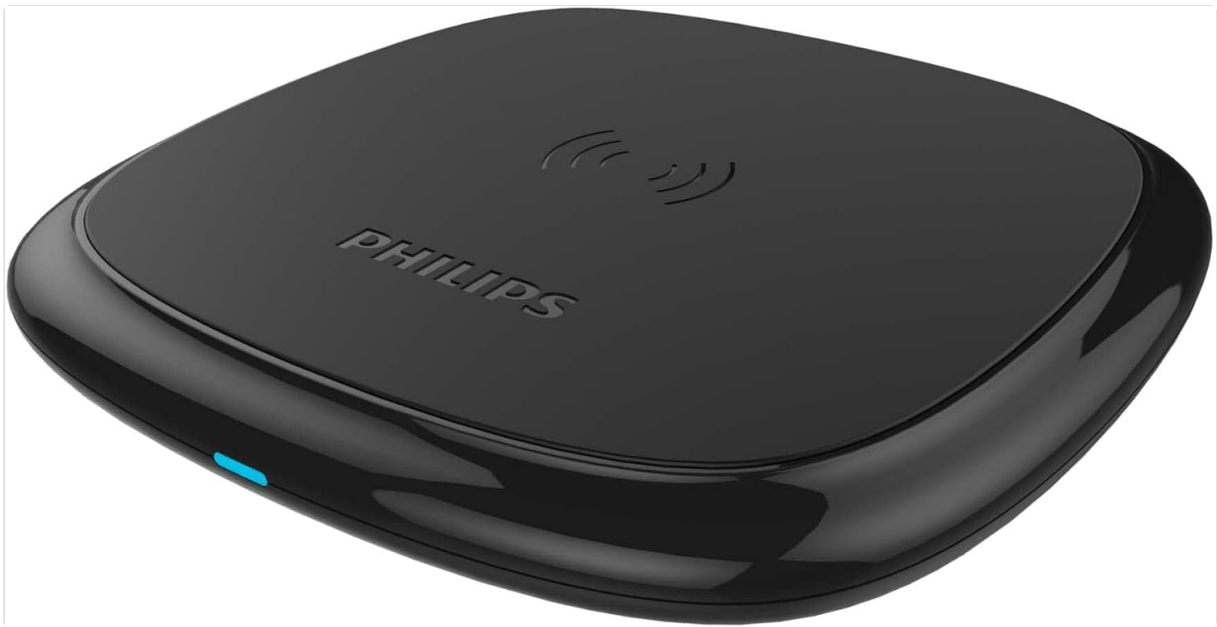
Figure 4.1: Front view of the Philips DLP9210/00 Qi Wireless Charger. The charger is black, square with rounded corners, and features the Philips logo and Qi wireless charging symbol on its surface. A small blue LED indicator is visible on the front edge.