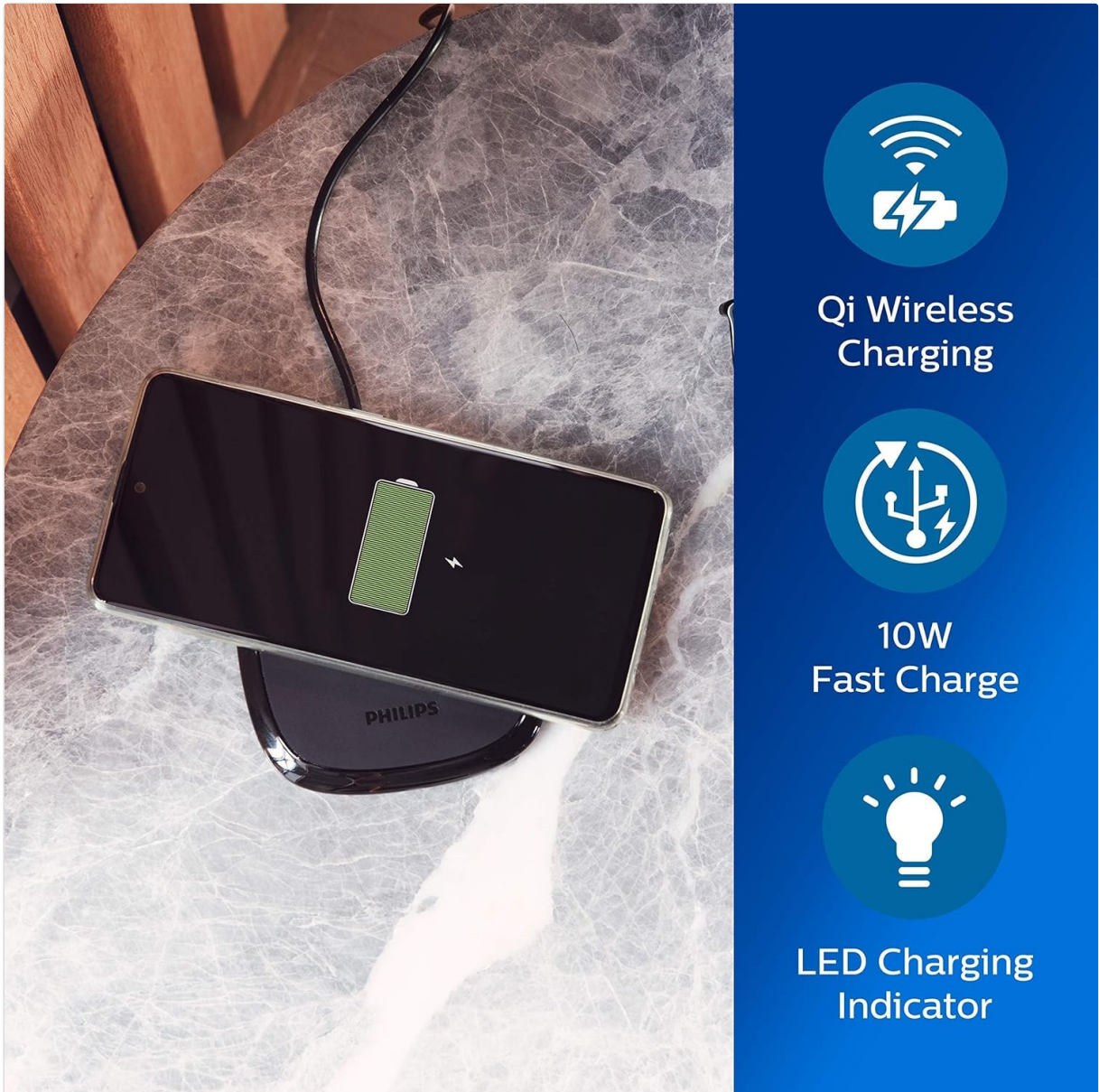
Figure 4.2: The Philips DLP9210/00 Qi Wireless Charger actively charging a smartphone. The image highlights key