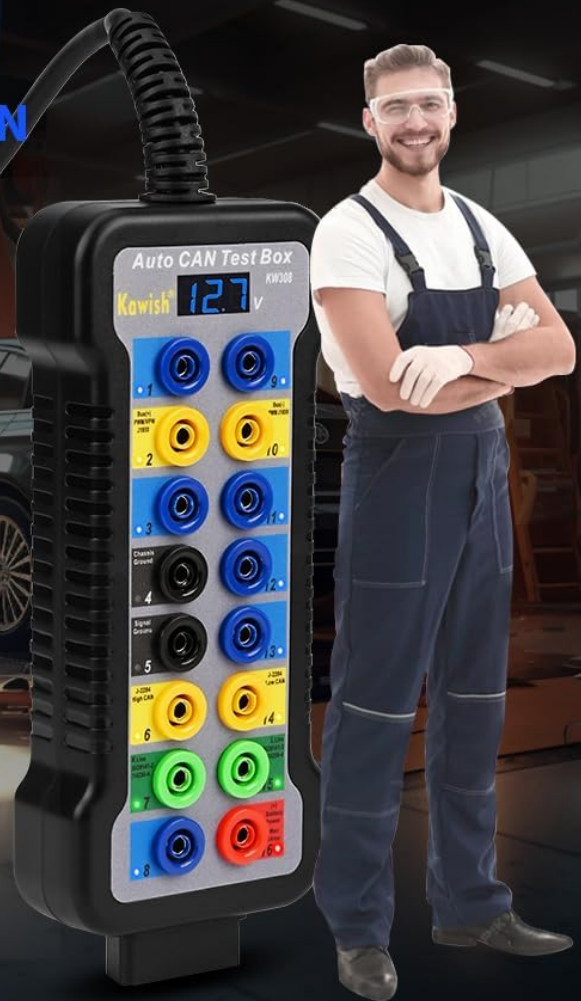
Figure 3: Using the 4mm banana plug sockets to connect a multimeter for signal testing.