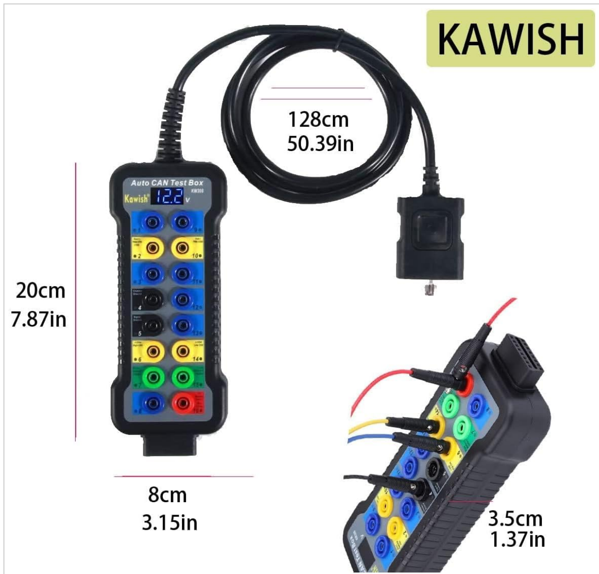
Figure 2: Connecting the OBD2 Breakout Box to the vehicle's diagnostic port and a scanner.

port on the breakout box. For multimeter or oscilloscope testing, connect the probes to the corresponding 4mm banana plug sockets on the breakout box.