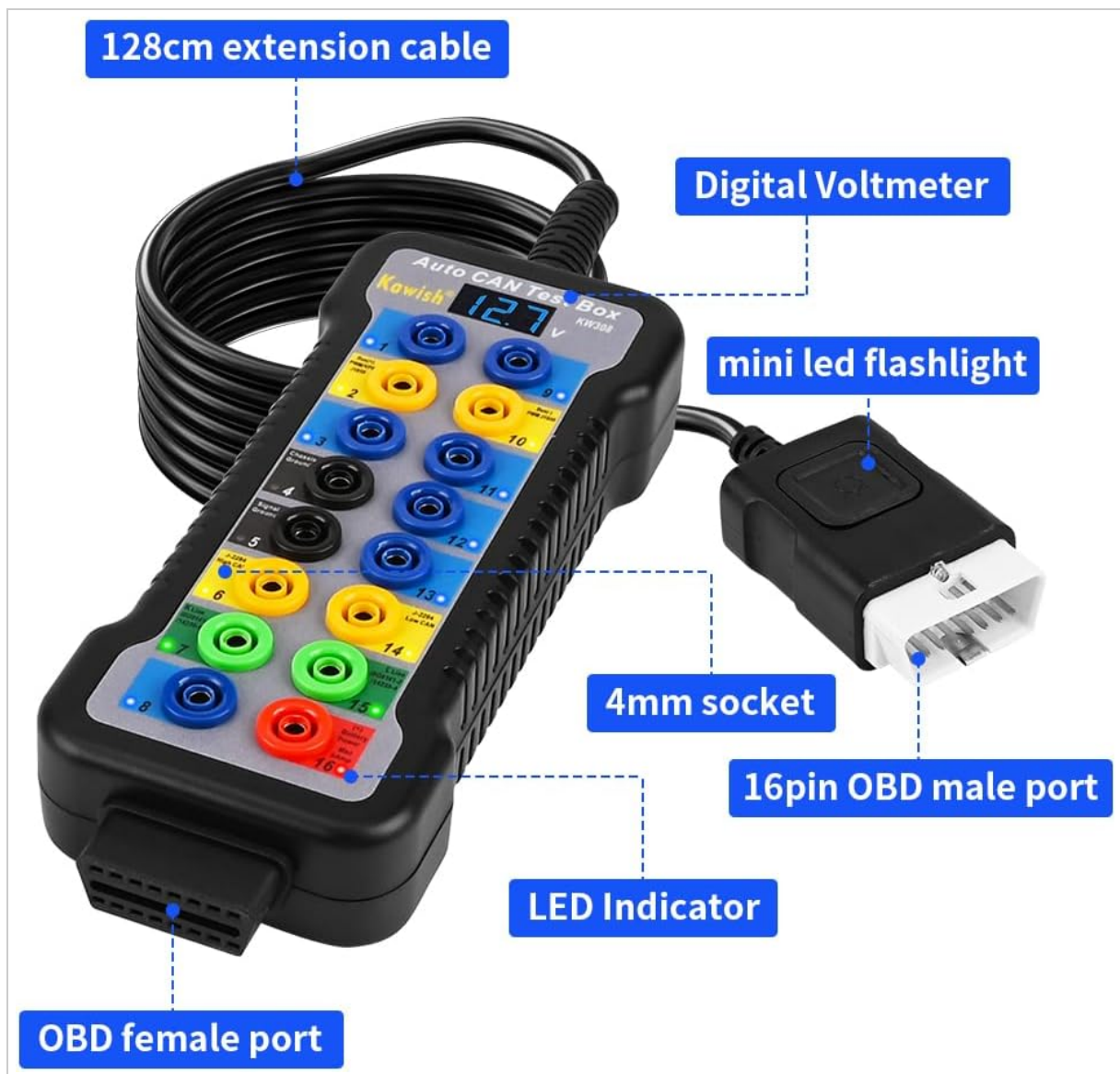
Figure 5: OBD2 16-Pin Interface Pin Definitions.