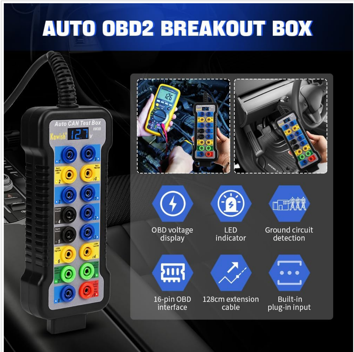
Figure 1: Kawish KW308 OBD2 Breakout Box with key features labeled.