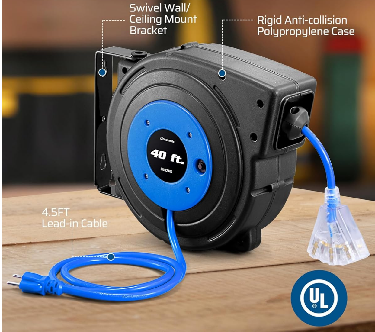
Image: View of the cord reel showing the 40ft 12AWG/3C SJTOW extension cord, 4.5ft lead-in cable, swivel wall/ceiling mount bracket, and rigid anti-collision polypropylene case.