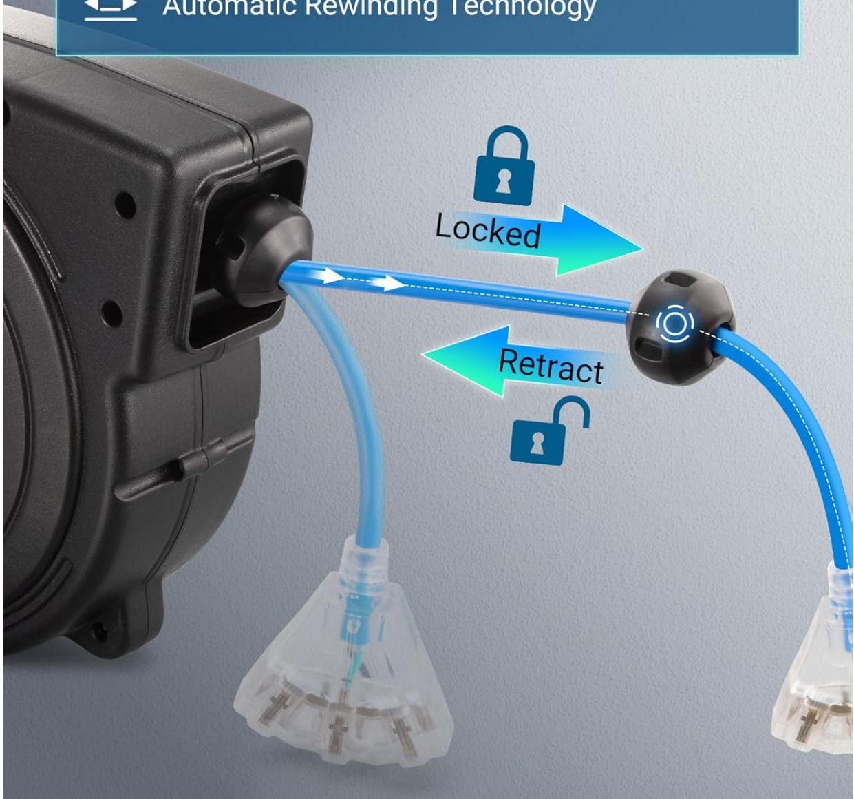
Image: Diagram showing the lock and automatic retract system, with arrows indicating locking at any length and automatic rewinding.