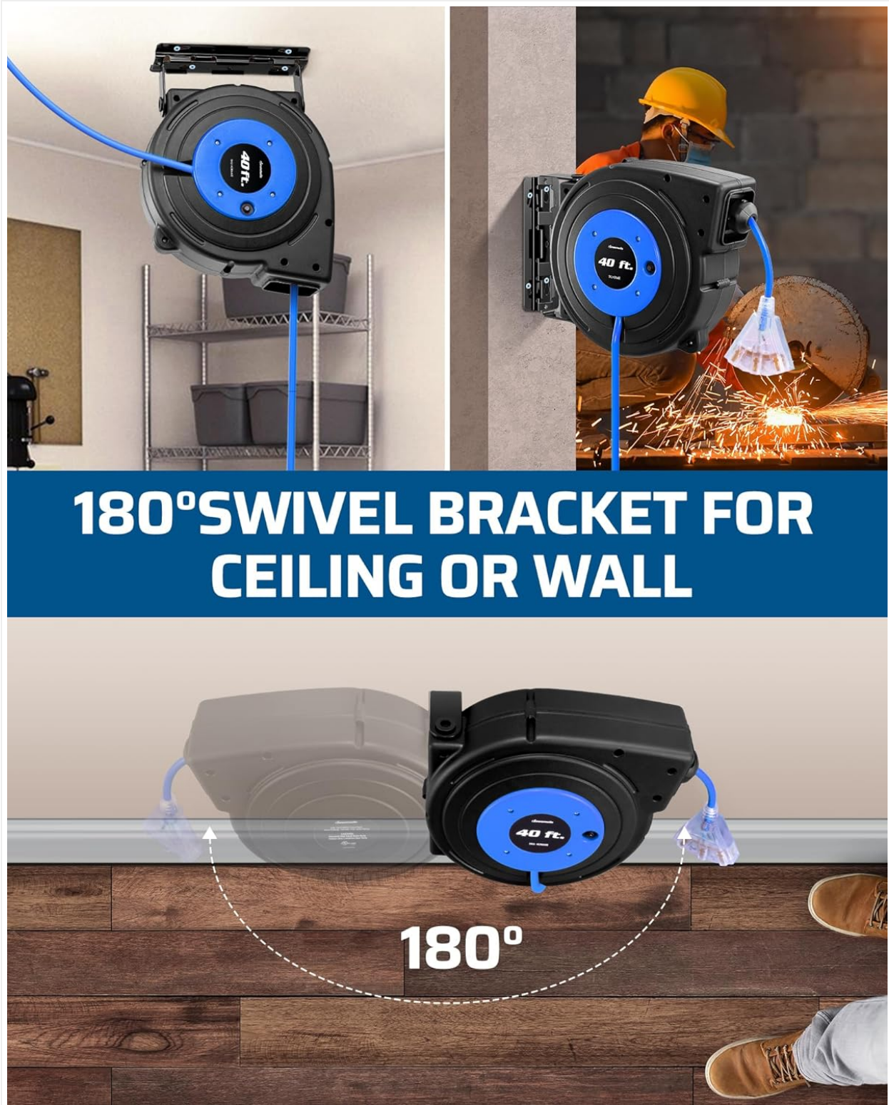
Image: Composite image demonstrating the 180-degree swivel capability of the mounting bracket for wall or ceiling installation.

Your browser does not support the video tag.