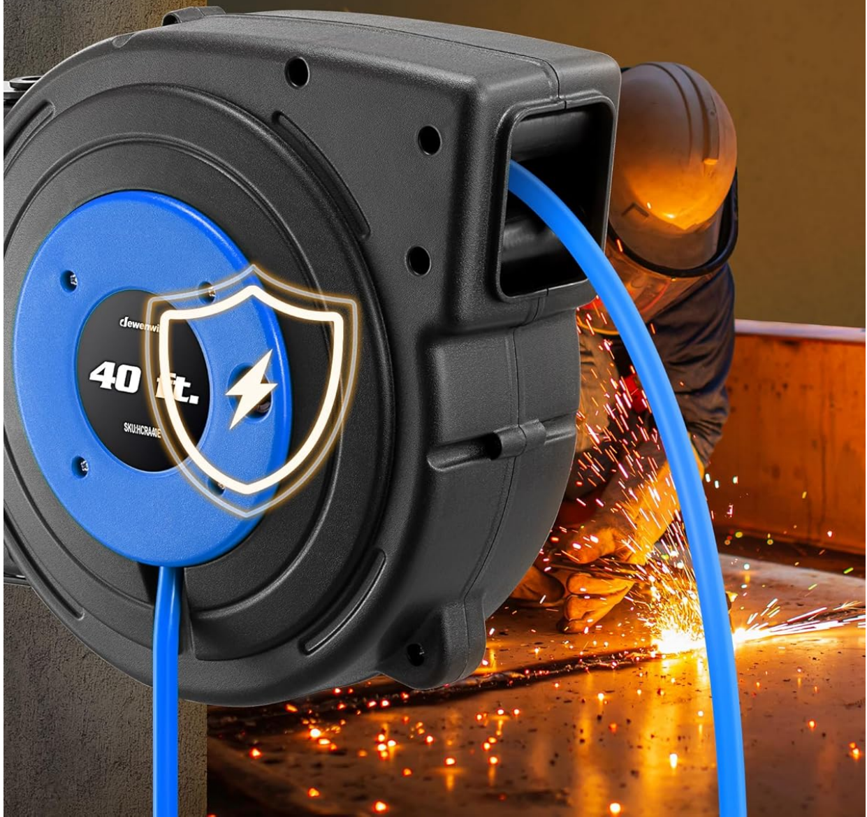
Image: Highlighting the built-in 15A circuit breaker with a reset button for overload protection.