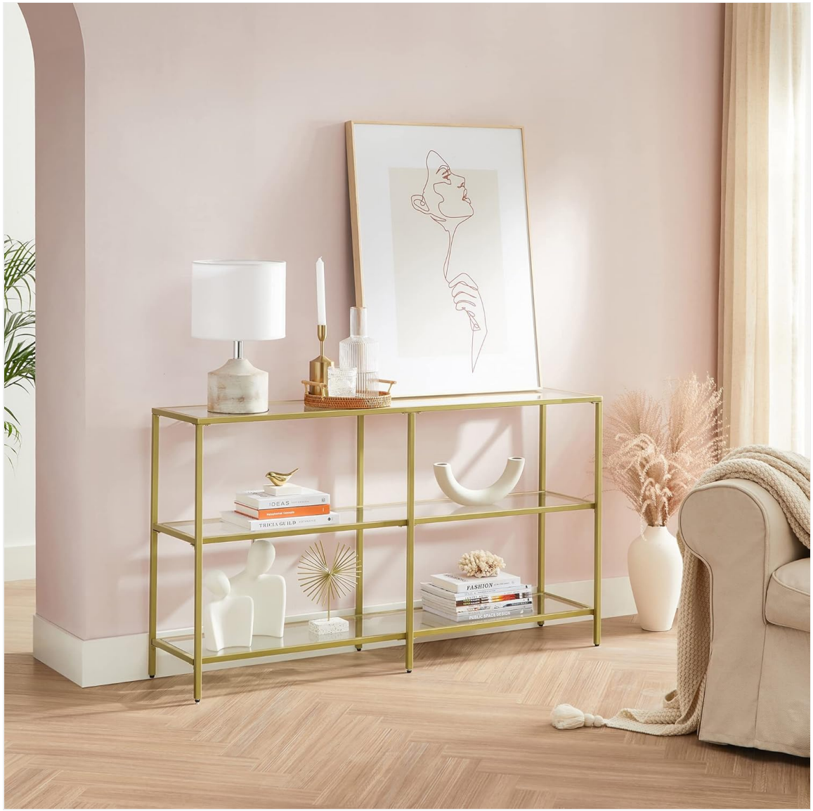
Image: The console table positioned in a living room, demonstrating its elegant appearance and suitability for displaying various items.