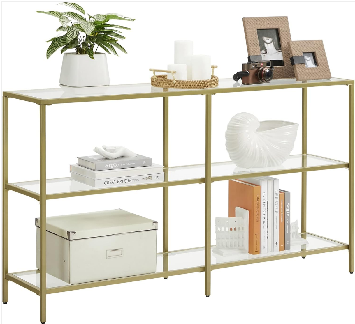
Image: The VASAGLE 51.2 Inch Console Table, showcasing its metallic gold frame and transparent tempered glass shelves.