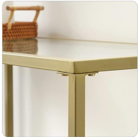
Image: A close-up shot emphasizing the 0.2-inch thickness of the tempered glass shelves, indicating durability.