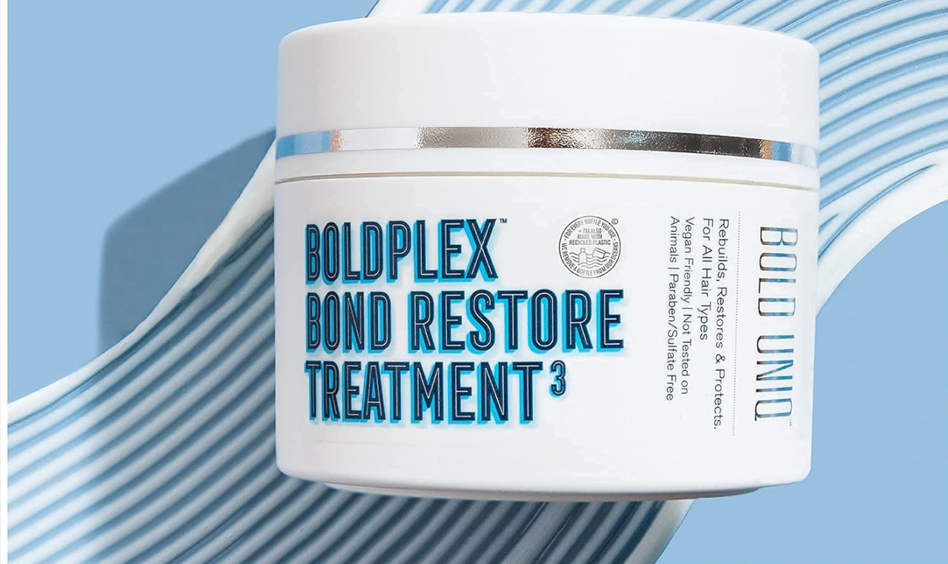
Image: Visual illustrating the hydrating and conditioning benefits of Boldplex 3 Bond Repair Treatment for curly, frizzy, dry, broken, colored, and bleached hair.