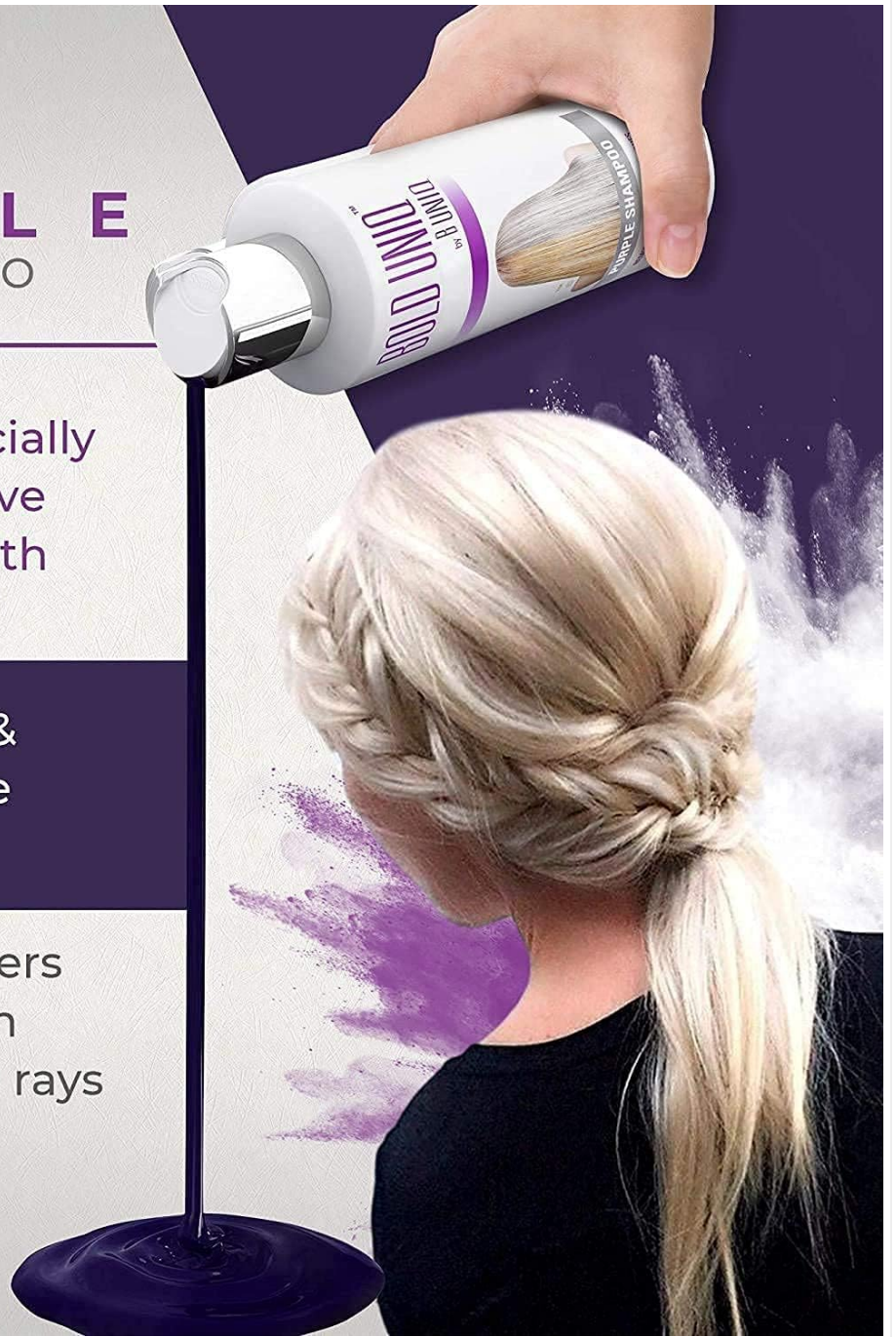
Image: Illustration of applying BOLD UNIQ Purple Shampoo, highlighting its non-drying formula, frizz reduction, and UV protection benefits.