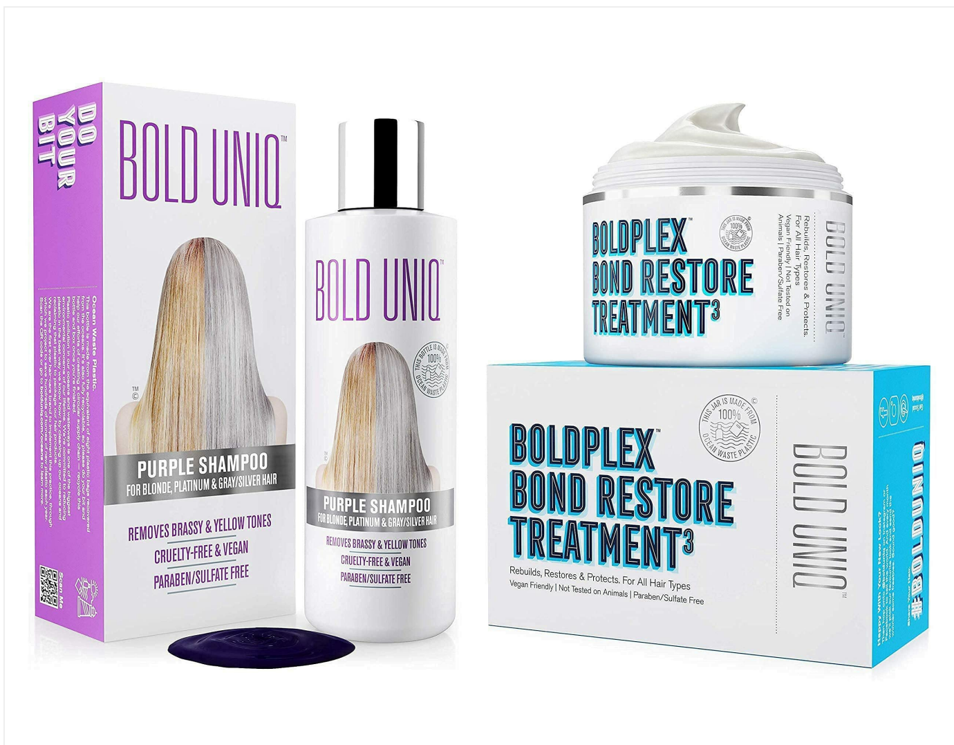
Image: The BOLD UNIQ Purple Shampoo and Boldplex 3 Bond Repair Hair Treatment Bundle, showing both product bottles.