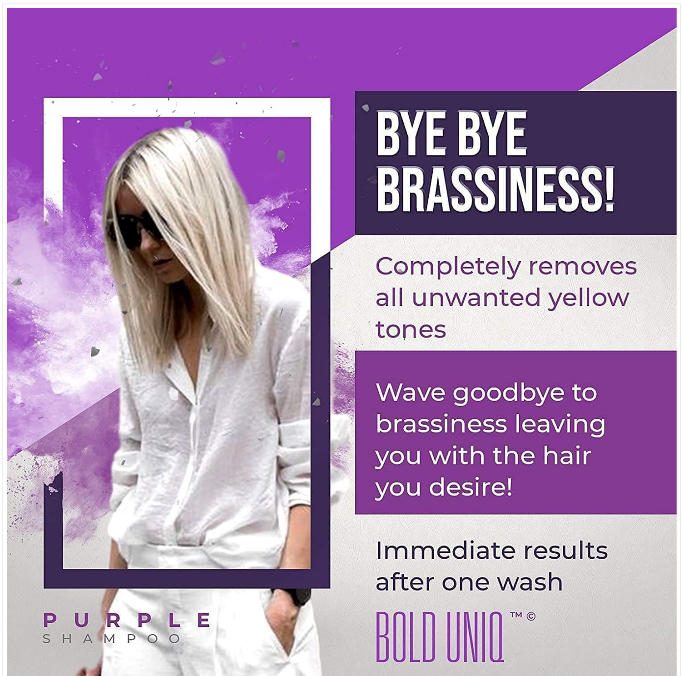
Image: Visual demonstrating the Purple Shampoo's effect in removing unwanted yellow tones and brassiness from hair.