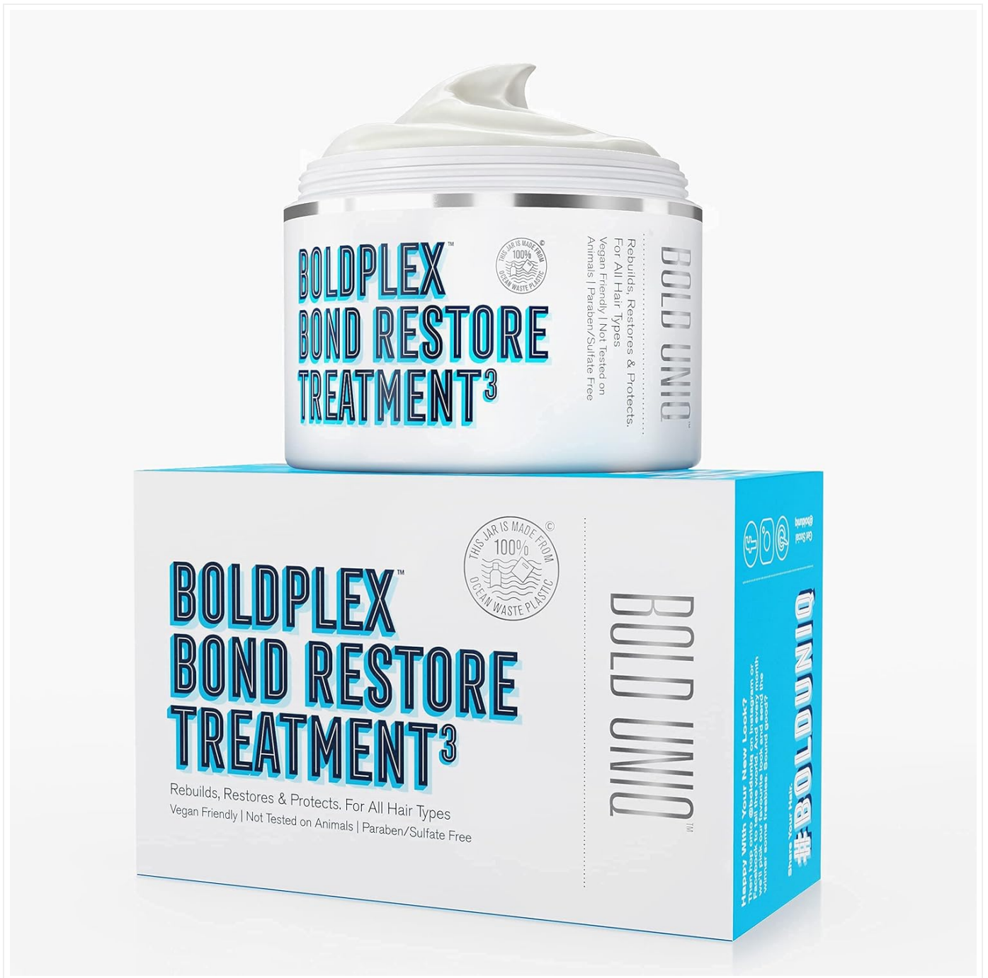
Image: The BOLD UNIQ Boldplex 3 Bond Restore Treatment jar and packaging.