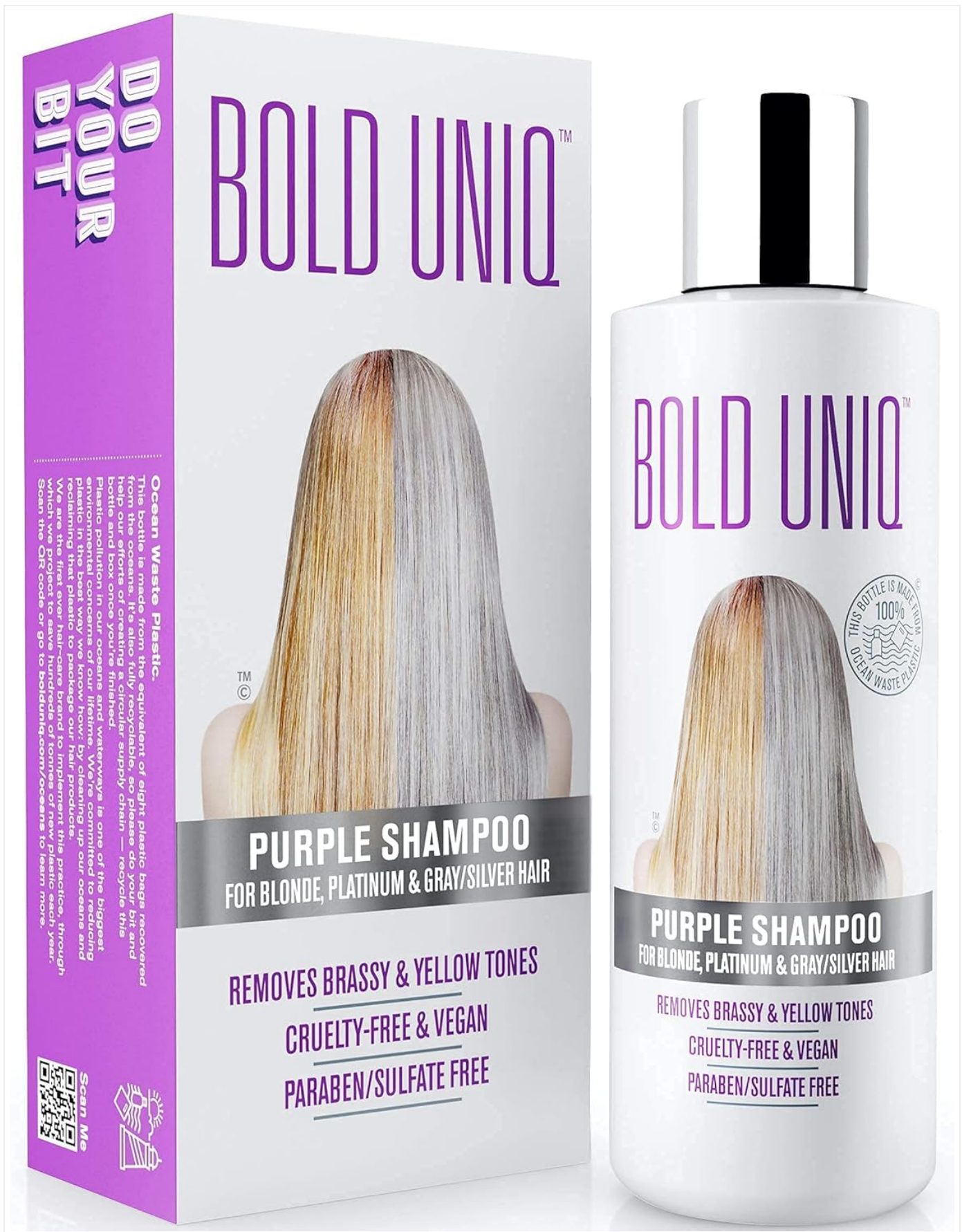
Image: BOLD UNIQ Purple Shampoo packaging, indicating it is made from 100% ocean waste plastic. More information can be found here .