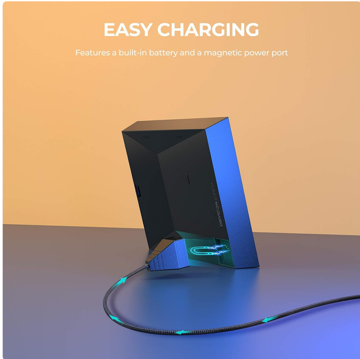
Image: The Dragon Touch Modern 10 Digital Picture Frame charging via its magnetic power port.

Carefully remove the digital picture frame and all accessories from the packaging. Connect the magnetic charging cable to the designated port on the back of the frame. Plug the power adapter into a wall outlet to power on the device.