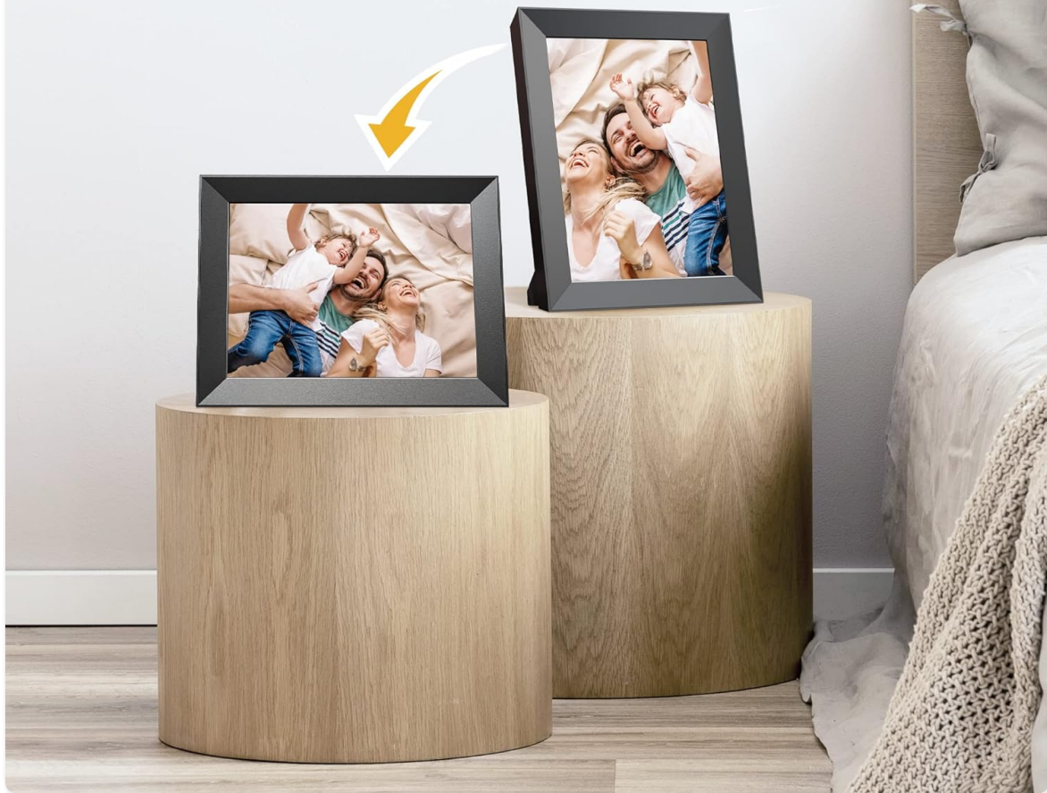
Image: Two digital frames illustrating the automatic rotation of images when the frame orientation changes.

Automatic rotation makes the photos always be right-side-up.