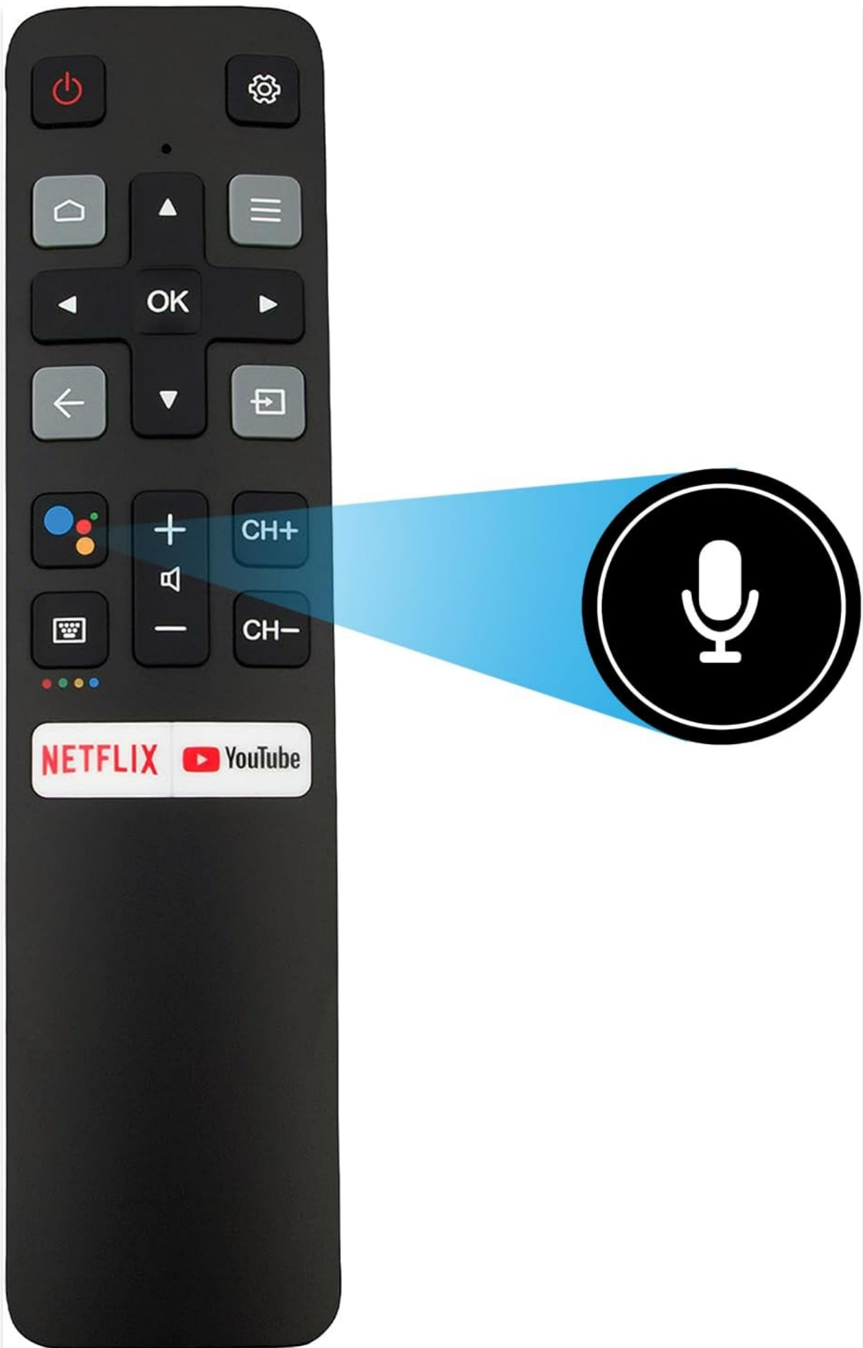
Figure 2: The remote control with an overlay indicating the voice search function, accessible via the dedicated microphone button.