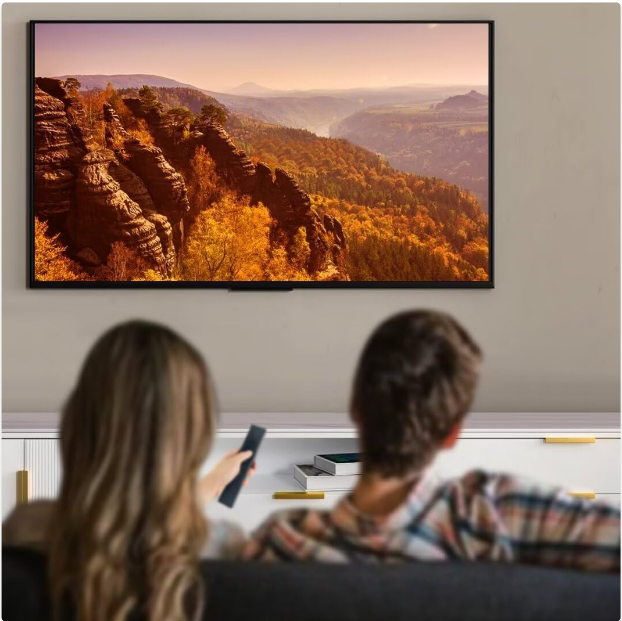
Figure 3: Illustrative image of a user operating the remote control while watching television.