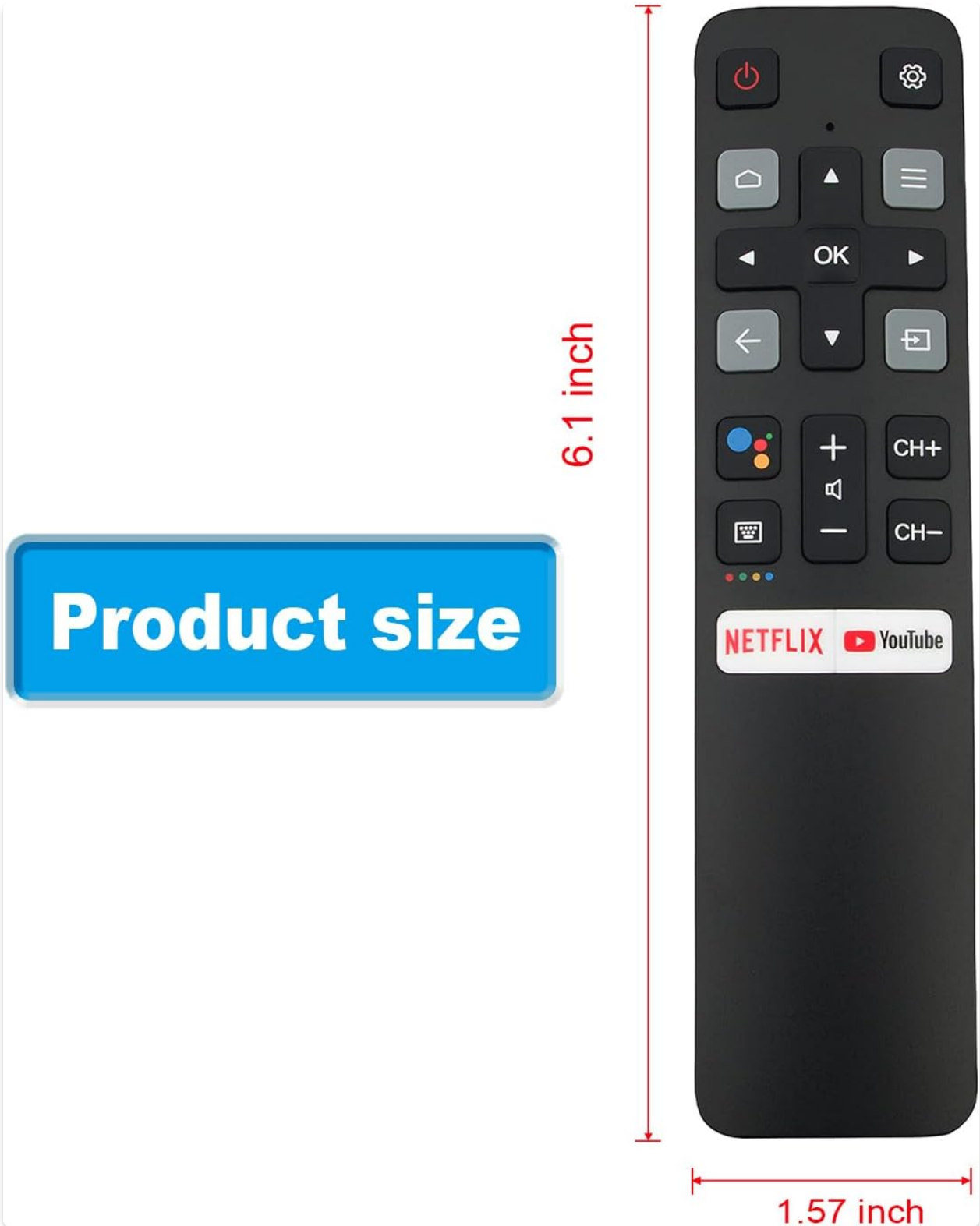
Figure 4: Dimensional diagram of the RC802V remote control, indicating its length of 6.1 inches and width of 1.57 inches.