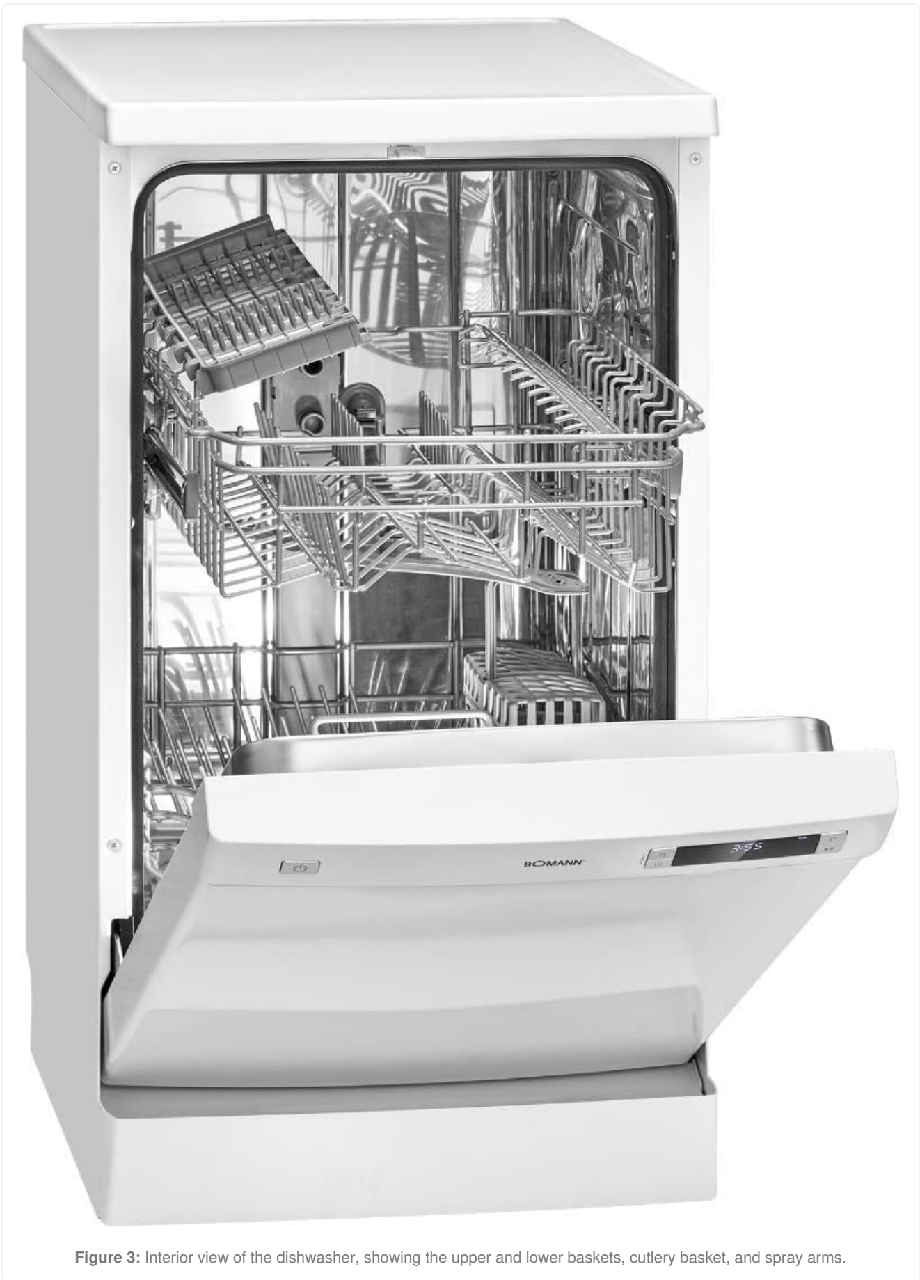
Figure 3: Interior view of the dishwasher, showing the upper and lower baskets, cutlery basket, and spray arms.