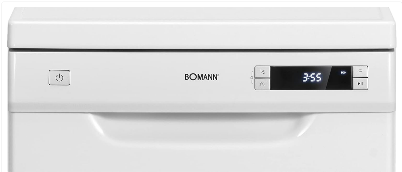
Figure 2: Close-up of the control panel with LED display, power button, program selection, and delay start options.