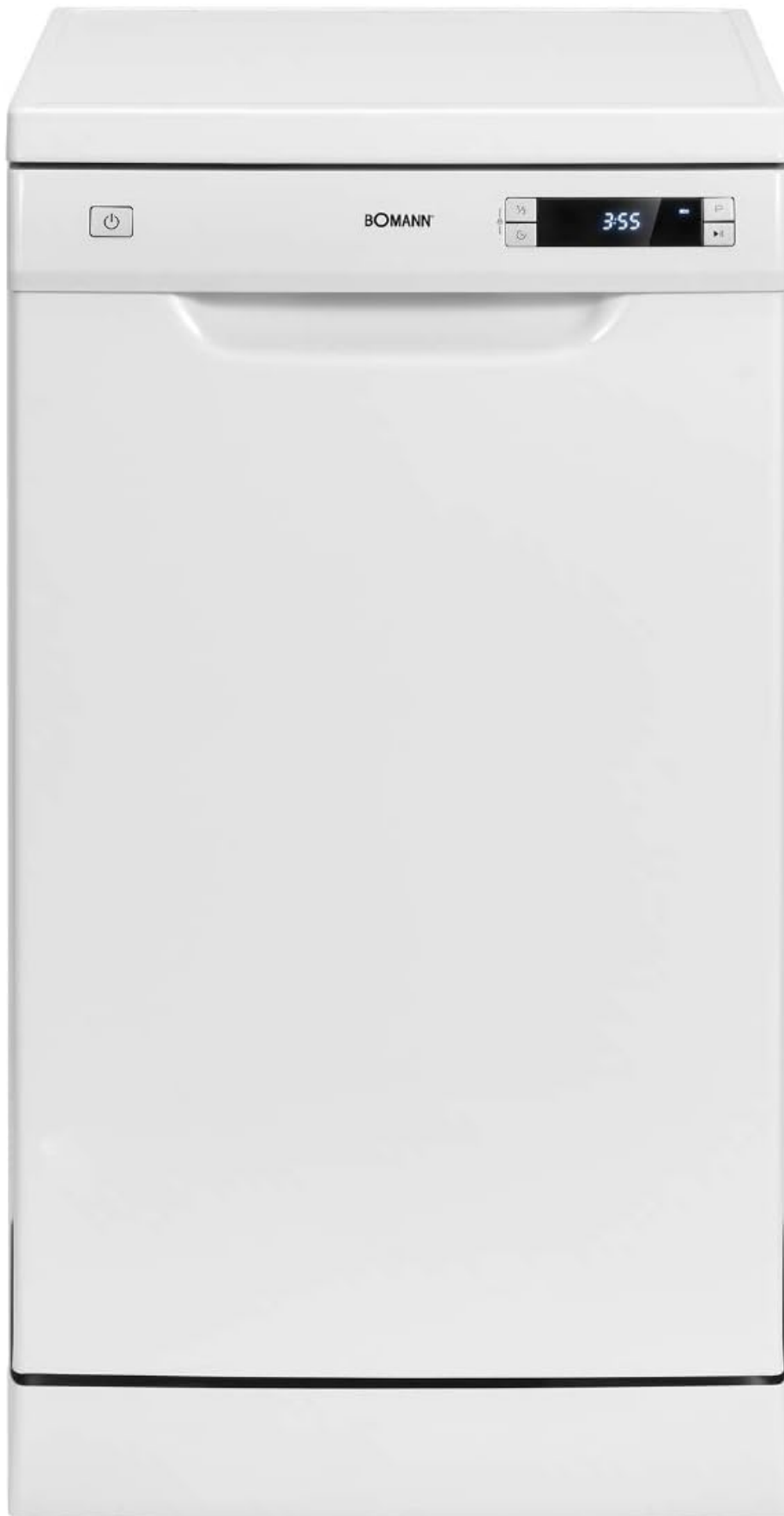
Figure 1: Front view of the Bomann GSP 7407 Dishwasher, showcasing its compact design and control panel.