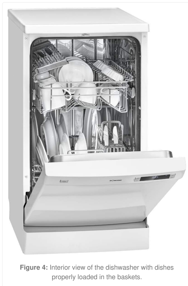
Figure 4: Interior view of the dishwasher with dishes properly loaded in the baskets.