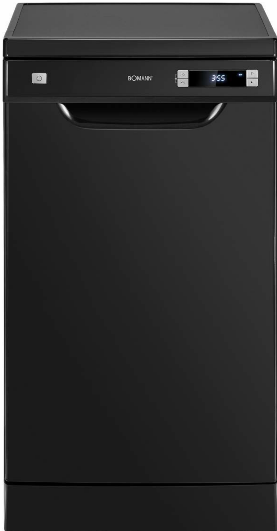
Figure 1: Front view of the Bomann GSP 7407 dishwasher.

This image displays the front of the Bomann GSP 7407 dishwasher, highlighting its sleek black finish and the integrated control panel at the top of the door.