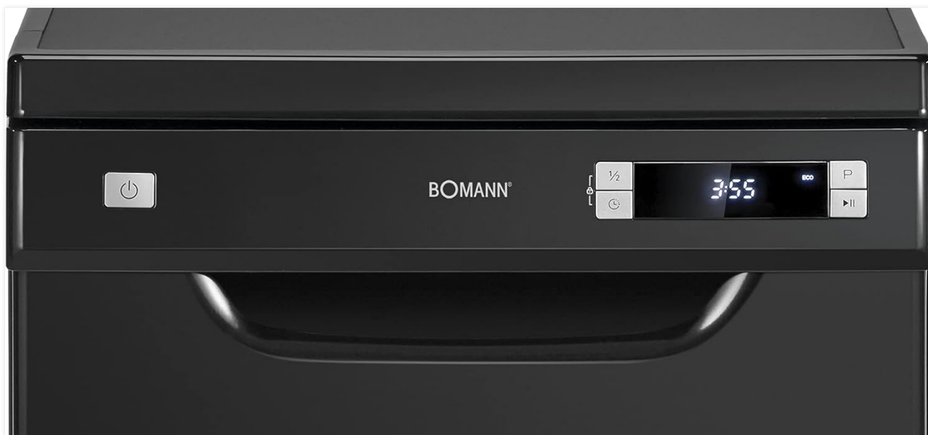
Figure 2: Control Panel.

A detailed view of the dishwasher's control panel, featuring an LED display showing the remaining time, power button, program selection buttons, and indicators for salt and rinse aid.