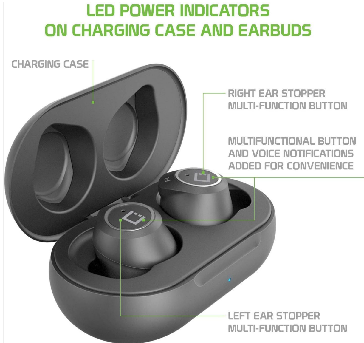
Image: A detailed view of the earbuds within their charging case, highlighting the location of the right and left earbud's multi-function buttons and LED power indicators.