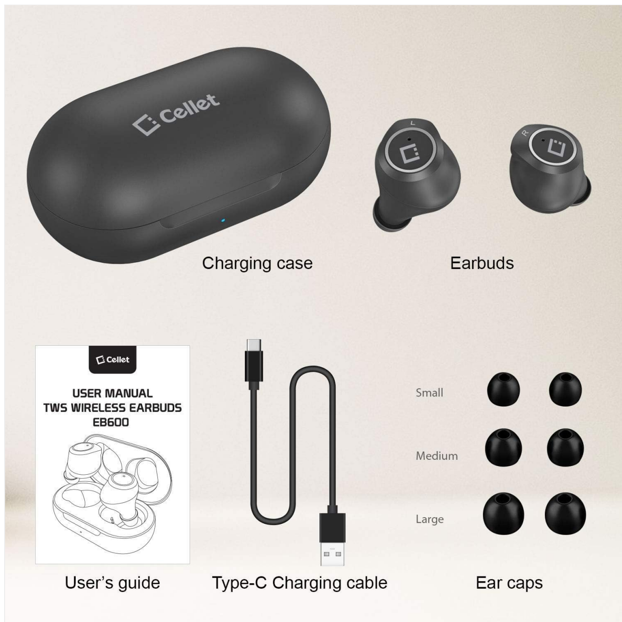
Image: A visual representation of all items included in the product package: the charging case, two earbuds, a user guide, a Type-C charging cable, and sets of small, medium, and large ear caps.