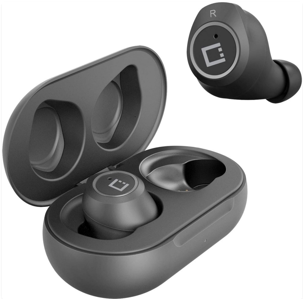
Image: Cellet Wireless V5 Bluetooth Earbuds and their charging case. The earbuds are black, compact, and designed for in-ear use, with the charging case open to show the earbuds nestled inside.