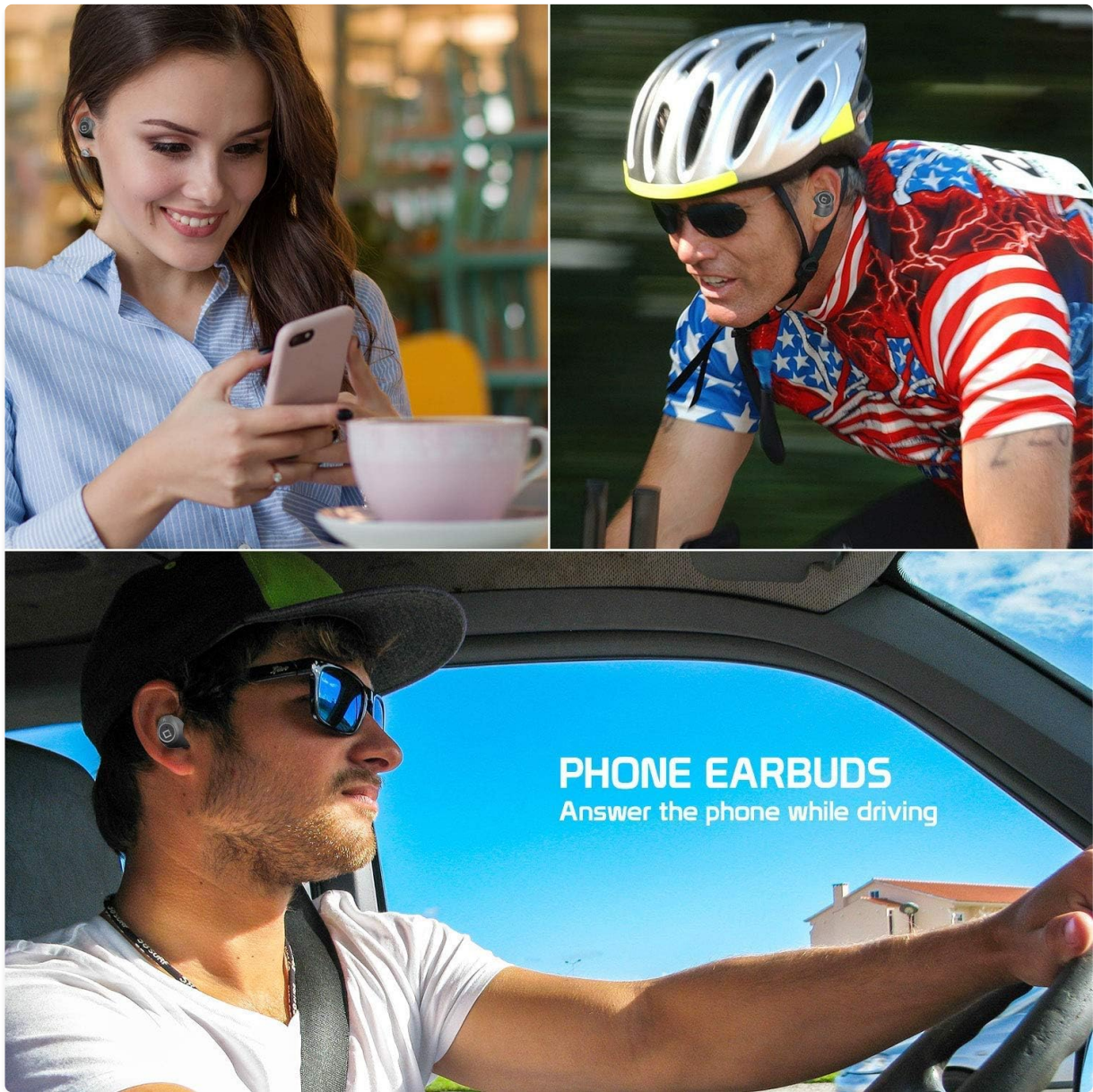
Image: A collage of three images showing individuals using the Cellet earbuds: one person smiling while looking at a phone, another cycling, and a third driving, highlighting the versatility of the earbuds for different activities.