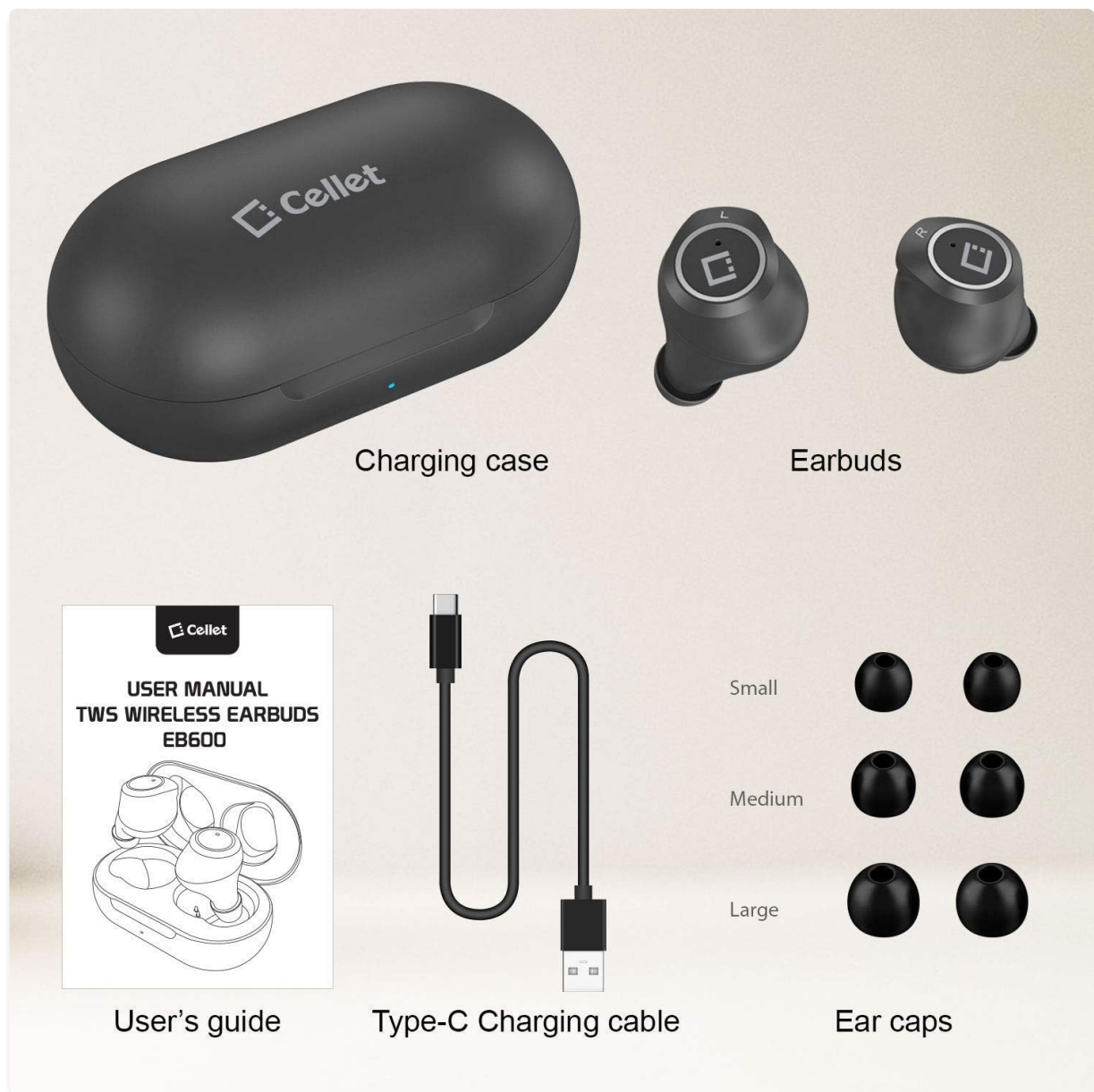
Image: A flat lay of all items included in the package: the charging case, two earbuds, a user manual, a USB-C charging cable, and three pairs of ear caps (small, medium, large).