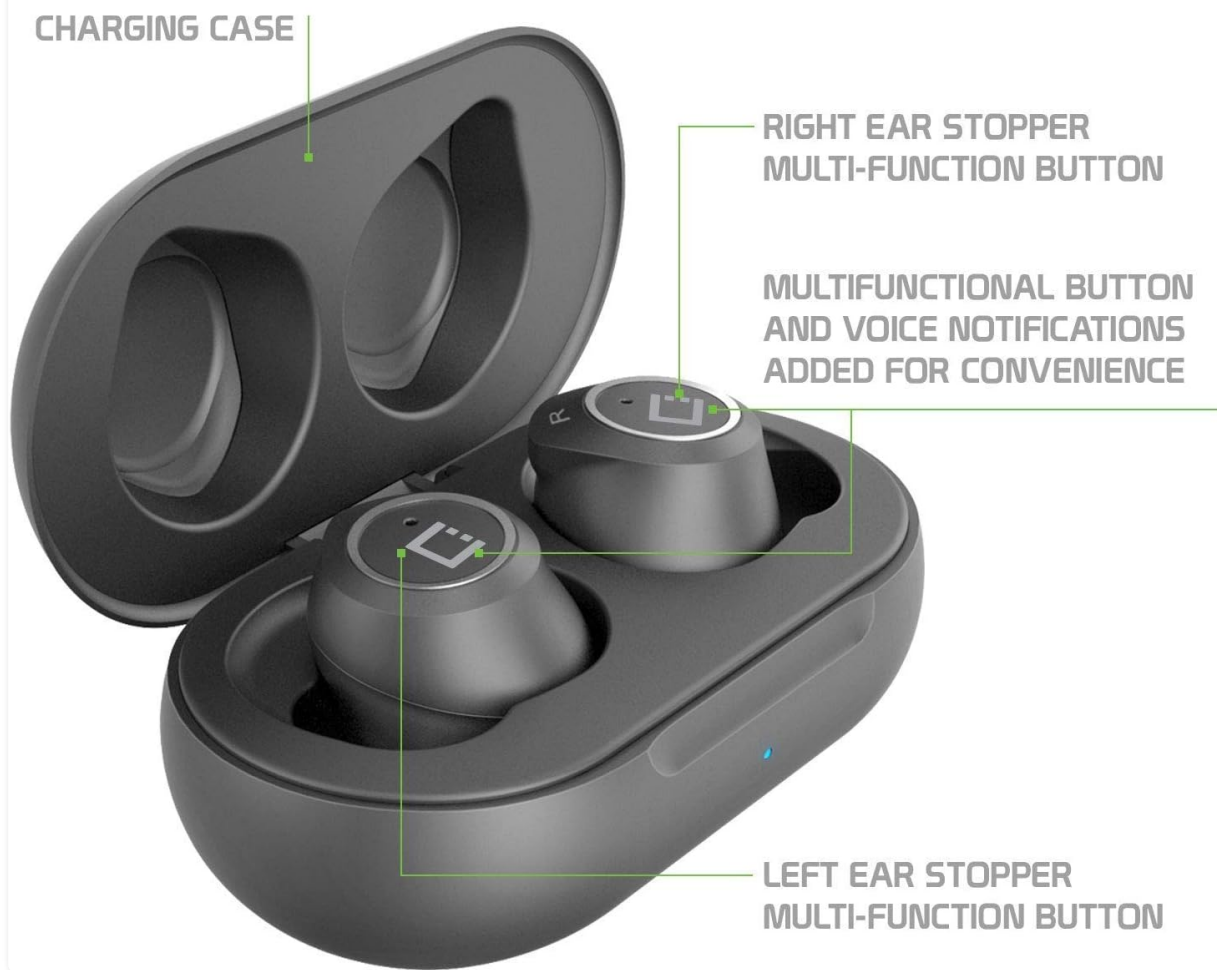
Image: A diagram showing the Cellet charging case and earbuds. Labels point to the 'Right Ear Stopper Multi-Function Button' and 'Left Ear Stopper Multi-Function Button', highlighting their location and indicating LED power indicators.