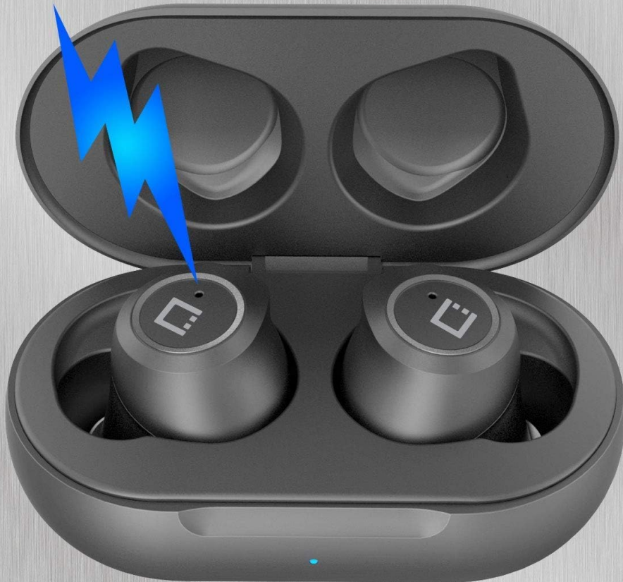
Image: The Cellet charging case with earbuds inside, showing a blue lightning bolt graphic indicating the charging process. The case has a sleek, black design.

Charging Case Battery: 300mAh Charging Time: About 1.5 hours Music Playing Time: 3-4 hours Calling Talk Time: 3-4 hours