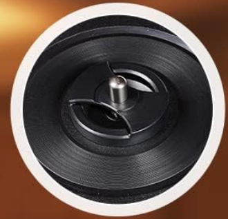
45 RPM Adapter