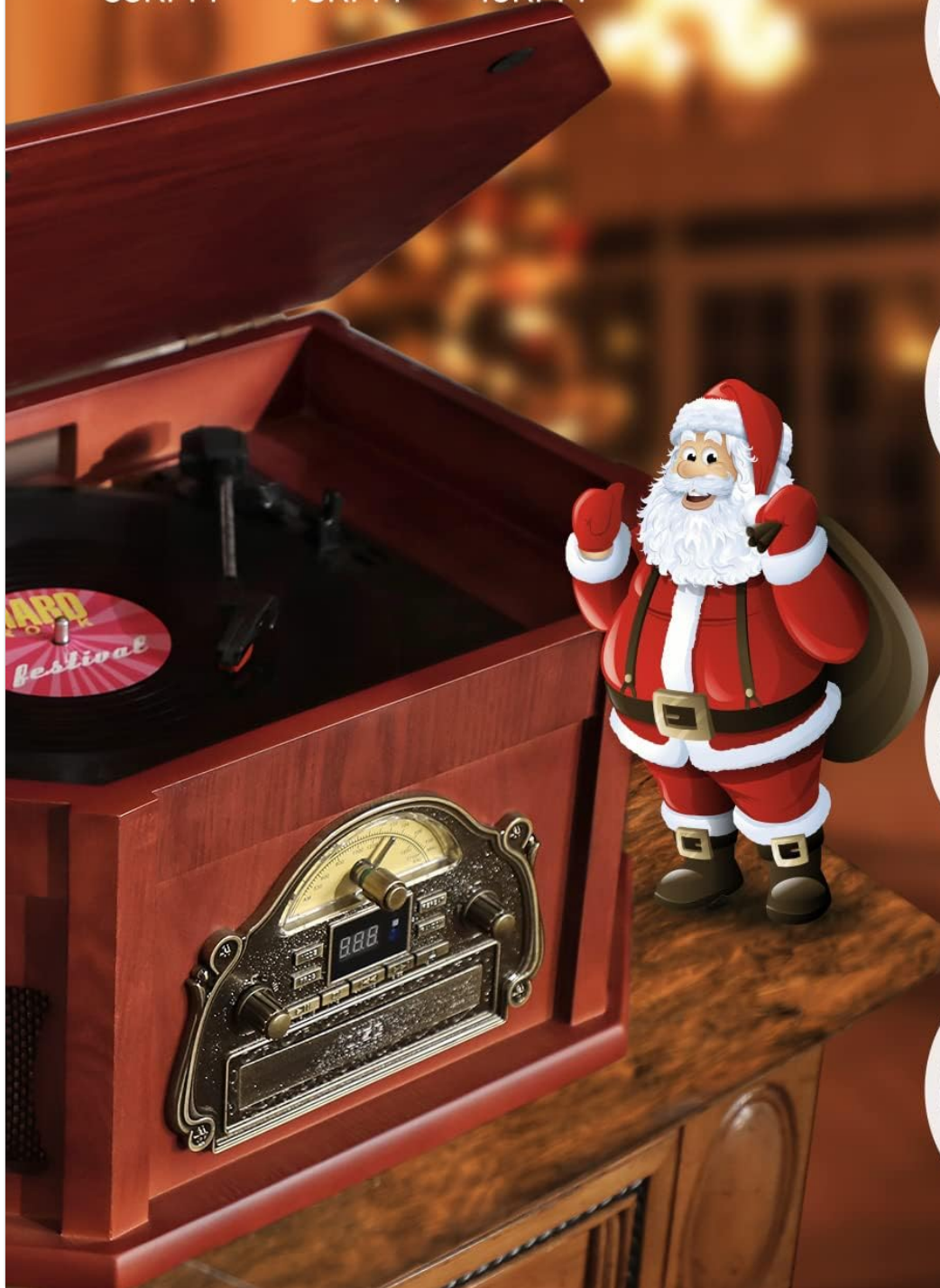
Figure 2: The ORCC record player with its lid open, revealing the turntable and the vintage-style control panel.