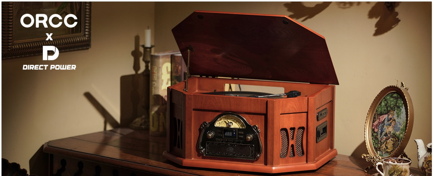
Figure 1: The ORCC 10-in-1 Nostalgic Record Player, highlighting its multi-functional capabilities including Vinyl, CD, Bluetooth, Cassette, Headphone, SD/MMC, USB, FM/AM, and RCA out/Aux in.

This manual provides detailed instructions for the operation and maintenance of your ORCC 10-in-1 Nostalgic Record Player. This versatile audio system combines a turntable, CD player, cassette player, AM/FM radio, Bluetooth receiver, USB, and SD card playback capabilities. Please read this manual thoroughly before use to ensure proper function and longevity of your device.