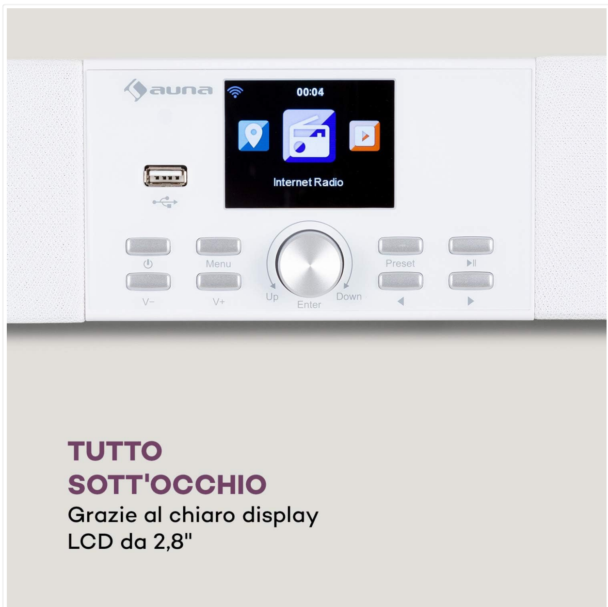
Figure 1: Clear 2.8-inch LCD display for easy navigation.

The front panel features the main controls and the 2.8-inch LC display for easy navigation and status updates.