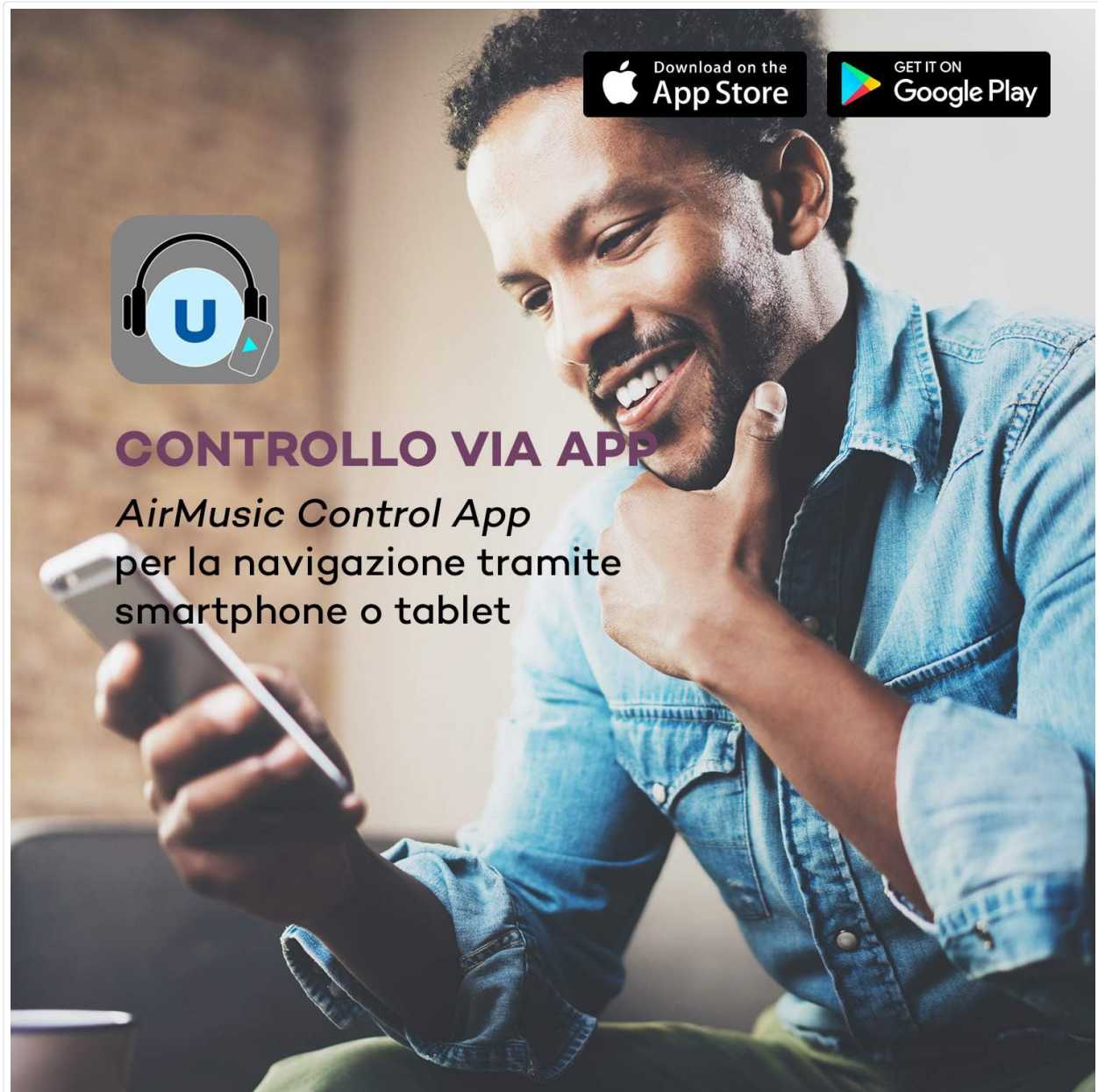
Figure 8: Control via AirMusic Control App for smartphone or tablet navigation.

Control your soundbase conveniently using the AirMusic Control App on your smartphone or tablet.