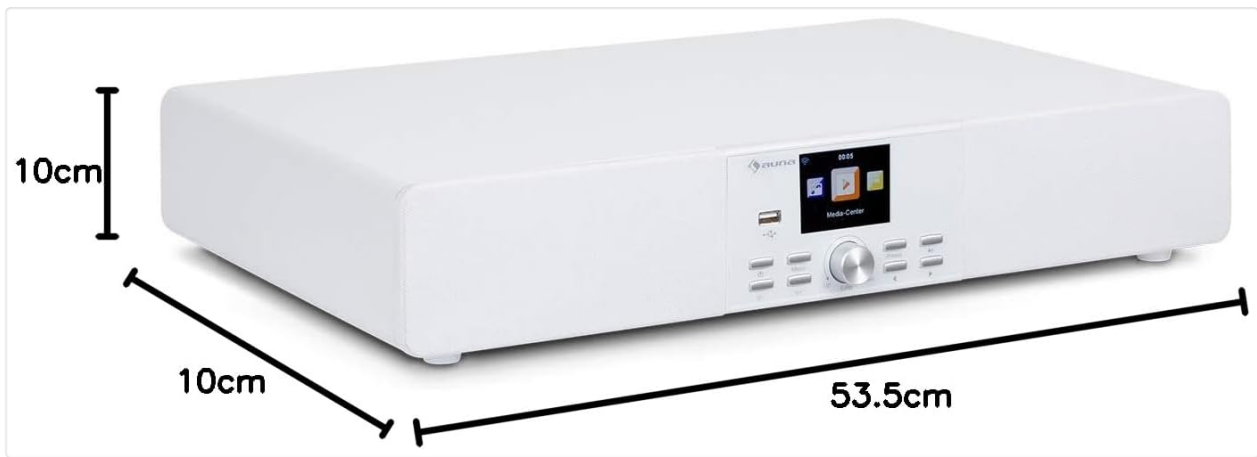
Figure 5: Product dimensions for optimal placement.

Dimensions: Approximately 53.5 cm (Length) x 10 cm (Width) x 10 cm (Height).