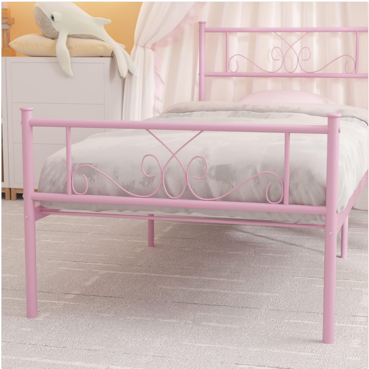
Figure 4: The bed frame offers ample under-bed storage space.