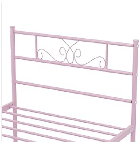
Figure 2: Example of a frame connection point during assembly.