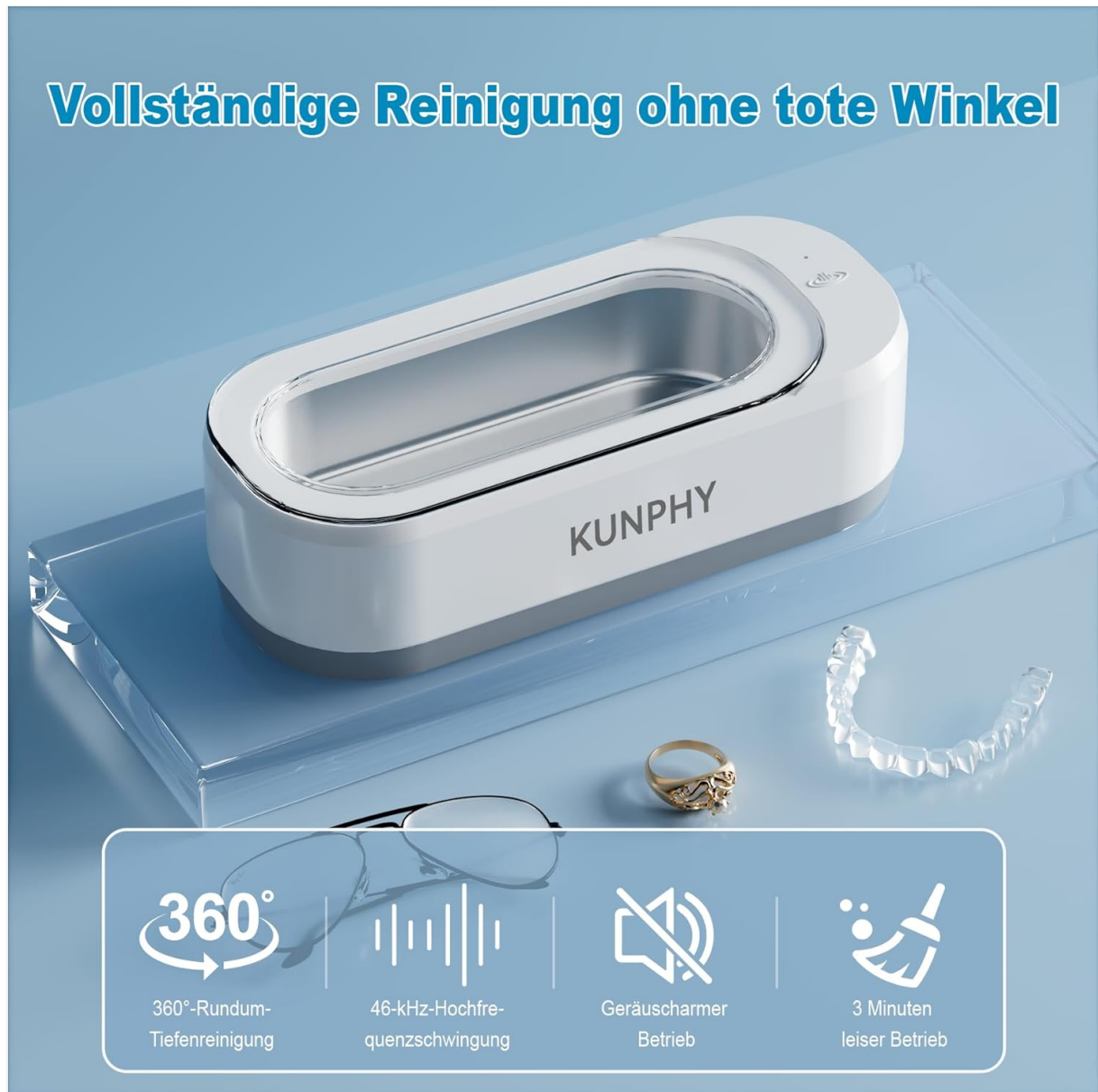
Image 1: KUNPHY 350ml Ultrasonic Cleaner showing its compact design and items it can clean.