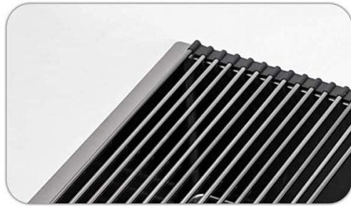
Stainless Steel drying rack