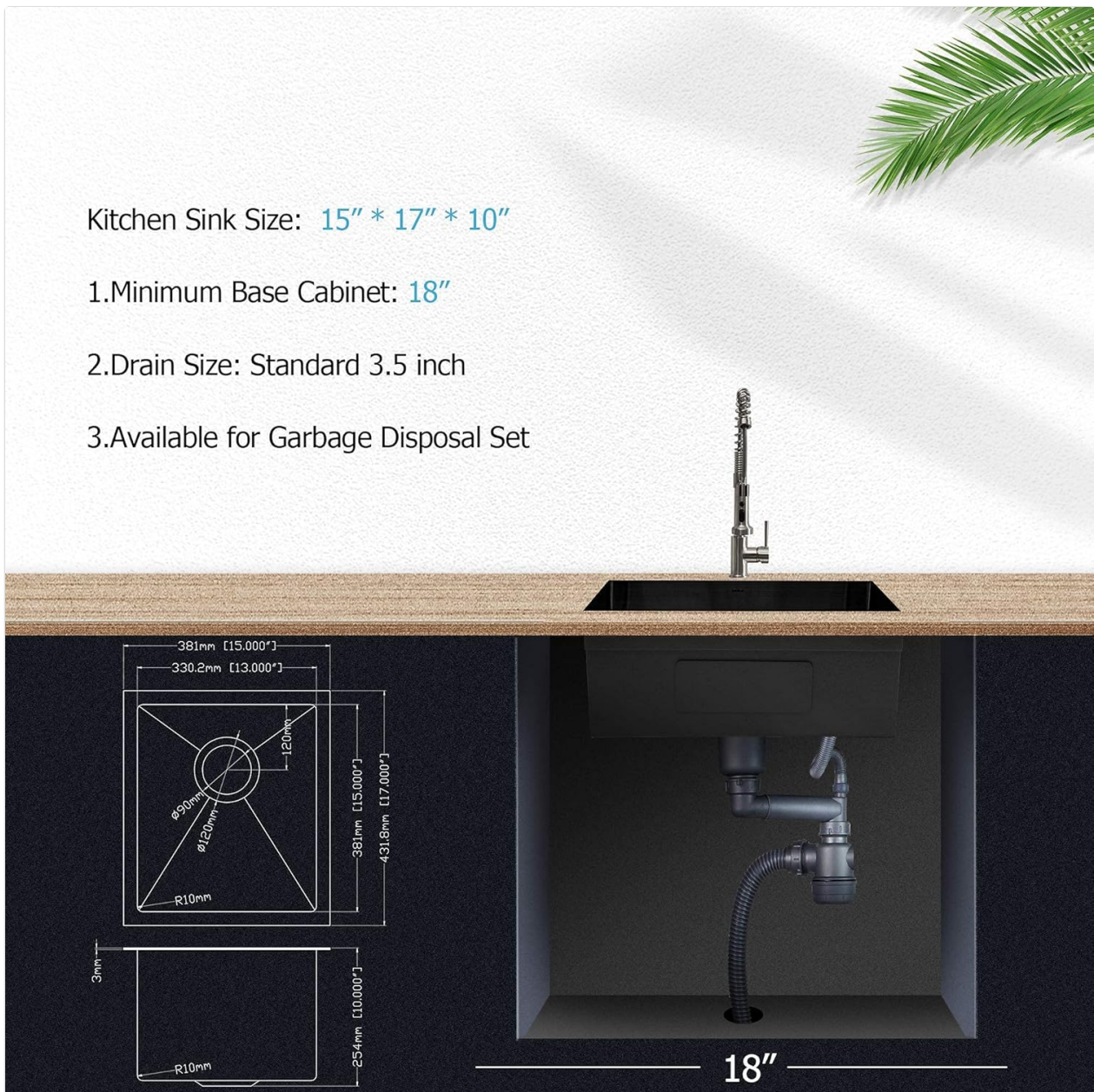
Figure 4: Sink dimensions and minimum base cabinet size for installation.

Video 1: Official Lordear undermount kitchen sink installation guideline. This video demonstrates the general steps for installing an undermount sink, including preparing the countertop, securing the sink, and installing the drain.