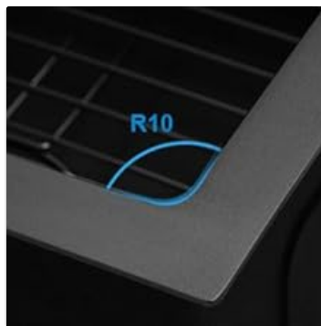
Figure 2: Patented X-shaped water diversion design for optimal drainage.