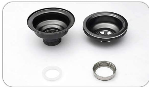
Stainless Steel strainer