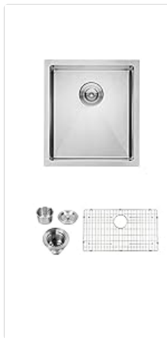
Figure 5: Water-repellent Nano brushed surface for easy cleaning.