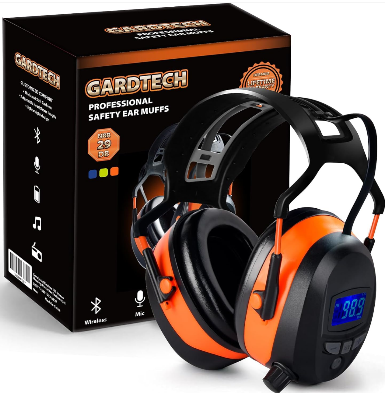
Image: Gardtech Hearing Protection Earmuffs, showing the product and its retail packaging.