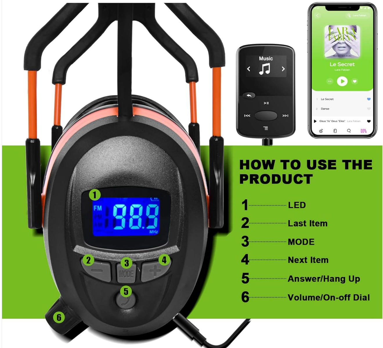
Image: Detailed diagram highlighting key features and controls on the earmuff, including LED display, mode button, volume/on-off dial, and track navigation buttons.