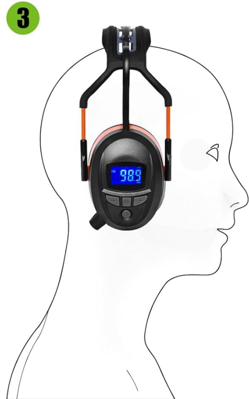
Image: Visual guide demonstrating how to adjust the headband and earcups for an optimal and comfortable fit.