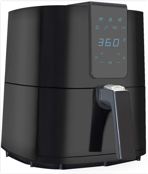
Figure 3.2: Angled view of the air fryer, highlighting its sleek black design and compact form factor suitable for countertops.