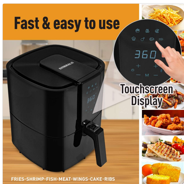
Figure 5.1: Close-up of the digital touchscreen display, showing temperature and time controls, along with various preset icons.

The Emerald Air Fryer features a user-friendly digital touch display for easy operation.