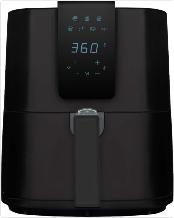
Figure 3.1: Front view of the Emerald Air Fryer, showcasing the digital LED touch display and the handle for the cooking basket.

Familiarize yourself with the main parts of your Emerald Air Fryer: