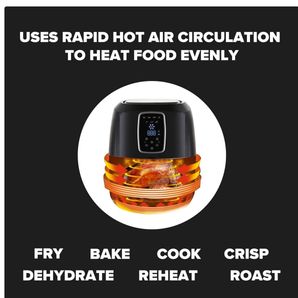
Figure 5.2: Illustrates the rapid hot air circulation technology used by the air fryer to cook food evenly and efficiently.