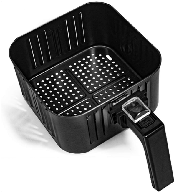
Figure 3.3: The removable non-stick basket and pan, designed for easy food placement and cleaning. The basket features perforations for optimal air circulation.