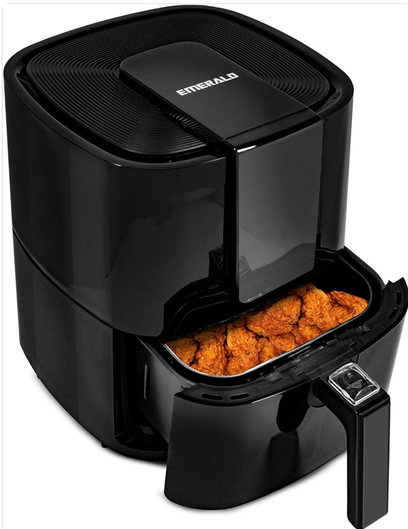
Figure 3.4: The air fryer with its basket pulled out, demonstrating the ample cooking space and how food is contained within the non-stick pan.

The Emerald Air Fryer features a main unit housing the heating element and fan, a removable non-stick cooking basket, and a slide-out pan. The intuitive digital LED touch display allows for precise control over cooking settings.