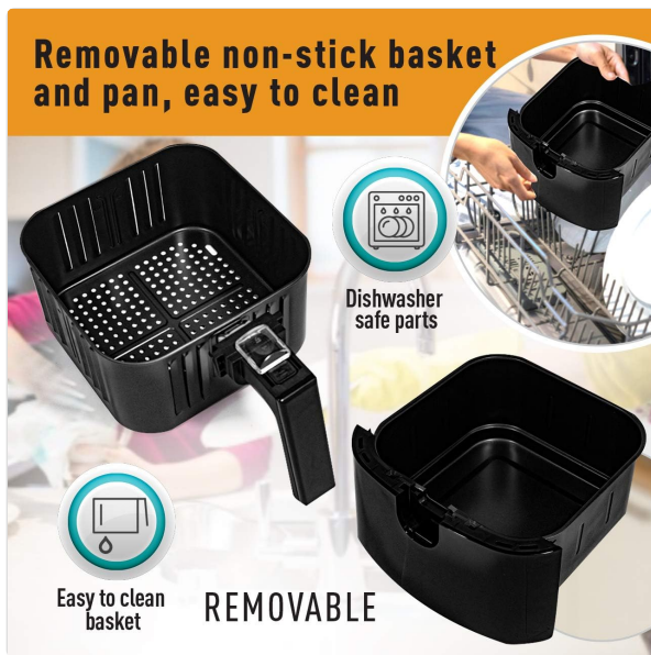
Figure 6.1: Illustration of the removable non-stick basket and pan, highlighting their ease of cleaning and dishwasher-safe properties.