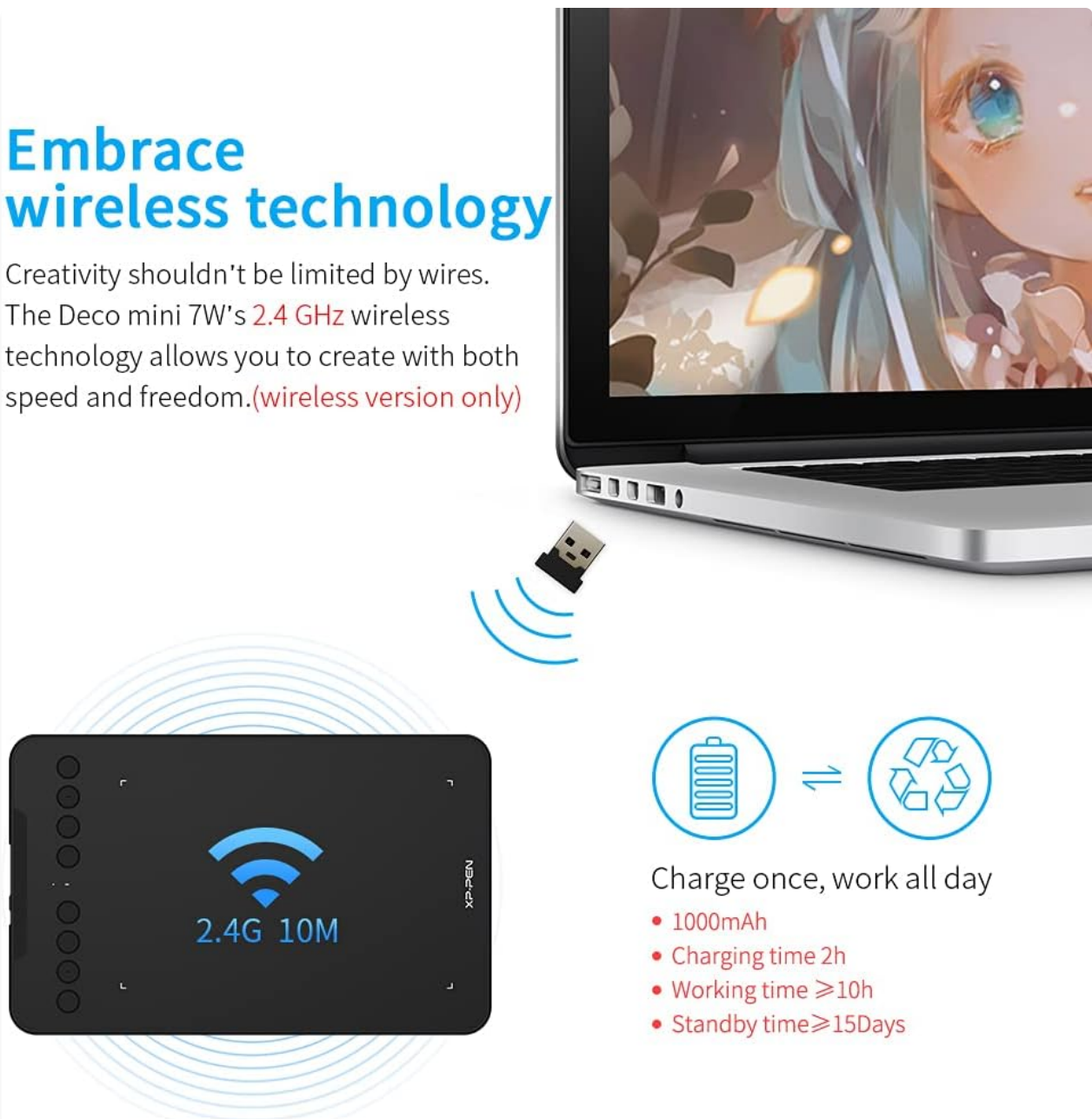
Image 3.2: The Deco mini7W connects wirelessly to your PC or laptop by plugging the USB dongle into your computer.

Creativity shouldn't be limited by wires. The Deco mini 7W's 2.4 GHz wireless technology allows you to create with both speed and freedom. (wireless version only)