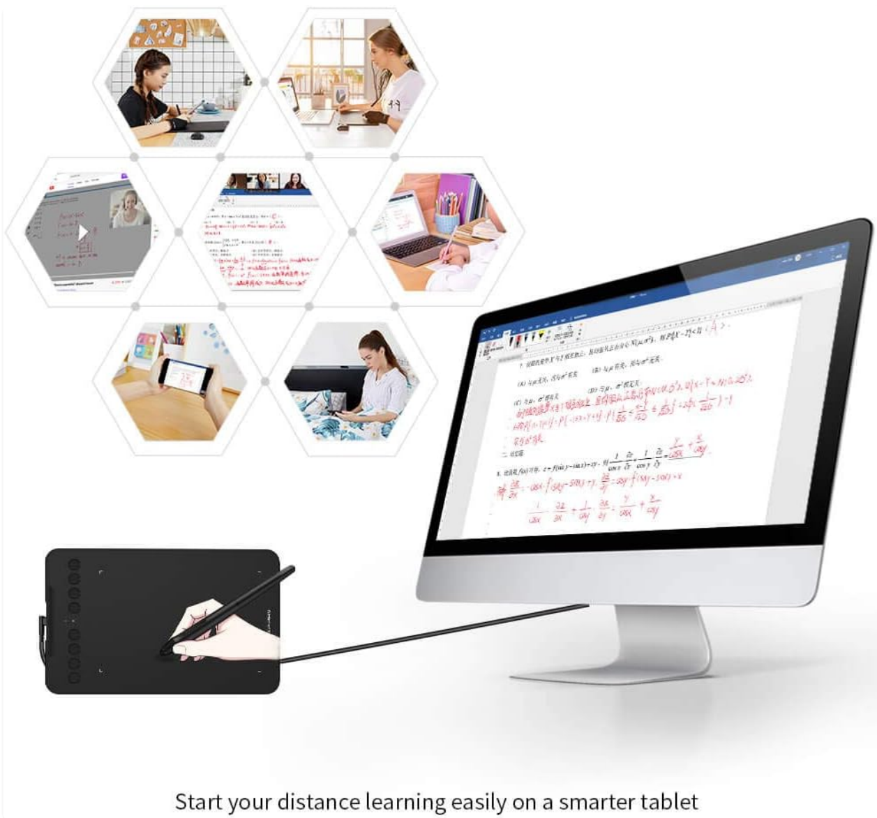
Image 4.2: The Deco mini7W is ideal for online teaching and e-learning, allowing for interactive annotation and drawing.