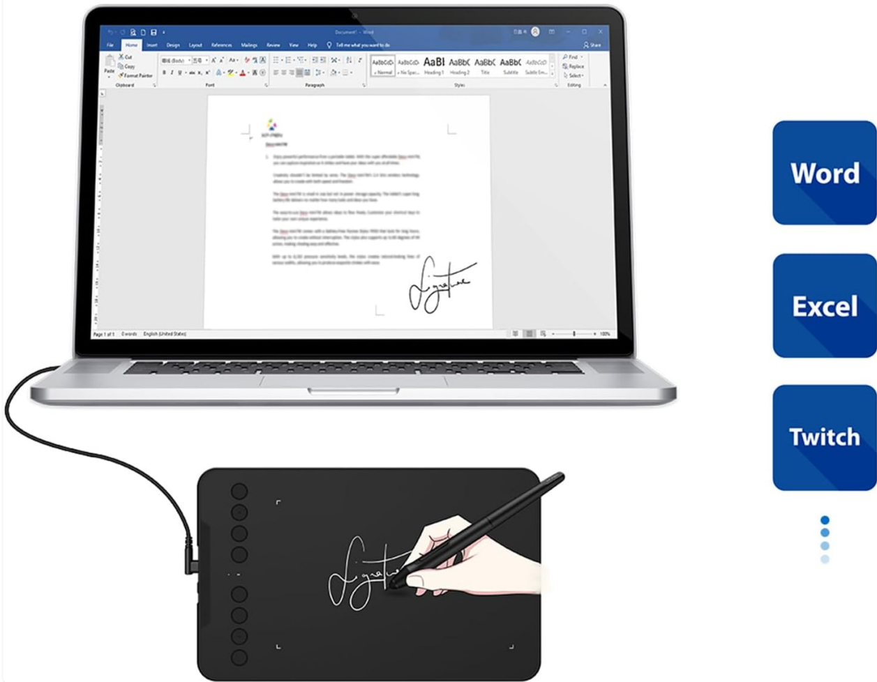
Image 4.3: The tablet can be used for light office work, including digital signatures and note-taking.