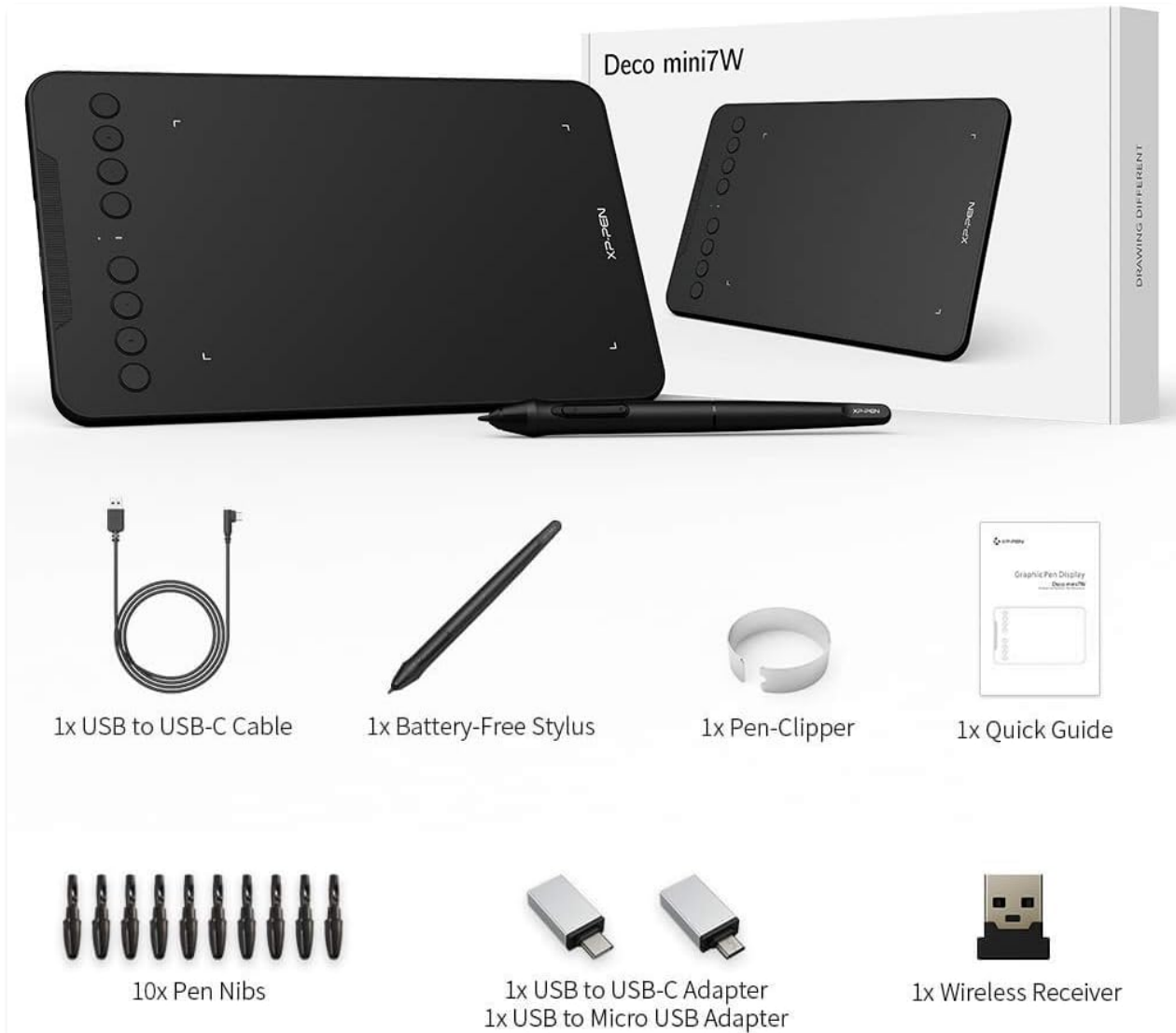
Image 2.1: Contents of the XPPen Deco mini7W package, including the tablet, pen, cables, adapters, and accessories.