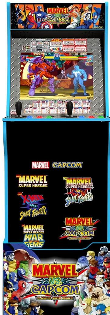
Image: The Arcade1Up Marvel vs Capcom machine showing the character selection screen for a game, with the dual joysticks and colorful buttons visible on the control panel.

For games supporting online multiplayer, ensure your machine is connected to Wi-Fi. Access the online mode from the game's menu to find and join available game rooms or create your own to play with friends.