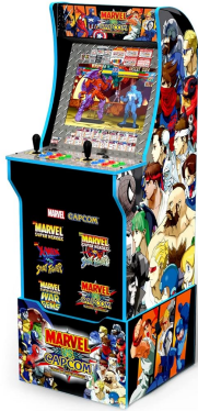
Image: A different angled perspective of the Arcade1Up Marvel vs Capcom cabinet, highlighting its full-size appearance and integrated riser.

Capcom machine, providing a clear look at the game screen, control panel, and the overall cabinet design.