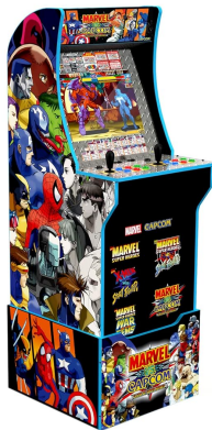
Image: An angled view of the Arcade1Up Marvel vs