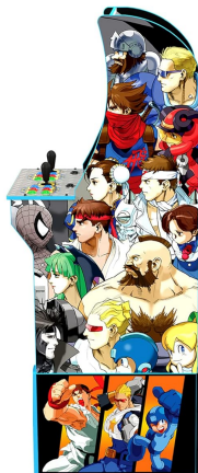
Image: The opposite side panel of the Arcade1Up Marvel vs Capcom machine, featuring additional character artwork from the Marvel and Capcom universes.

Image: A different angled perspective of the Arcade1Up Marvel vs Capcom cabinet, highlighting its full-size appearance and integrated riser.