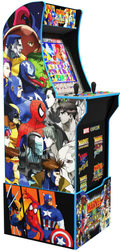
Image: The Arcade1Up Marvel vs Capcom machine shown with its custom matching stool, both adorned with vibrant Marvel character artwork.