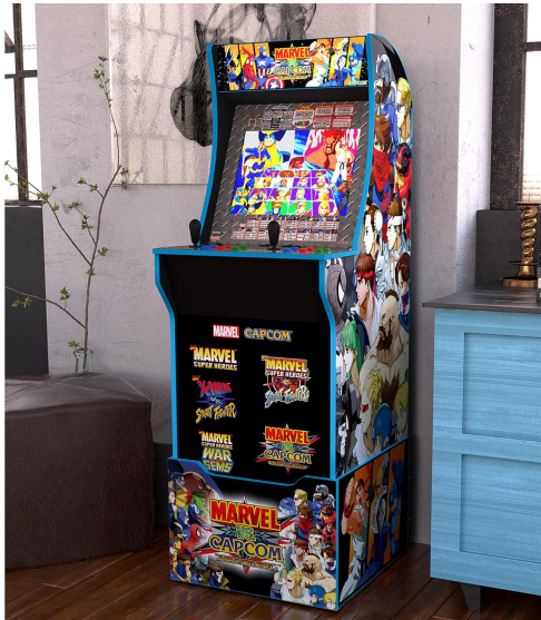
Image: A full view of the Arcade1Up Marvel vs Capcom machine in a room, highlighting its upright cabinet design and vibrant graphics.