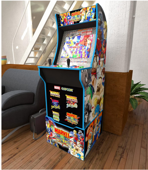
Image: The Arcade1Up Marvel vs Capcom machine integrated into a modern living room, demonstrating its aesthetic appeal as a home entertainment piece.