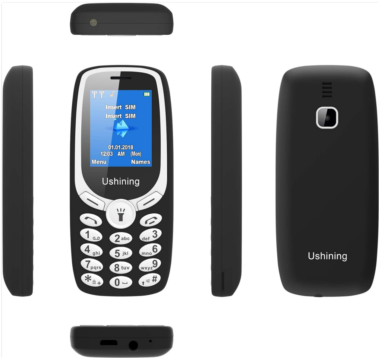
Image: Various angles of the USHINING U181 mobile phone, including front, back, and side profiles, highlighting its compact design.