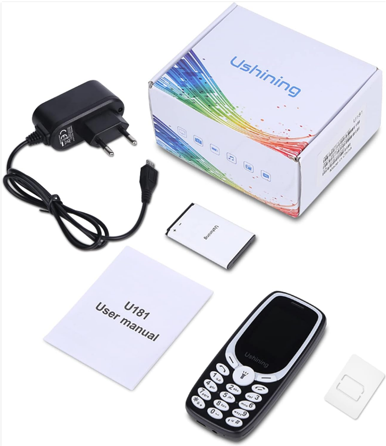
Image: The USHINING U181 mobile phone, charger, battery, SIM adapter, and user manual as included in the package.