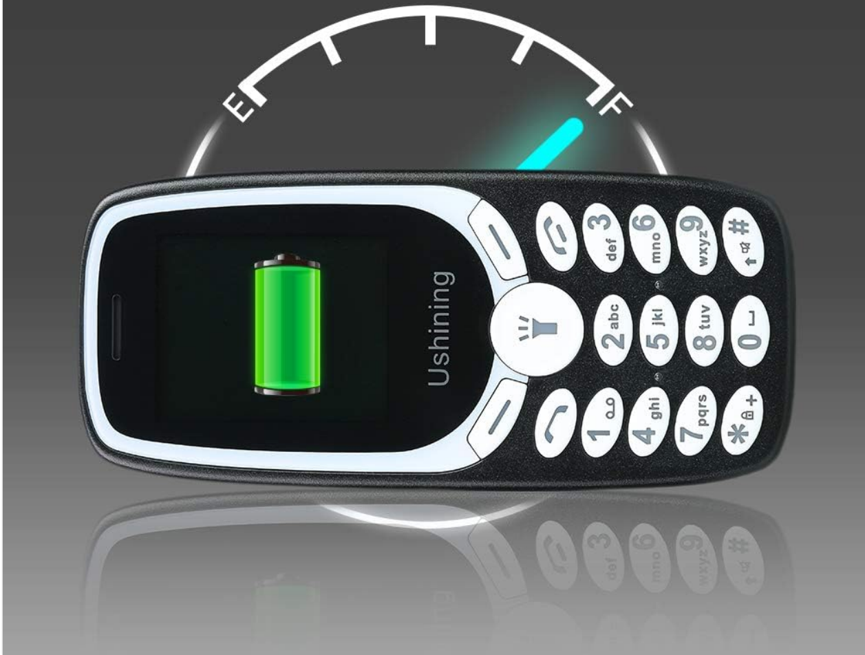
Image: The USHINING U181 mobile phone displaying a full battery icon, indicating long standby time.