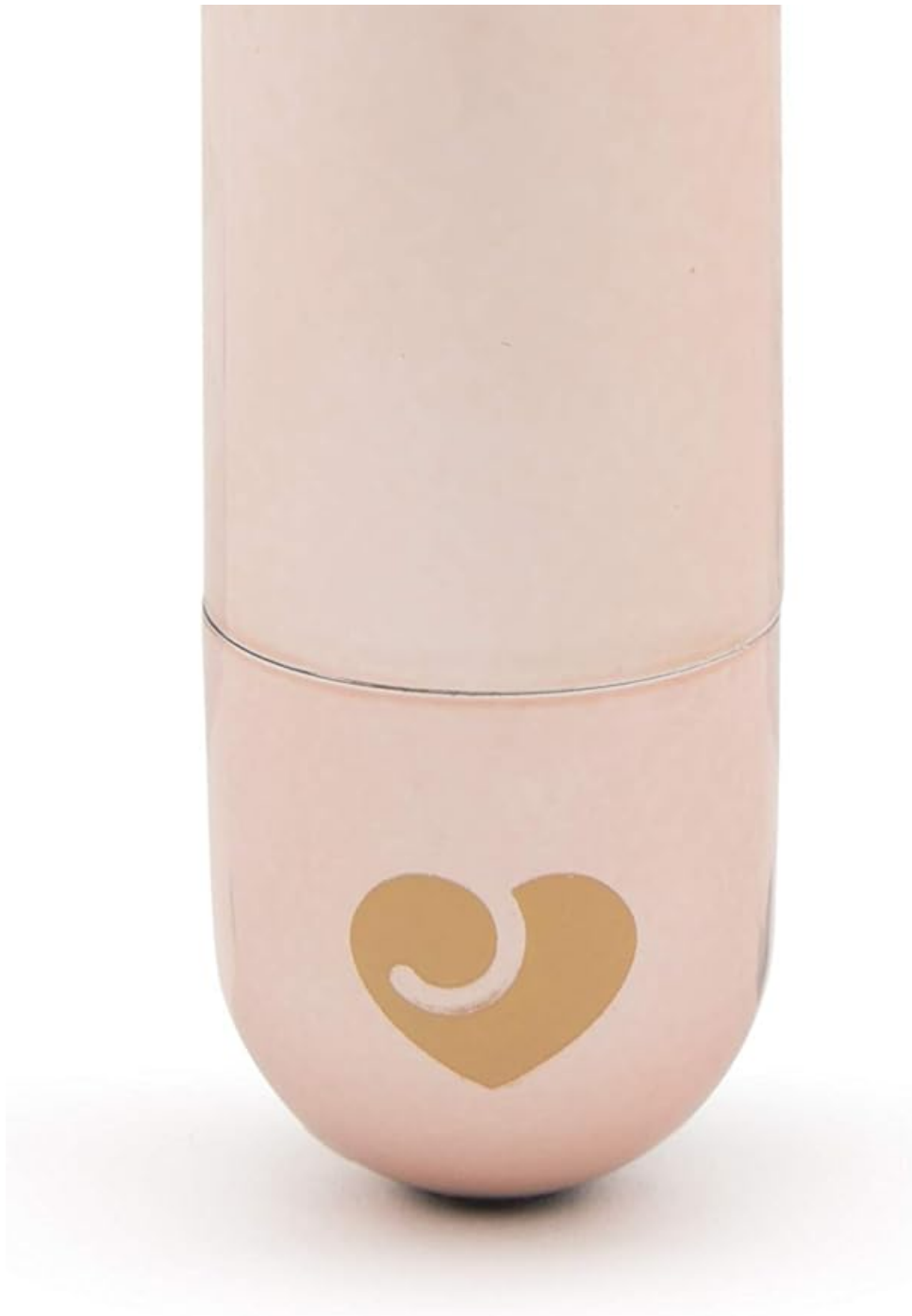
Image 1: The Lovehoney Glow Up Bullet Vibrator. This image displays the sleek, rose gold beige bullet vibrator, highlighting its compact and discreet design.