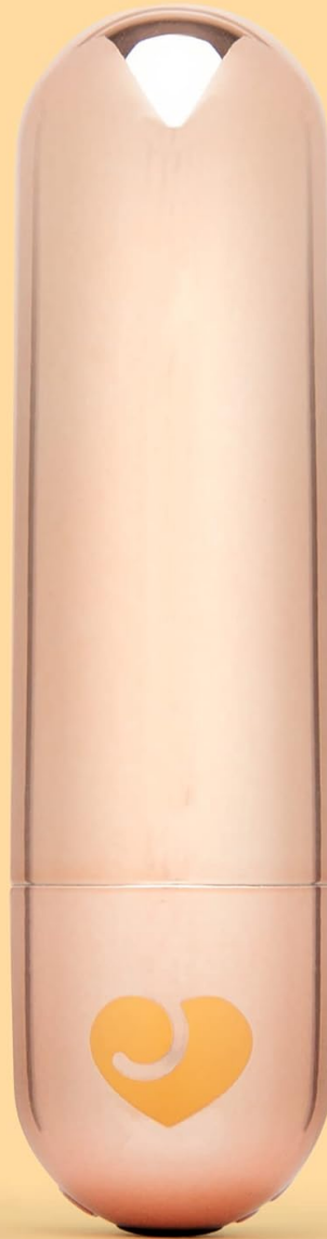
Image 5: The Lovehoney Glow Up Bullet Vibrator, highlighting its discreet, petite, and rechargeable features, ideal for clitoral stimulation.

Your browser does not support the video tag.