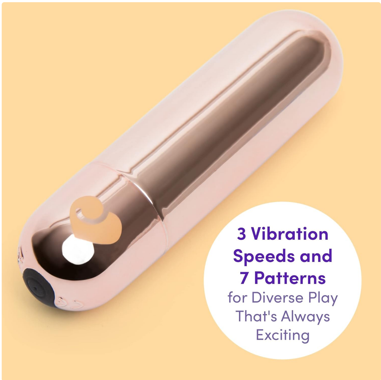
Image 4: The Lovehoney Glow Up Bullet Vibrator, emphasizing its 3 vibration speeds and 7 patterns for diverse use.