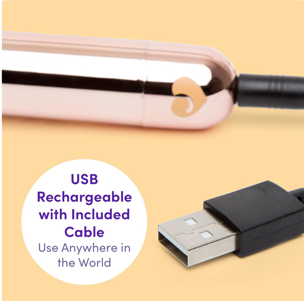
Image 2: The Lovehoney Glow Up Bullet Vibrator shown with its USB charging cable. This image illustrates how the device connects to the USB cable for recharging.