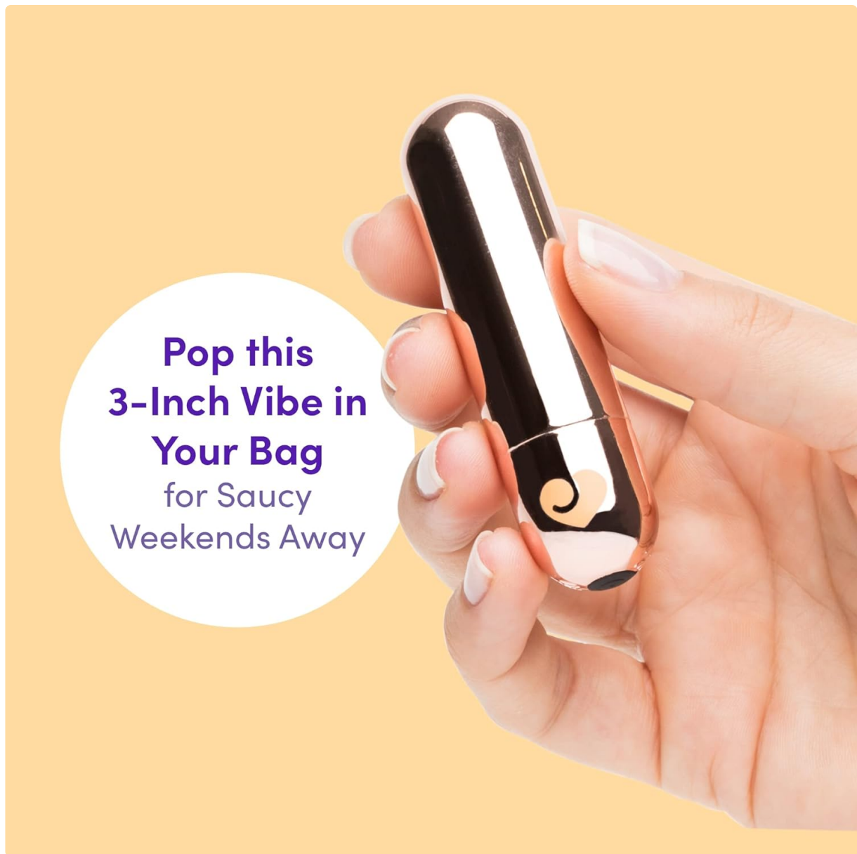
Image 6: A hand holding the Lovehoney Glow Up Bullet Vibrator, illustrating its compact 3-inch size, making it suitable for travel.