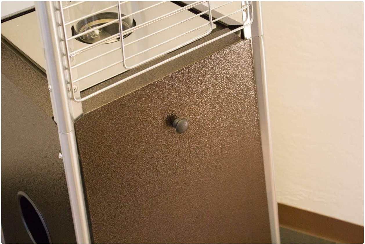
Figure 2.2: Close-up view of the control knob and access door for the propane tank.