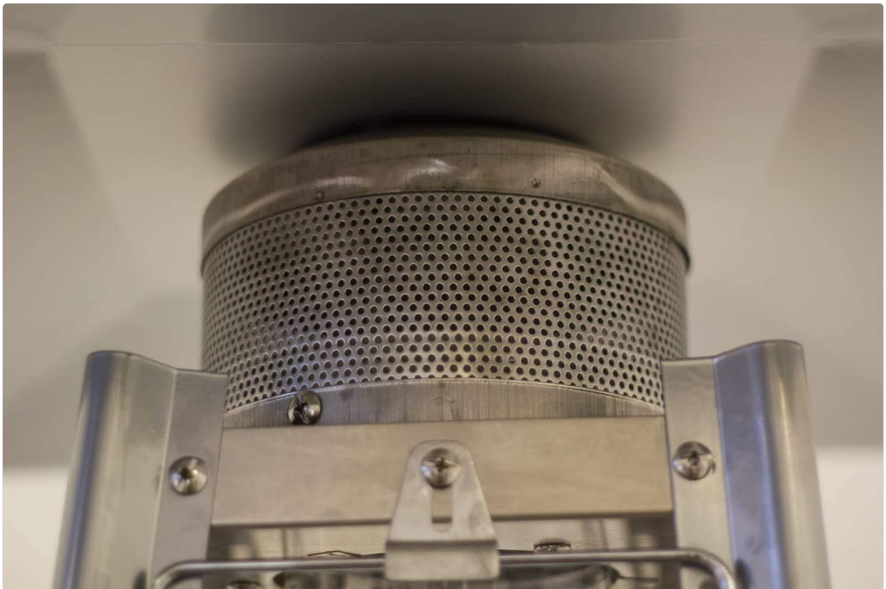
Figure 2.3: Detailed view of the burner assembly and protective screen.