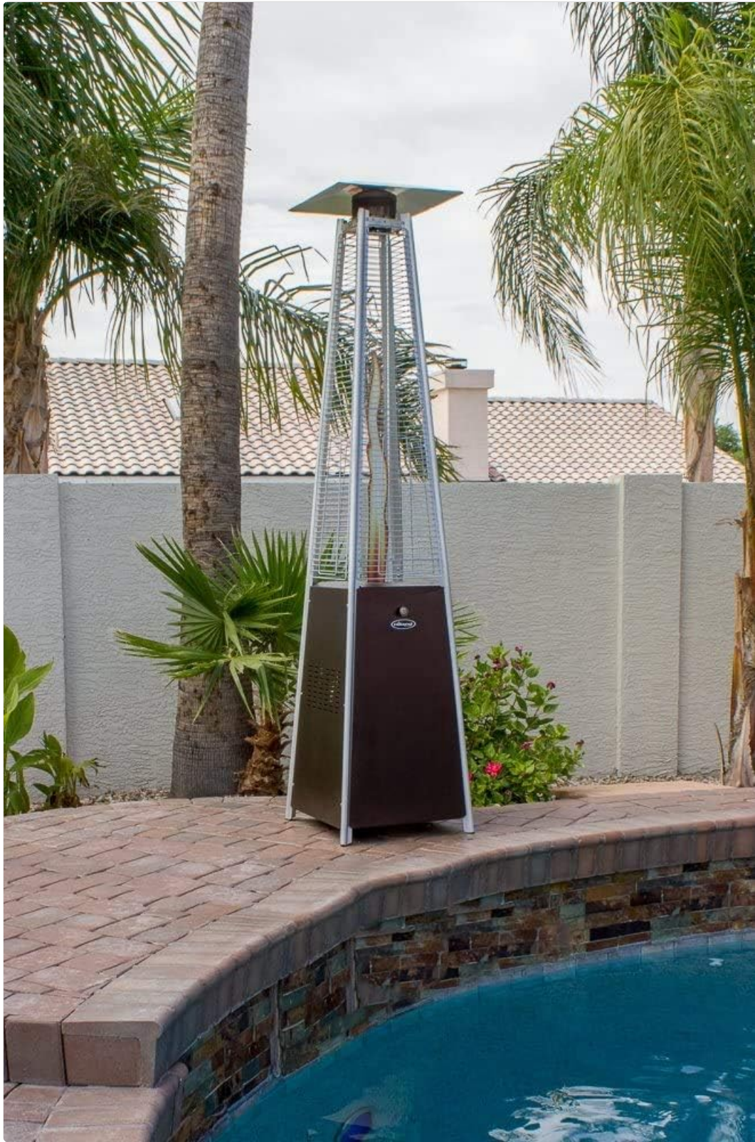
Figure 4.1: The patio heater in operation during daylight hours, providing warmth and ambiance.