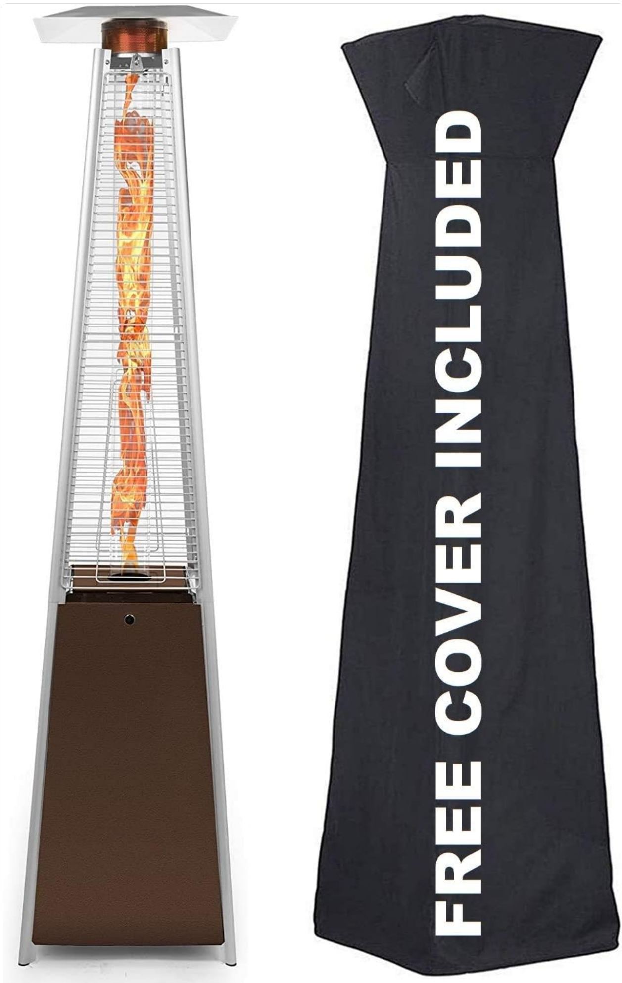
Figure 2.1: Avenlur Pyramid Patio Heater with its protective weatherproof cover.