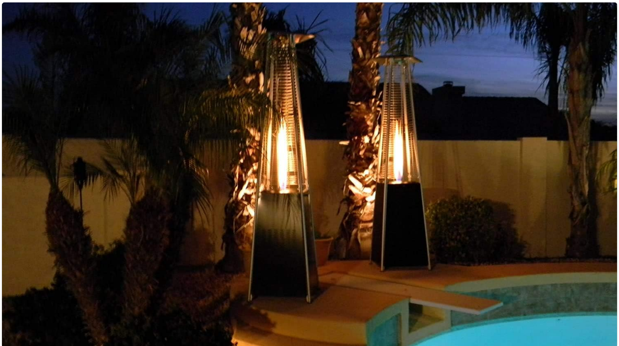
Figure 4.3: Multiple heaters creating a warm and inviting atmosphere for outdoor gatherings.