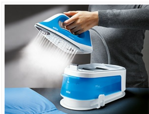
Figure 6: Vertical Steaming Function. This image illustrates the iron being used in a vertical position to steam hanging garments,