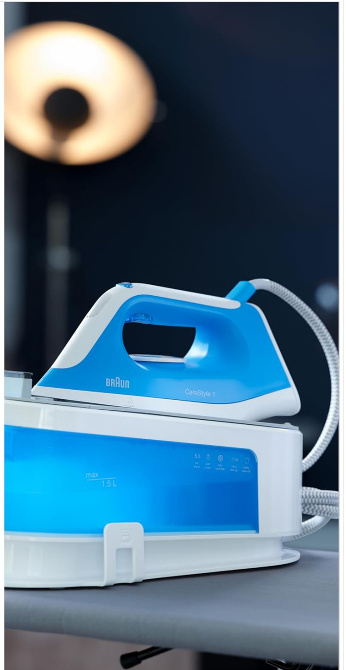
Figure 2: Key Features of the Braun CareStyle 1. This image highlights the appliance's specifications including 2200W power, 110 g/min continuous steam, 5.5 bar pressure, 340 g/min steam shot, and a 1.5m cord length.