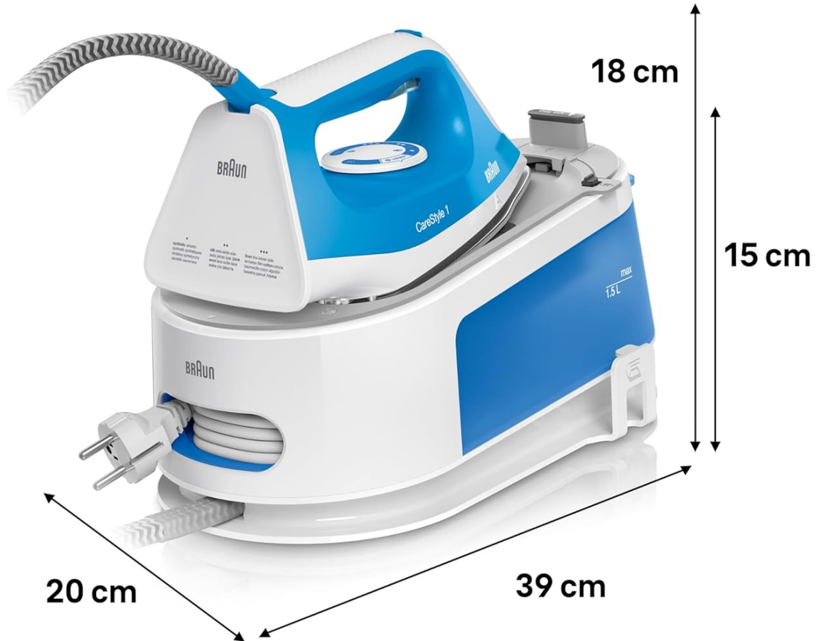
Figure 7: Product Dimensions. This image provides a visual representation of the steam generator iron's dimensions: approximately 39 cm in length, 20 cm in width, and 18 cm in height for the iron, with the base being 15 cm high.