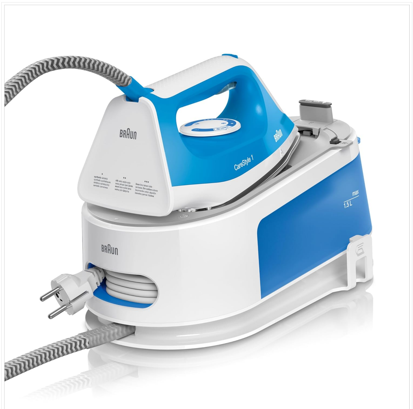
Figure 1: Braun CareStyle 1 IS1012BL Steam Generator Iron. This image shows the complete steam generator iron unit, with the iron resting securely on its base, and the power cord neatly wrapped around the base.