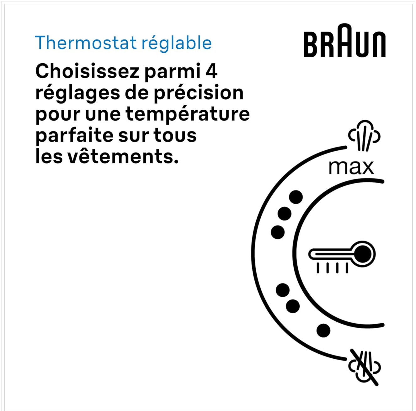
Figure 4: Adjustable Thermostat. This image displays the temperature control dial on the iron, illustrating the four precision settings available for different fabric types to ensure optimal ironing results.