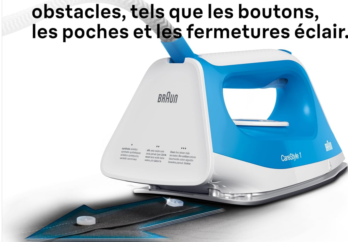
Figure 5: FreeGlide 3D Soleplate. This image shows the unique rounded soleplate design gliding effortlessly over fabric, demonstrating its ability to navigate around obstacles like buttons without snagging.

Ne laissez rien vous ralentir. Glissez en arrière sur tous les obstacles, tels que les boutons, les poches et les fermetures éclair.