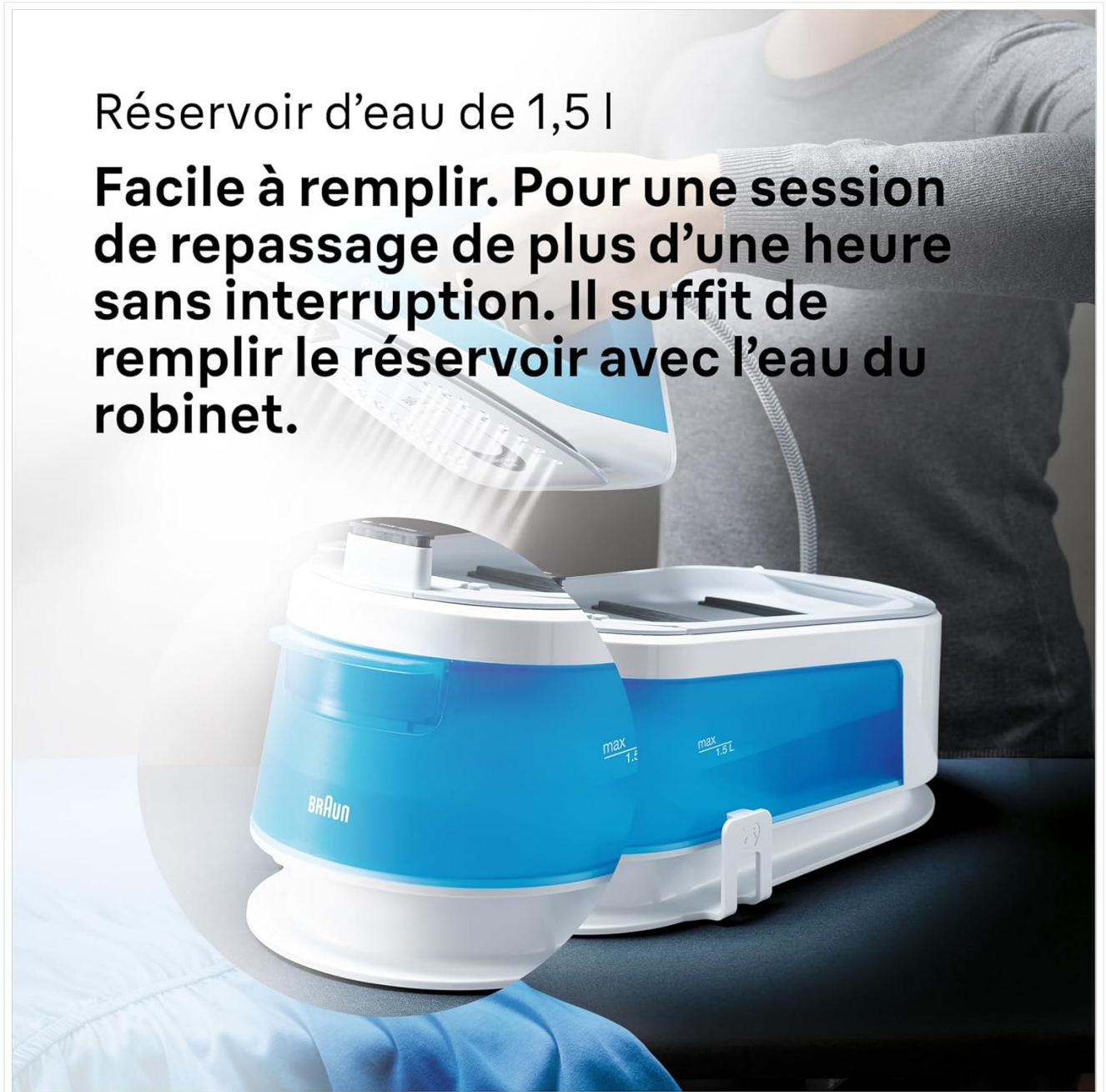
Figure 3: Filling the 1.5 Liter Water Tank. This image demonstrates the process of refilling the non-removable 1.5-liter water tank with tap water, allowing for extended ironing sessions.

4. Connecting to Power: Plug the power cord into a suitable grounded electrical outlet (240V).