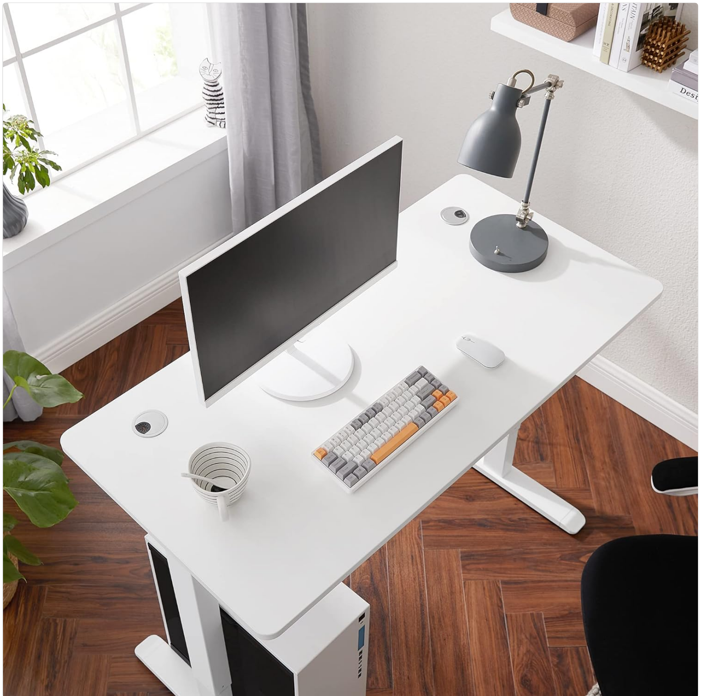
Image: The SONGMICS electric desk tabletop integrated into a modern office environment, showcasing its clean white surface, cable management grommets, and ample space for a monitor, keyboard, and other accessories.