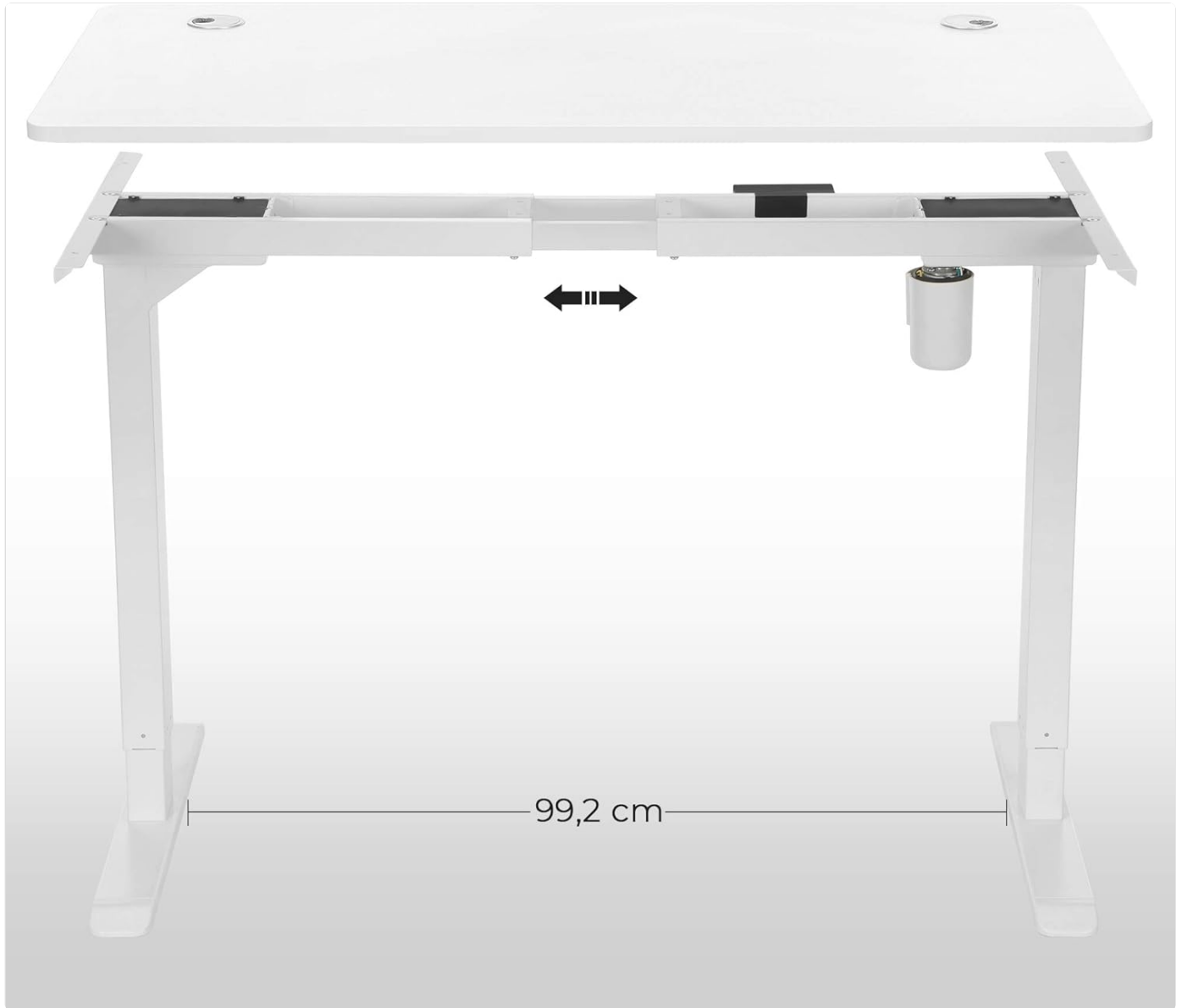
Image: An electric desk frame with its tabletop detached, highlighting the adjustable width mechanism (indicated by arrows) that allows it to fit various tabletop sizes, including the SONGMICS LDB001W01.