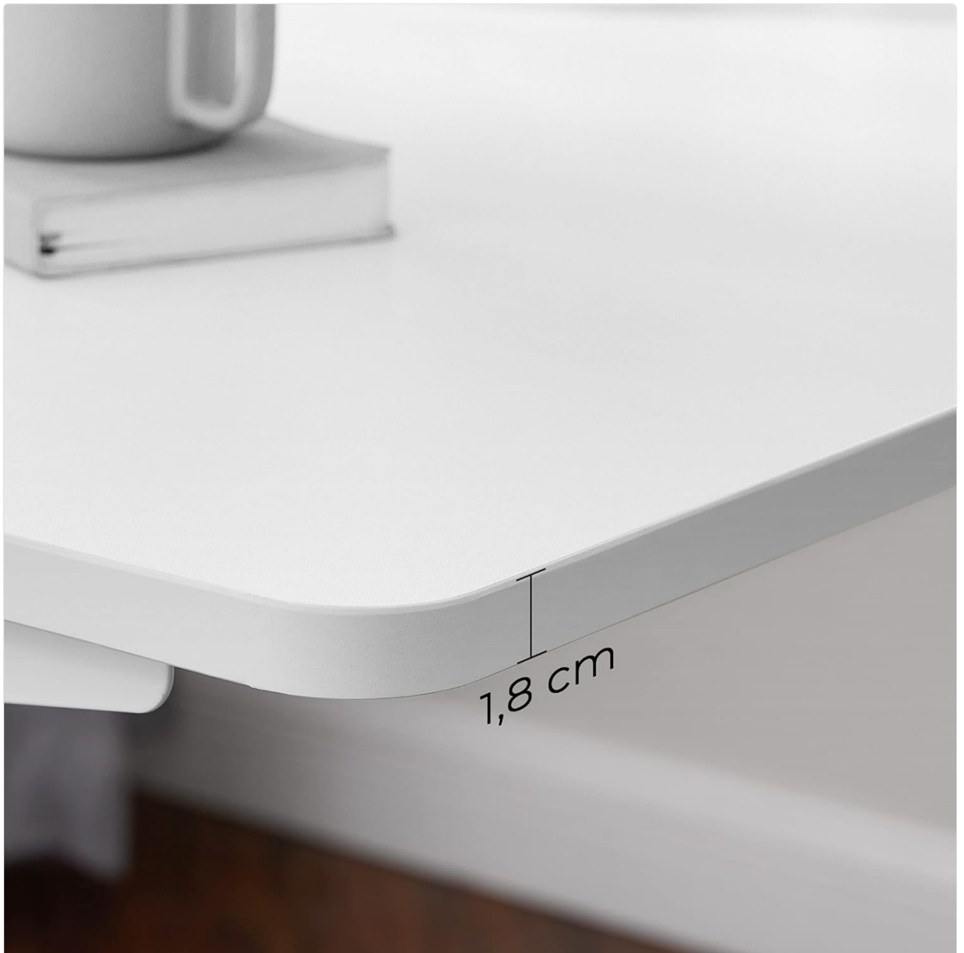
Image: A detailed view of the tabletop's rounded edge, clearly showing its thickness of 1.8 cm, which contributes to both aesthetics and user safety.