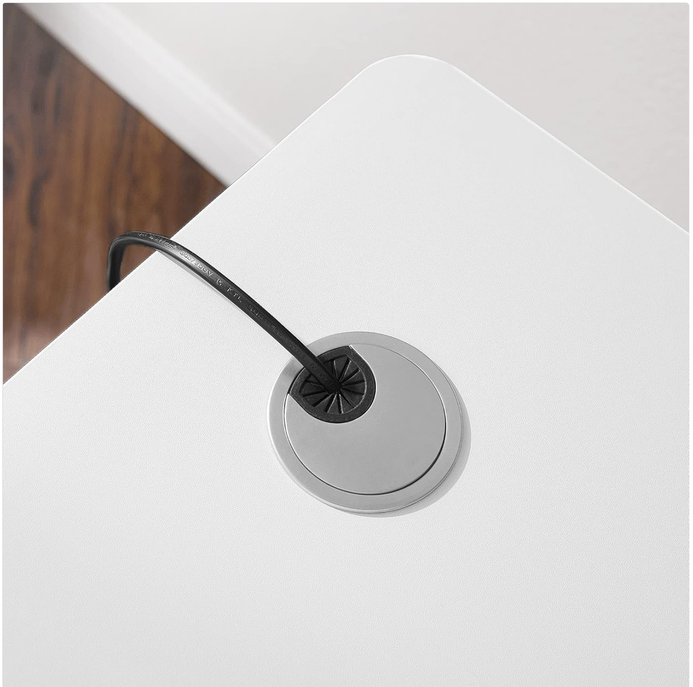
Image: A close-up view of one of the tabletop's integrated cable grommets, showing a power cable neatly routed through its opening, designed to keep desk cables organized and out of sight.