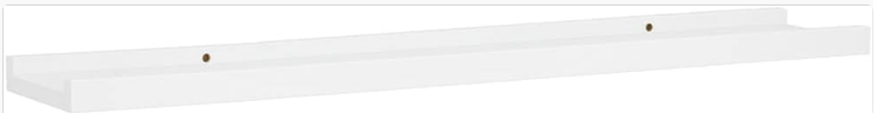
Image 4.1: Top view of a single shelf, highlighting the keyhole mounting slots.