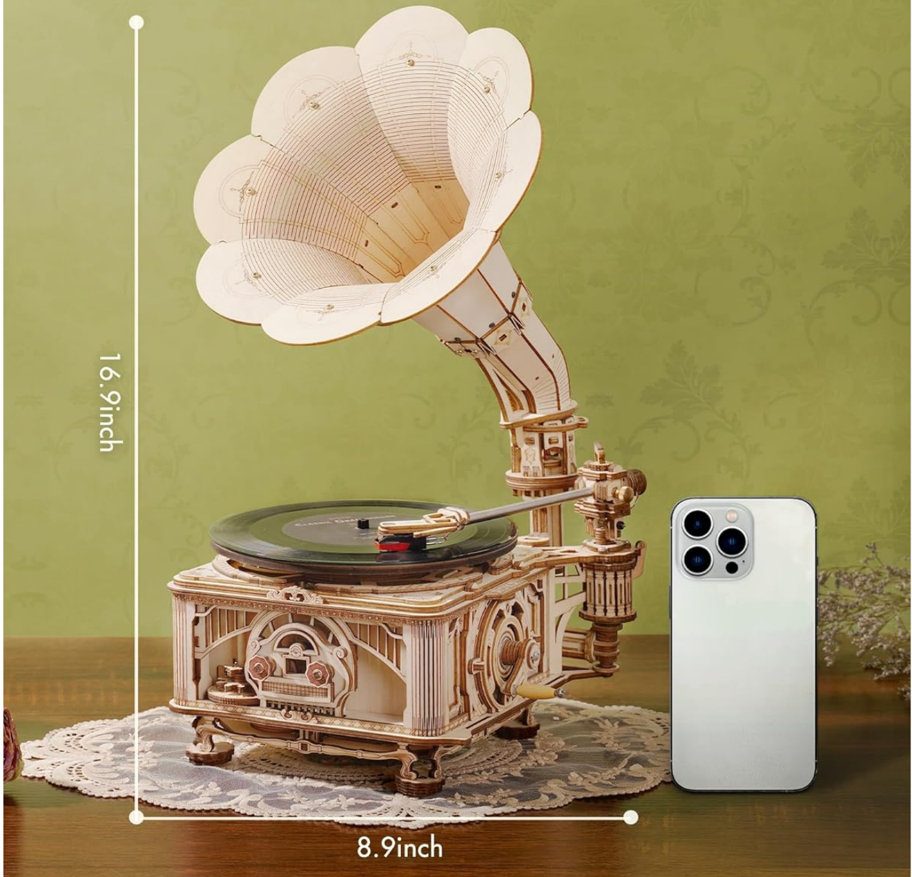
Figure 7: Visual representation of the assembled gramophone's dimensions.