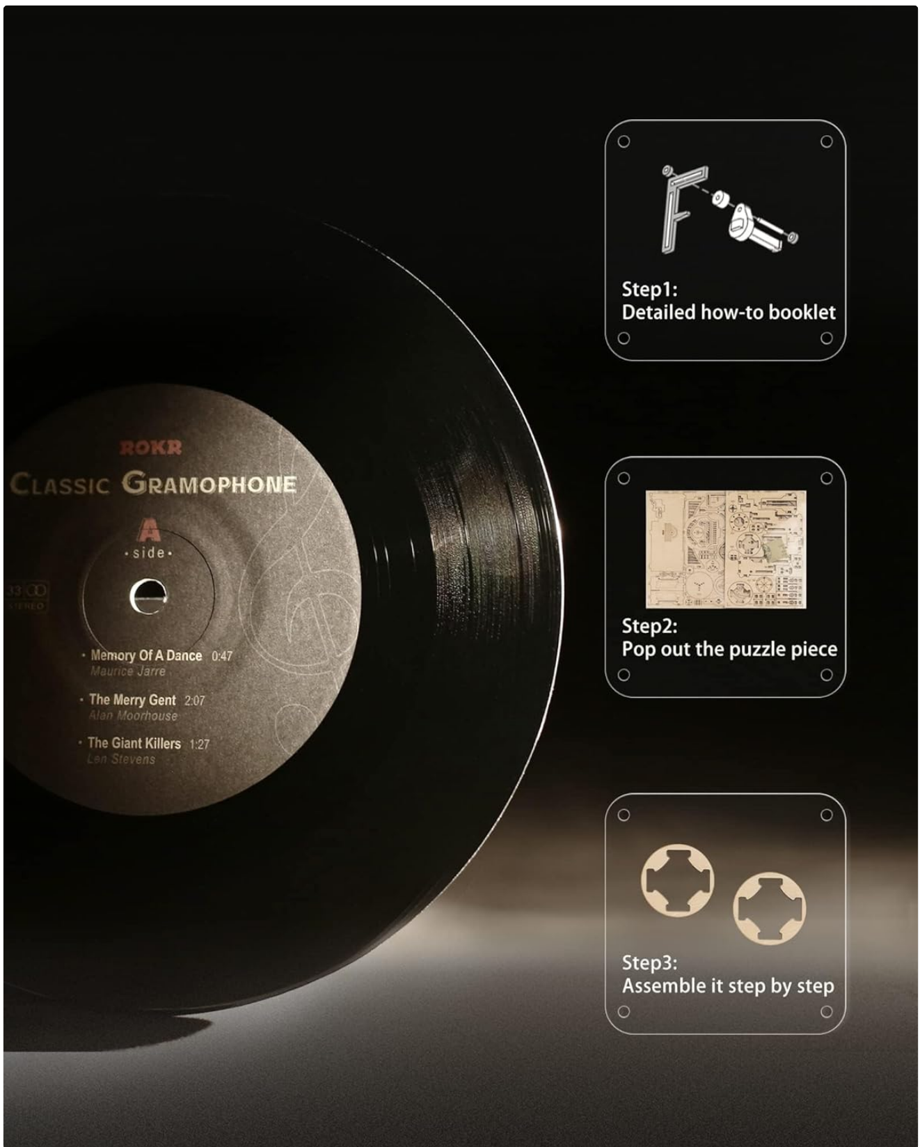
Figure 3: Illustrated assembly process, emphasizing the use of the detailed booklet, careful removal of pieces, and step-by-step construction.