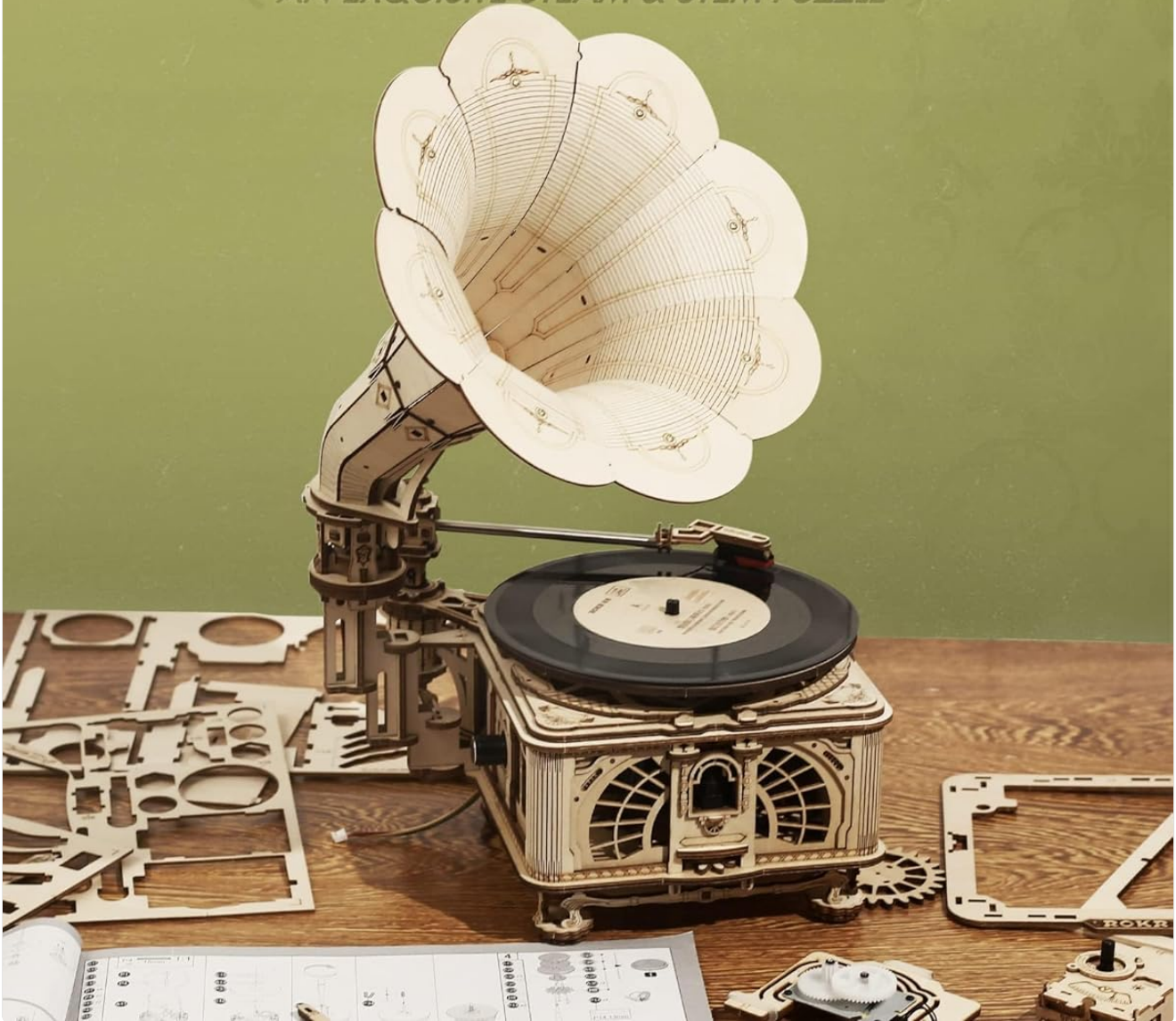
Figure 4: The gramophone model during assembly, showing the various wooden components and the instruction manual.

INCREASE PERCEPTUAL SENSITIVITY IMPROVE HAND-EYE COORDINATION AN EXQUISITE STEAM & STEM PUZZLE