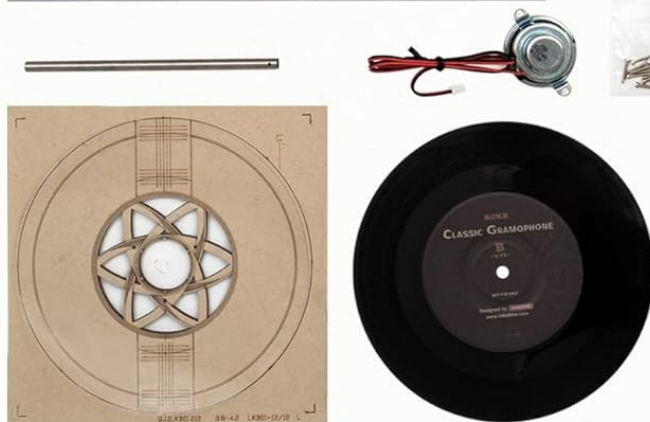
Figure 2: Contents of the ROKR Classical Gramophone (LKB01) package, including wooden sheets, instruction manual, vinyl record, and various small parts.