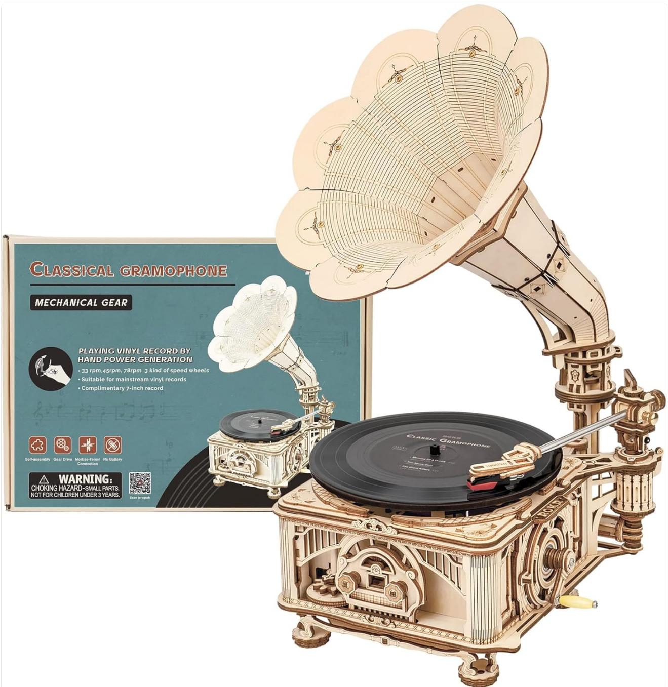
Figure 1: The ROKR Classical Gramophone (LK601) 3D Wooden Puzzle kit, including the assembled model and its packaging.

The ROKR Classical Gramophone (LK601) is a 424-piece DIY wooden puzzle that, once assembled, functions as a hand-cranked gramophone. It features a manual volume knob and a large rotatable horn, capable of playing 7-inch vinyl records at 33 1/3 and 45 RPM.