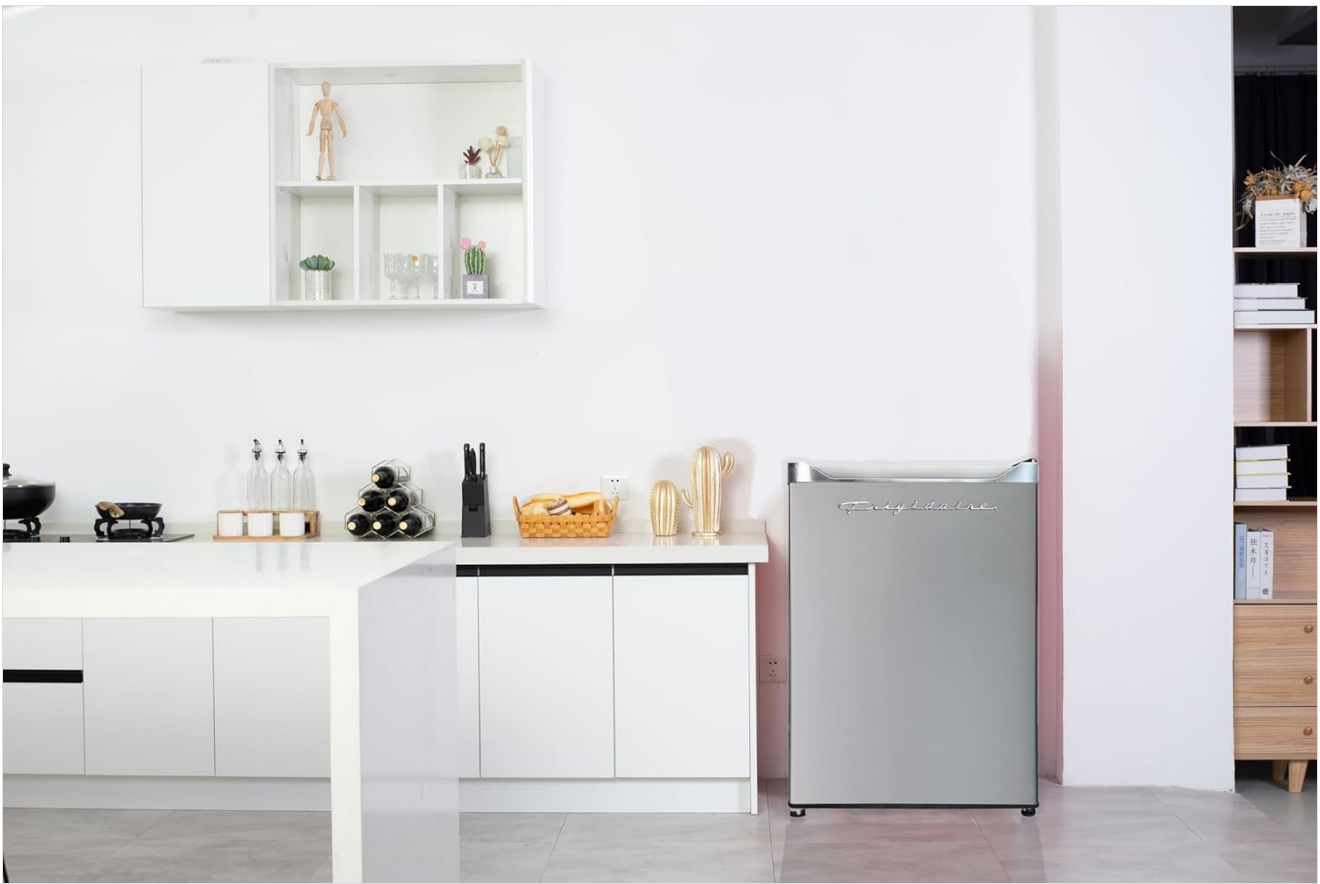
Image: The Frigidaire EFRF314-AMZ Upright Freezer positioned neatly in a modern kitchen, demonstrating its suitability for integration into home environments.