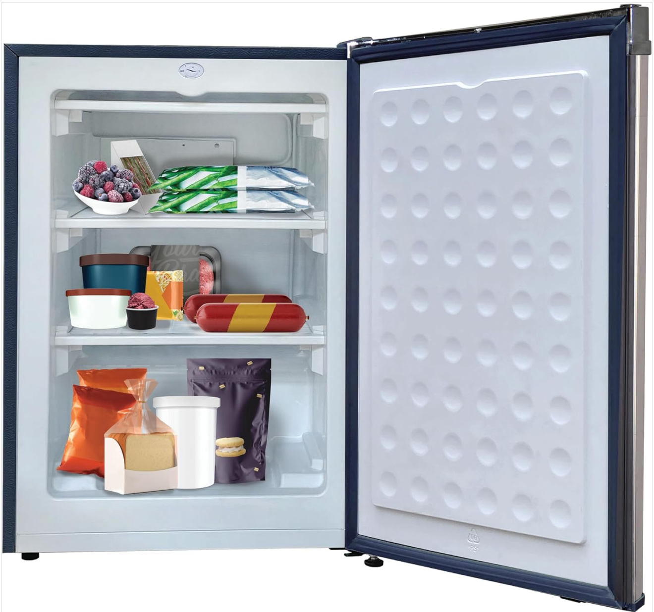
Image: An open view of the freezer's interior, showcasing its multiple wire shelves and the capacity to store various frozen food items, including packaged meats and vegetables.