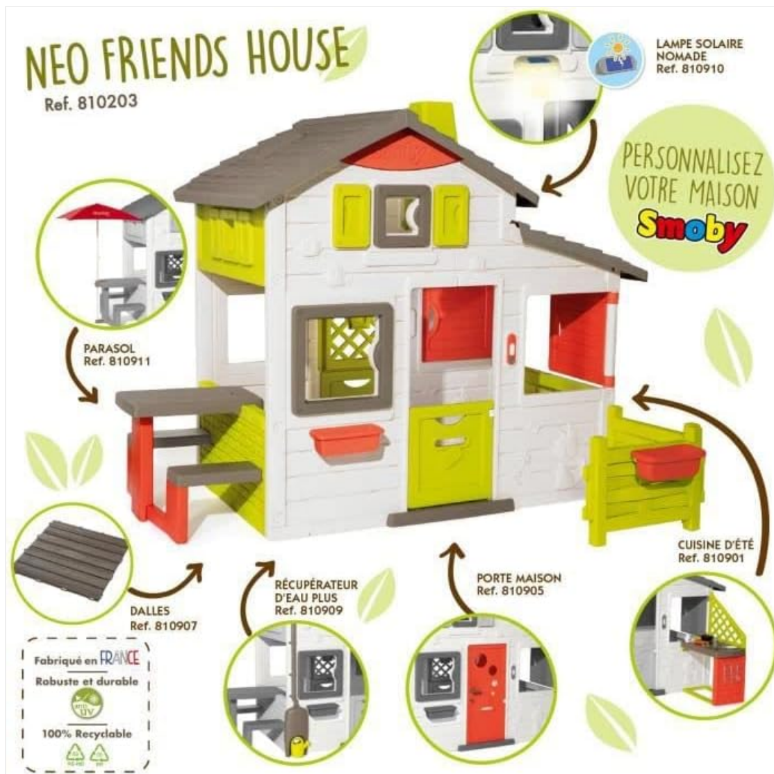
Image: Overview of optional accessories for the Neo Friends House, demonstrating customization possibilities.