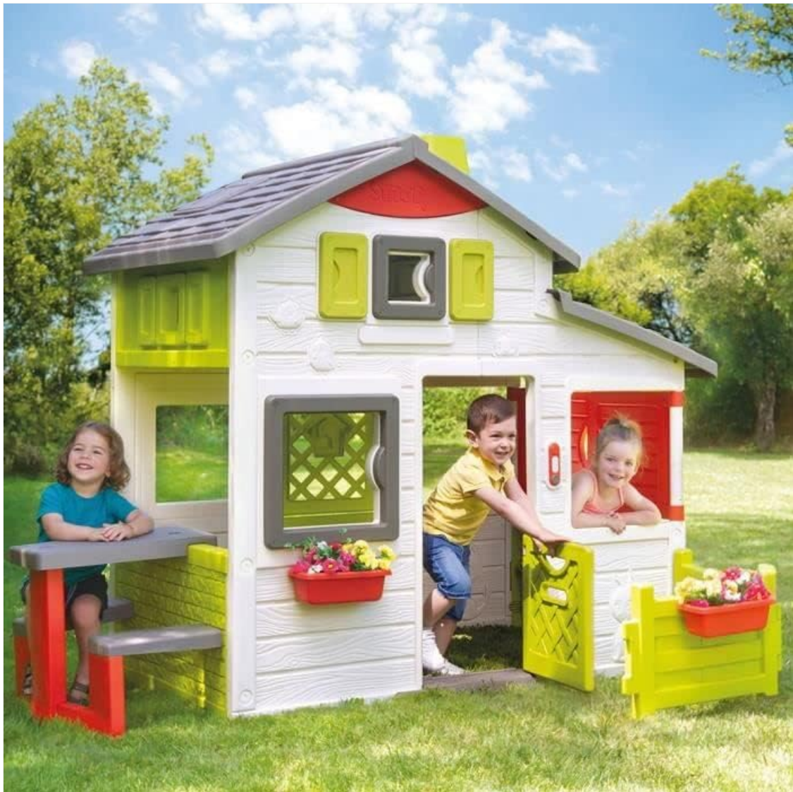
Image: The Smoby Neo Friends House fully assembled, demonstrating its spacious design and features.