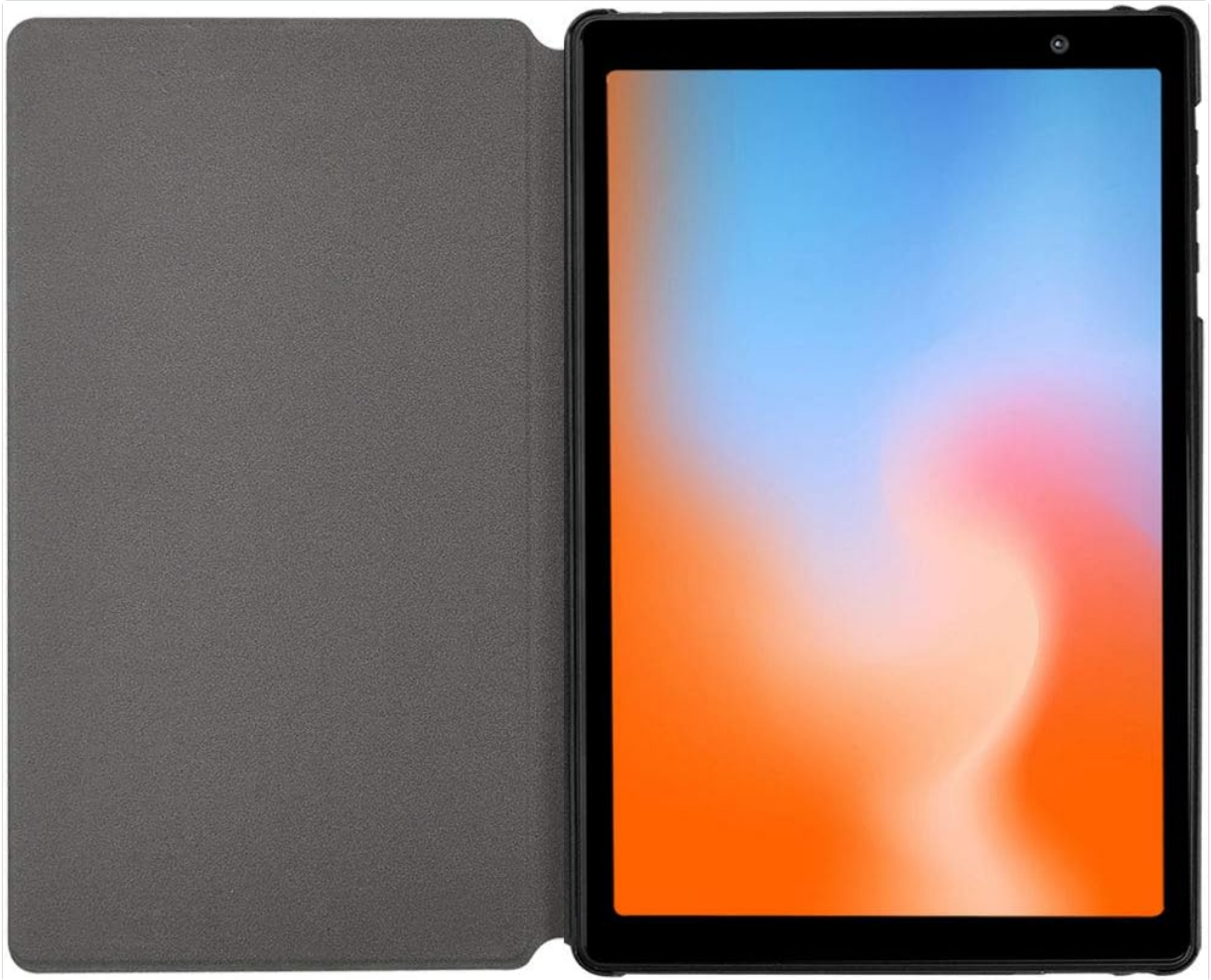
Image: Tablet securely fitted into the open LNMBBS P40-EEA case, showing the screen and accessible controls.