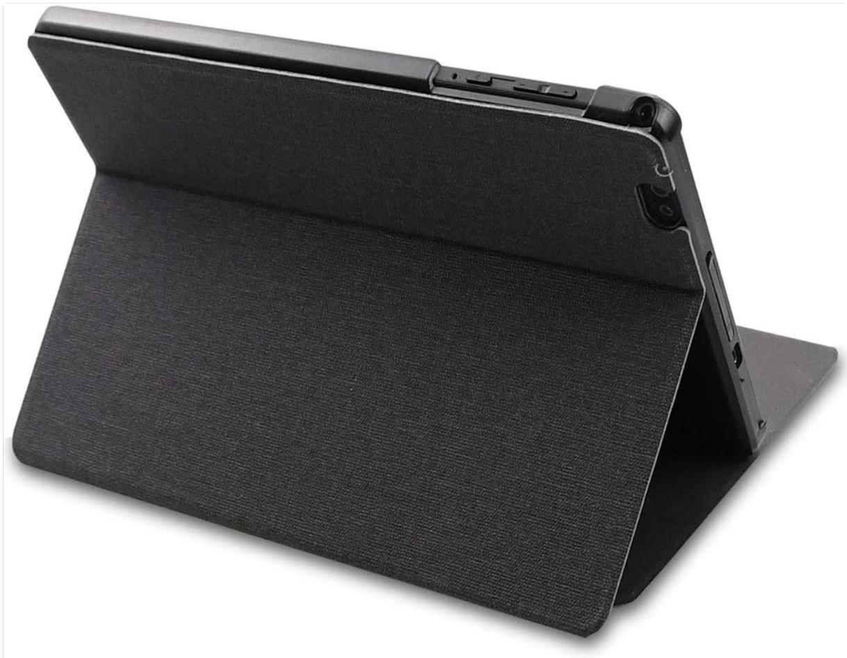
Image: The LNMBBS P40-EEA tablet case folded into a stand position, holding the tablet at an angle for viewing.

To achieve stability, ensure the folds are firm and the tablet rests securely in the grooves or against the folded cover.