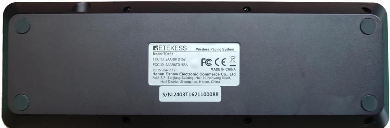
Illustration of the items included in the Reteless TD162 package.