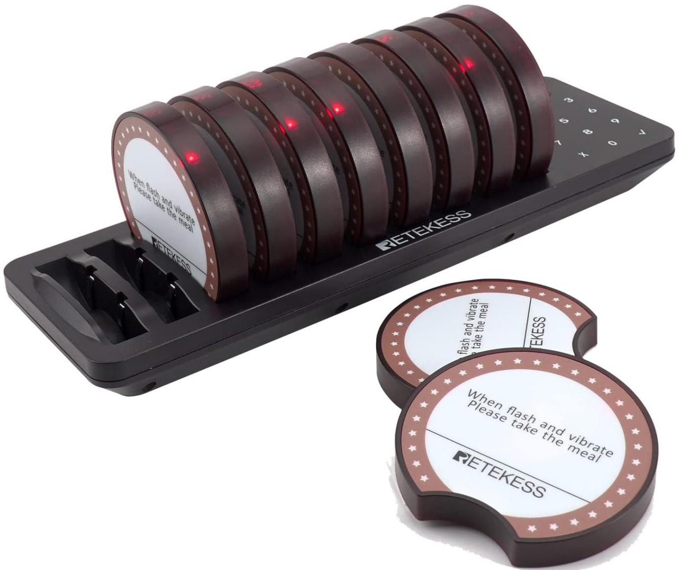
The Reteless TD162 Restaurant Pager System, showing the transmitter keypad and multiple coaster pagers.

Key features include a wide signal range, multiple customizable prompt modes (vibration, buzzer, flash), a low battery reminder, and a durable design. It is suitable for use in restaurants, cafes, food trucks, hospitals, clinics, and other service-oriented environments.