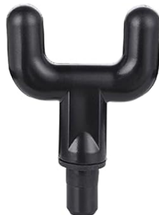
Image: The four distinct attachment heads are displayed, indicating their names and general purpose.