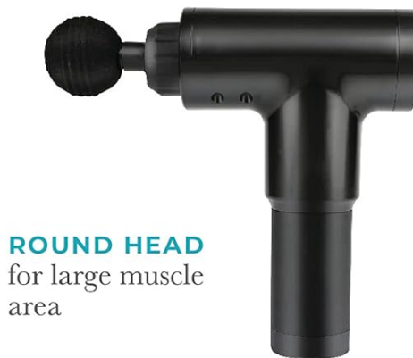
ROUND HEAD for large muscle area