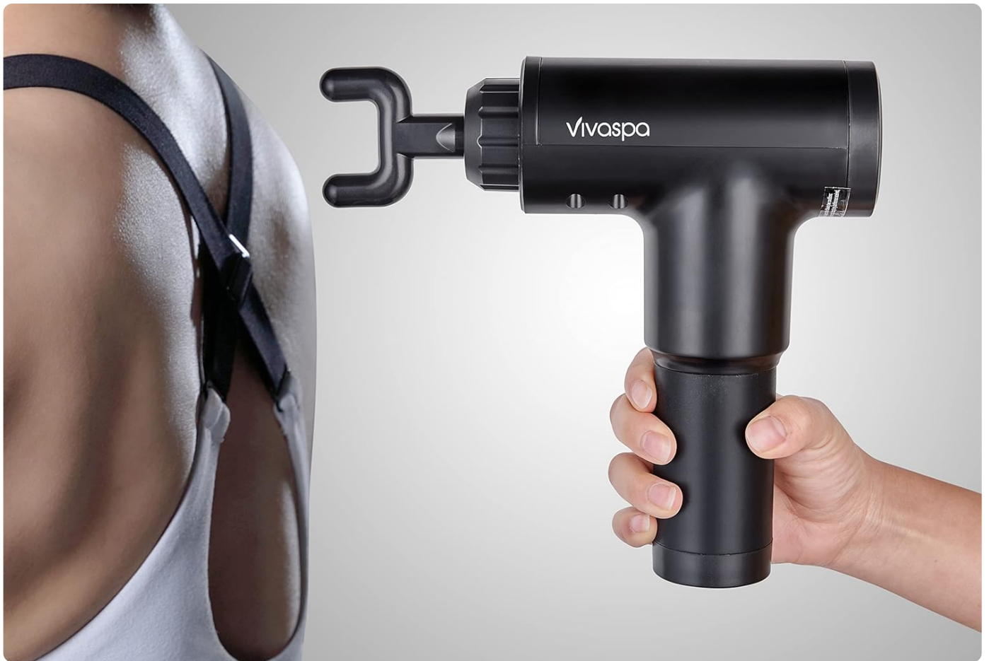
Image: A user demonstrates holding the massage gun, illustrating its comfortable grip and how it can be applied to the back.