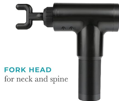
FORK HEAD for neck and spine

Image: A visual guide illustrating each massage head and its specific application area.