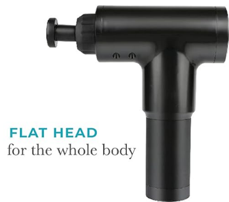
FLAT HEAD for the whole body