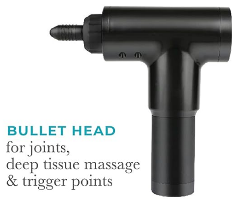
BULLET HEAD for joints, deep tissue massage & trigger points