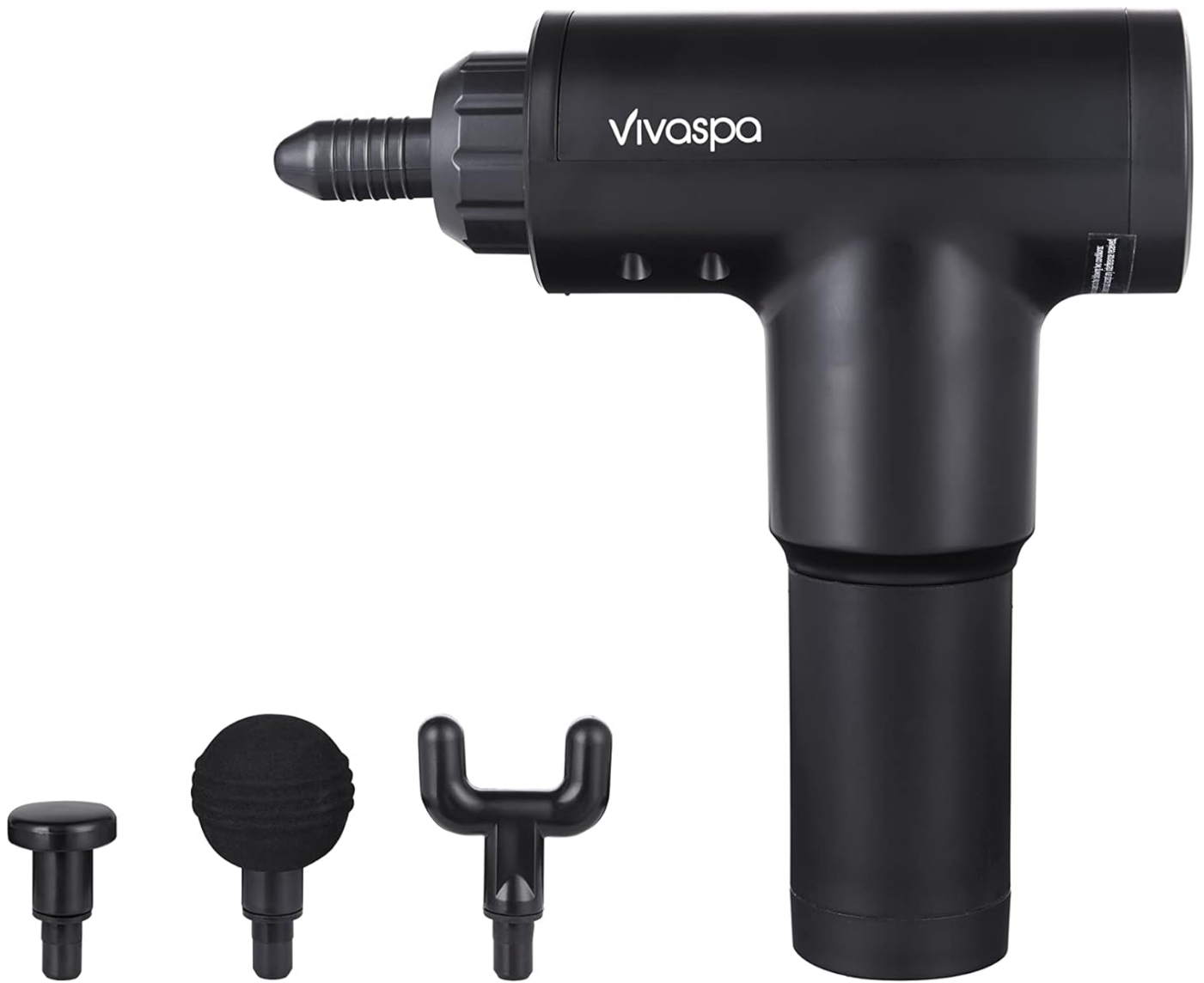
Image: The Vivitar Vivaspa massage gun shown with its four distinct interchangeable massage heads: flat, round, fork, and bullet.