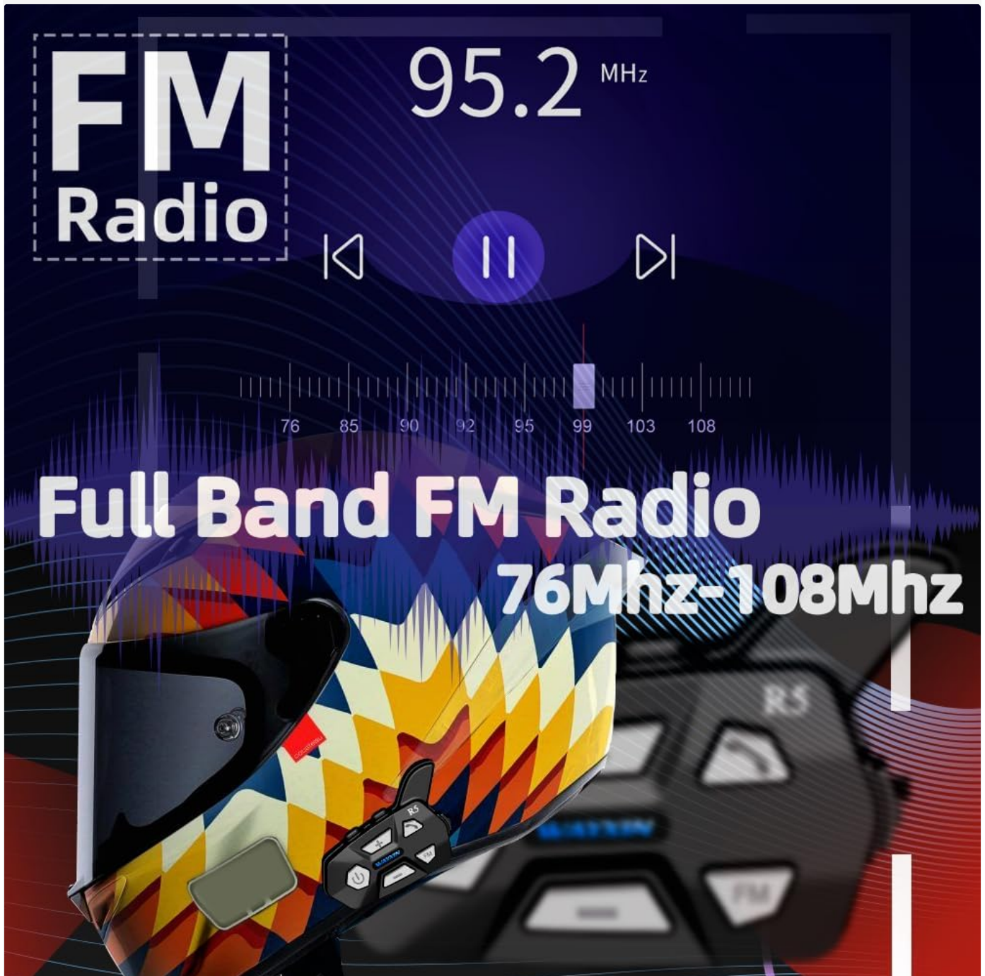
Image: The integrated FM radio feature, showing a helmet with the R5 unit and a visual representation of the radio interface, indicating a frequency range of 76MHz-108MHz.