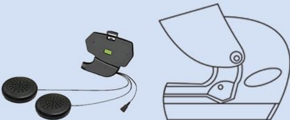
Modular Helmet (Full Helmet)