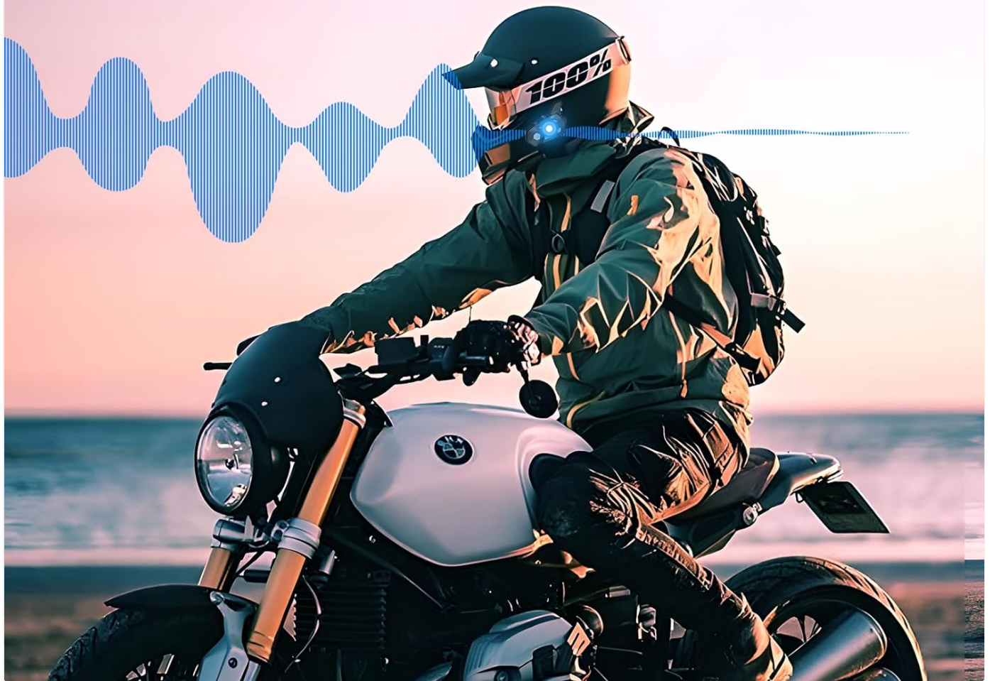
Image: Illustration of the DSP & CVC noise reduction technology, showing how wind noise and other disturbances are reduced for clearer audio.

Reduzieren Sie Windgerausche und andere storende Geräusche