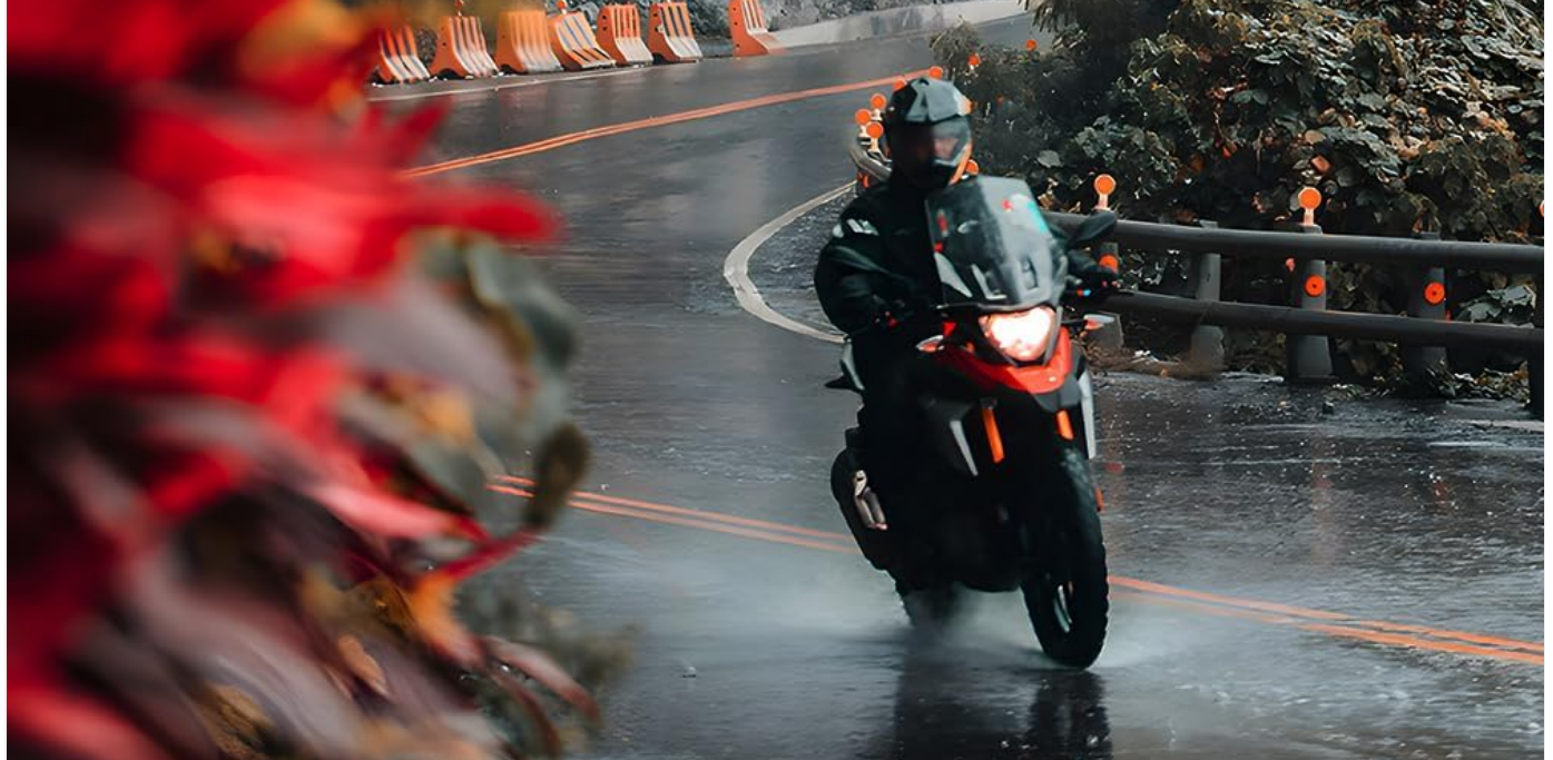
Image: The IP67 waterproof feature of the WAYXIN R5, demonstrating its ability to withstand rain and dust, ensuring functionality in various weather conditions.