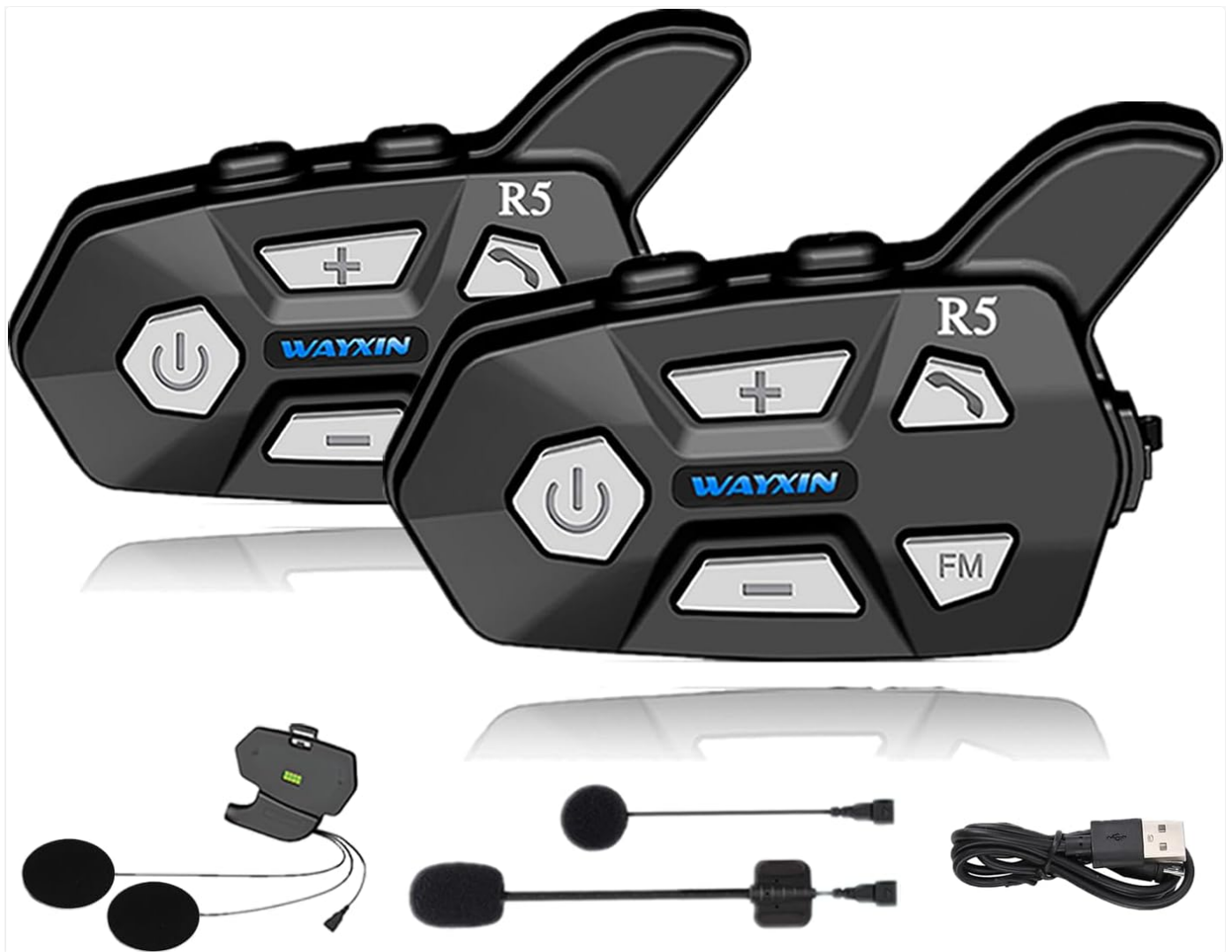
Image: Two WAYXIN R5 intercom units, along with their accompanying headsets, microphones, mounting bracket, and charging cable.