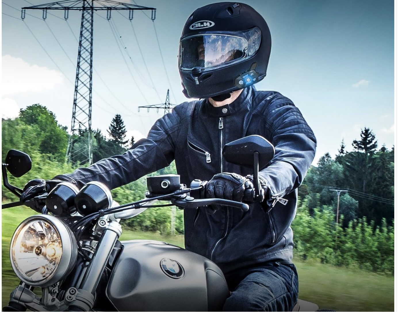
Image: WAYXIN R9 with FM radio capability.