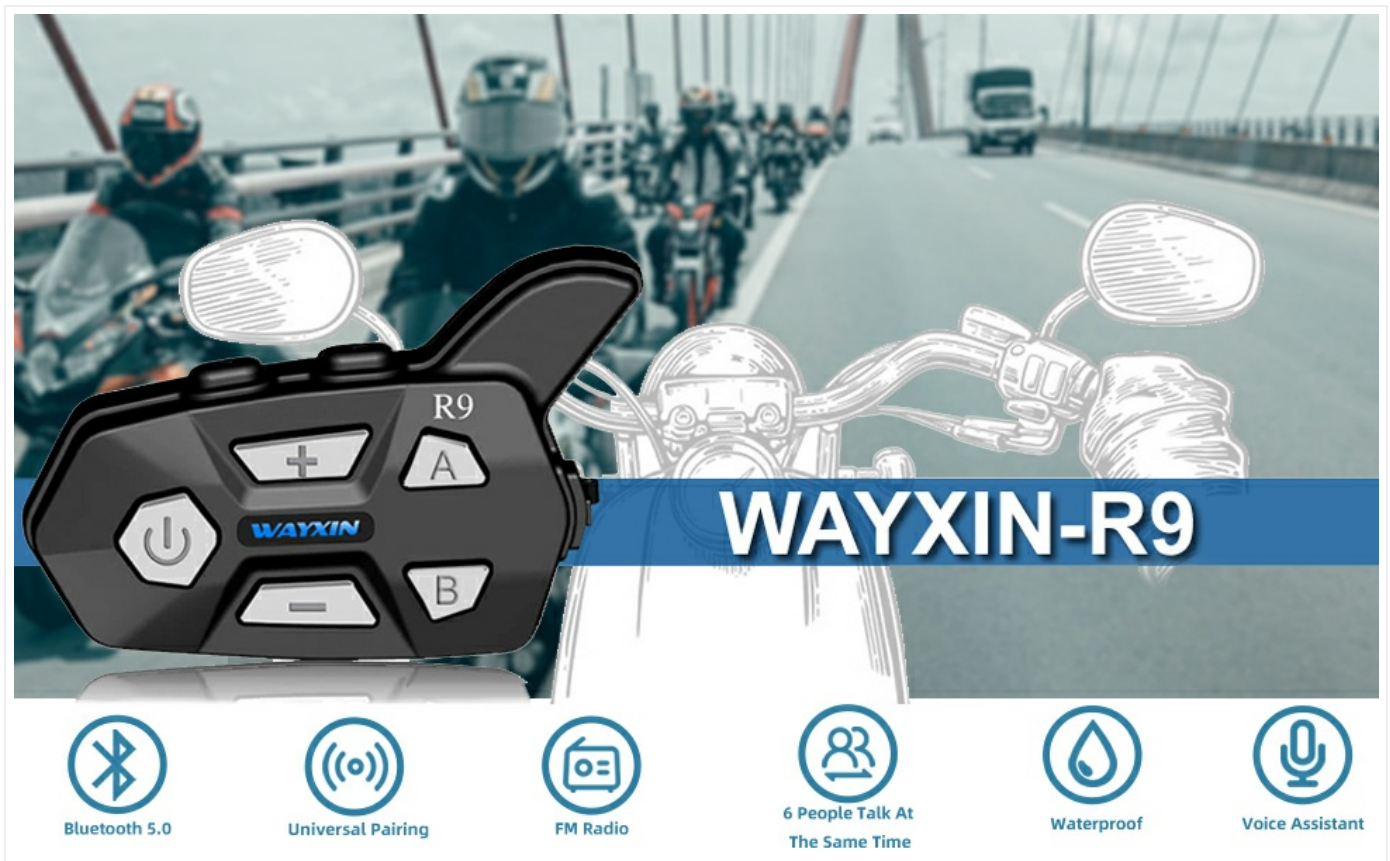
Image: Key features of the WAYXIN R9 intercom system.