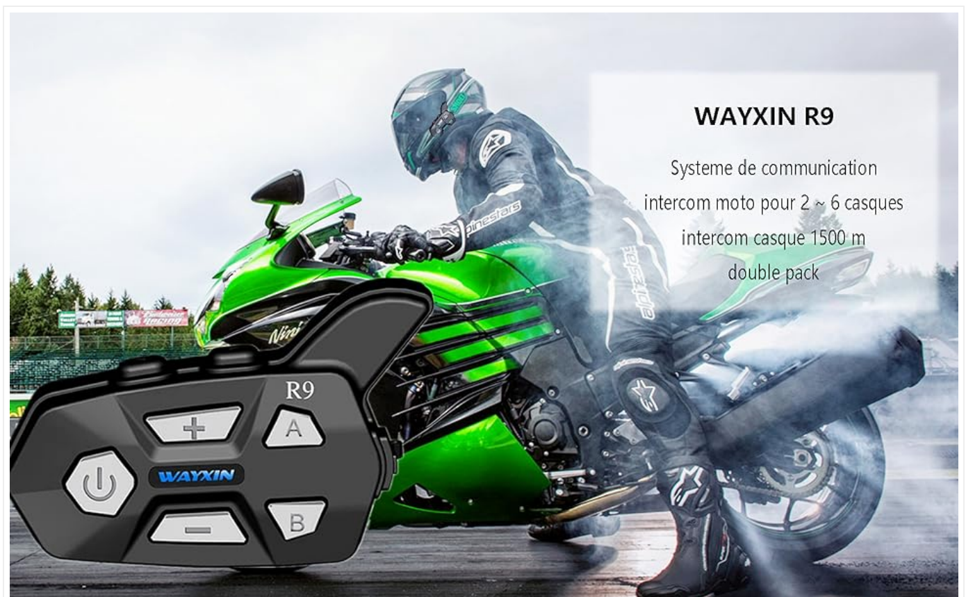
Image: WAYXIN R9 intercom in use on a motorcycle helmet.