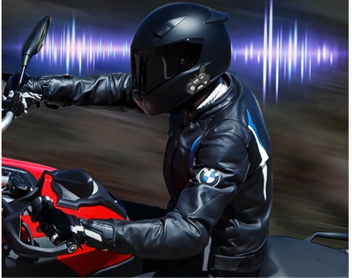
Image: DSP & CVC noise reduction technology for clear audio.

Reduzieren Sie Windgeräusche und andere störende Geräusche