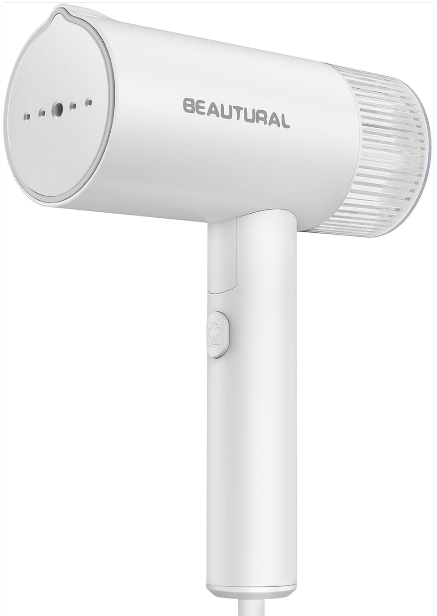
Figure 1: Front view of the BEAUTURAL Portable Garment Steamer, showcasing its sleek white design and steam nozzle.