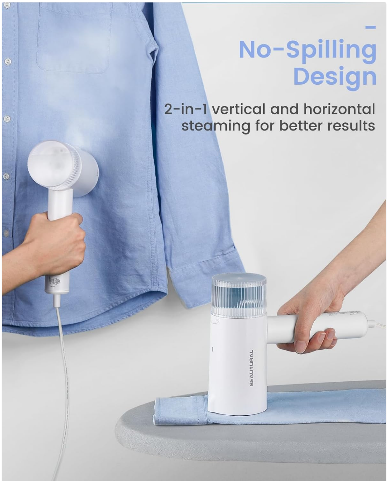
Figure 4: Demonstrates the steamer's versatile 2-in-1 vertical and horizontal steaming capability.