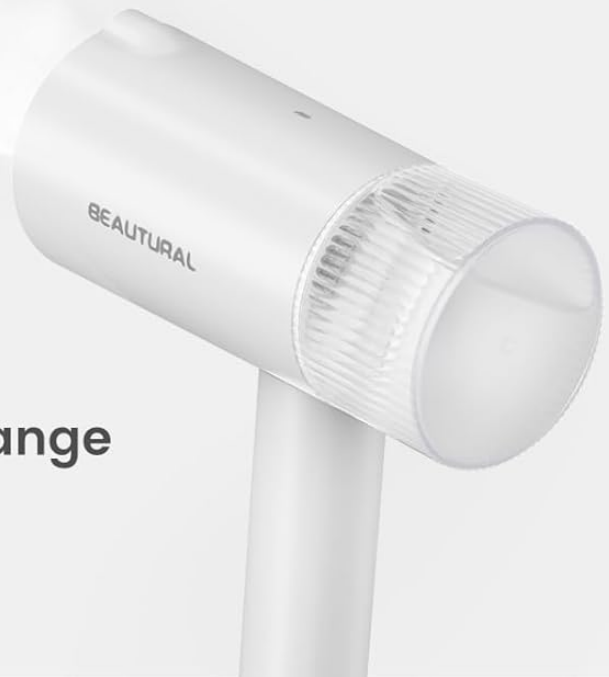
Figure 6: The steamer is suitable for a wide range of fabrics, as shown with examples.