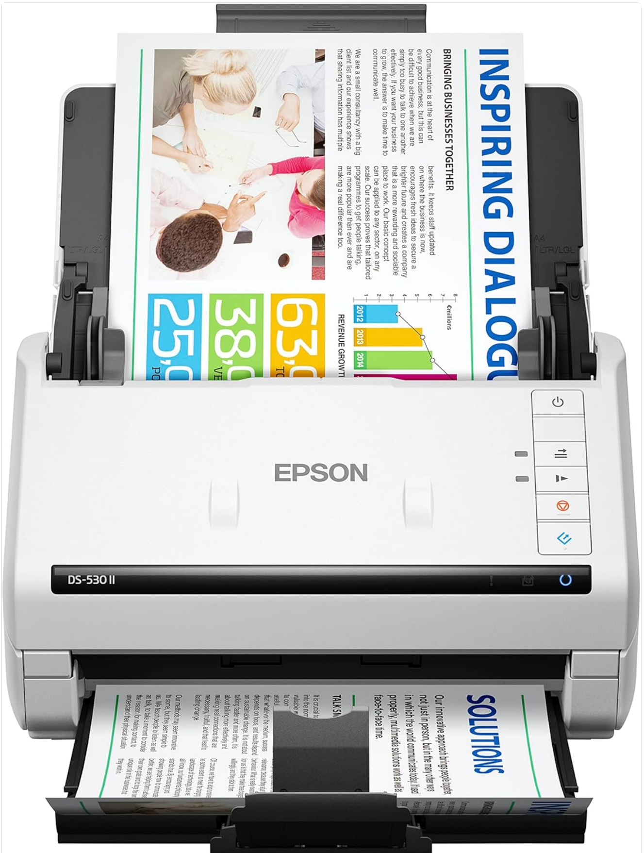
Figure 1: Epson DS-530 II Document Scanner in operation.