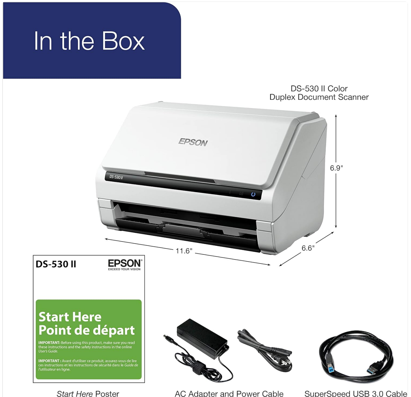
Figure 3: What's included in the box.

Carefully remove all components from the packaging. Ensure all protective materials are removed from the scanner. Place the scanner on a stable, flat surface with adequate space for document feeding and output.