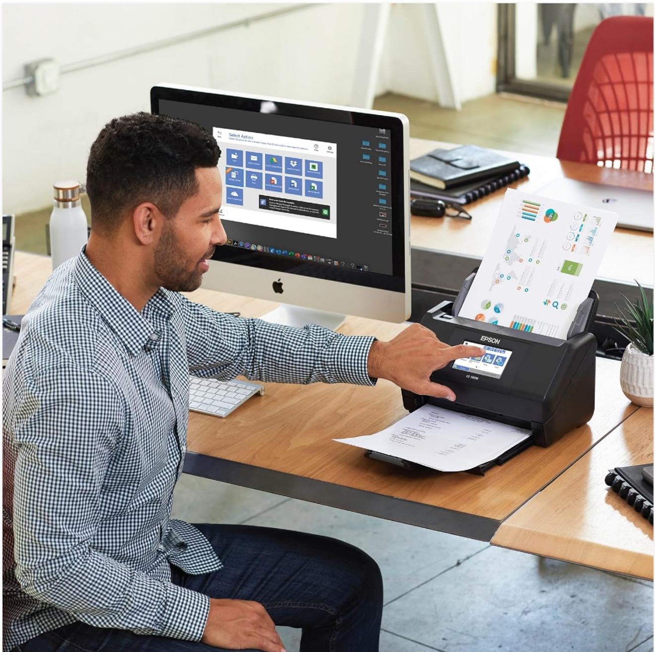
Image 4.2: A user's hand is shown interacting with the 4.3-inch touchscreen display of the Epson ES-580W scanner, selecting options for a scanning task.