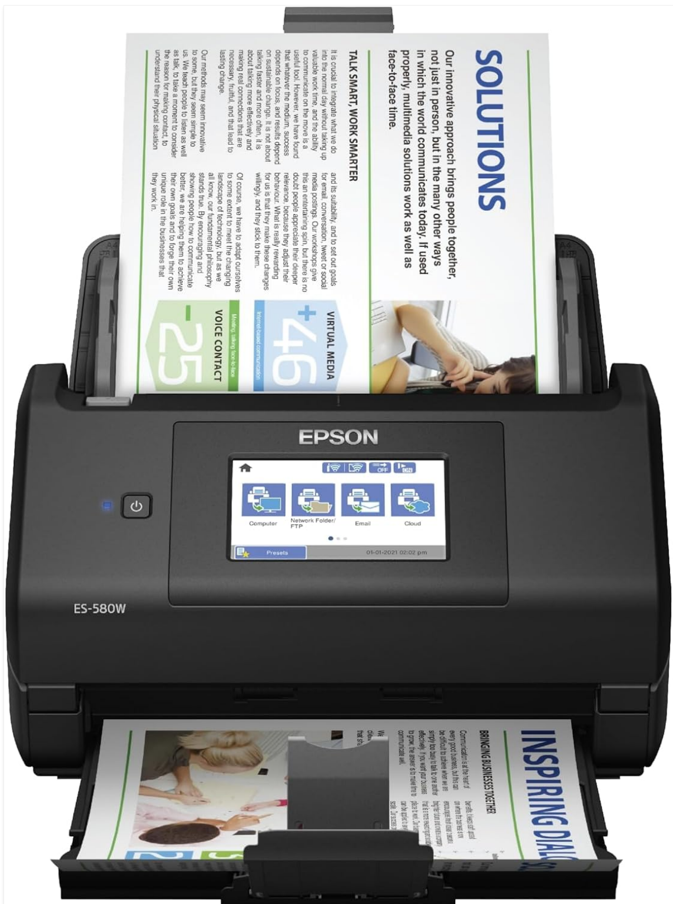
Image 1.1: The Epson Workforce ES-580W Wireless Document Scanner in operation, showing documents being fed through the automatic document feeder and exiting into the output tray. The touchscreen display is visible, indicating various scanning options.