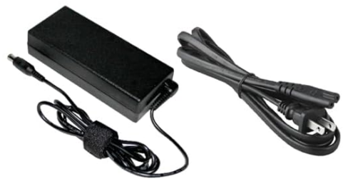
AC adapter with power cable