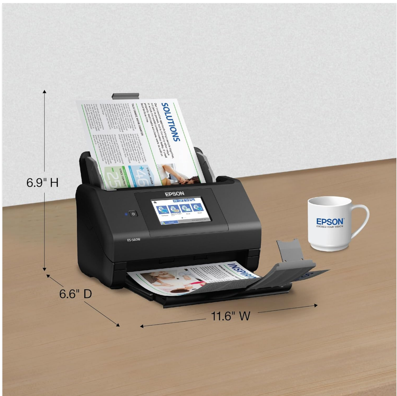
Image 3.1: The Epson ES-580W scanner displayed with its approximate dimensions: 6.9 inches height, 6.6 inches depth, and 11.6 inches width. A coffee mug is placed next to it for scale.