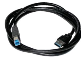
SuperSpeed USB 3.0 cable