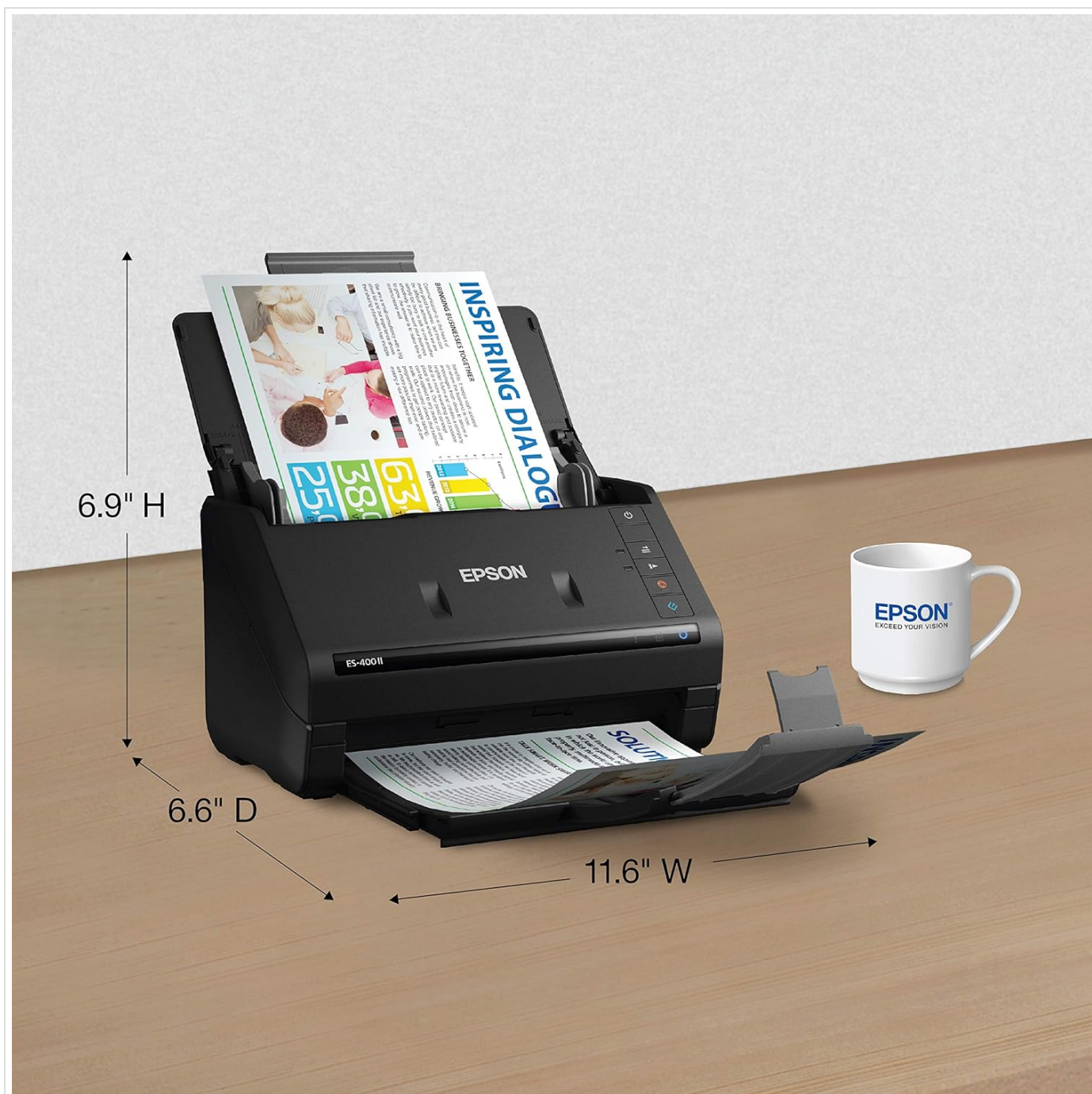
Image 6.1: Physical dimensions of the Epson Workforce ES-400 II scanner.