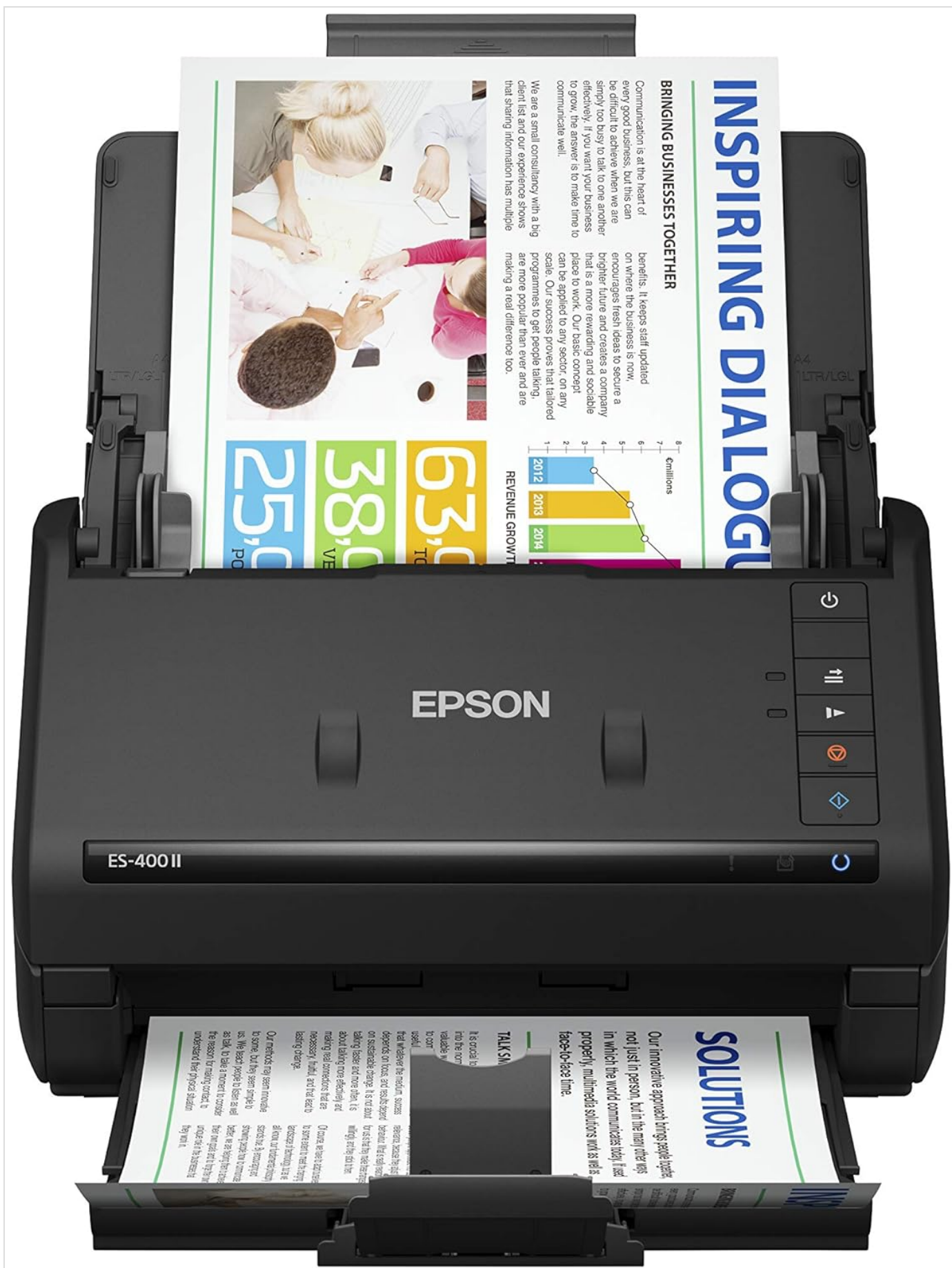
Image 1.1: The Epson Workforce ES-400 II scanner with documents ready for scanning. This device is designed for efficient two-sided document scanning.