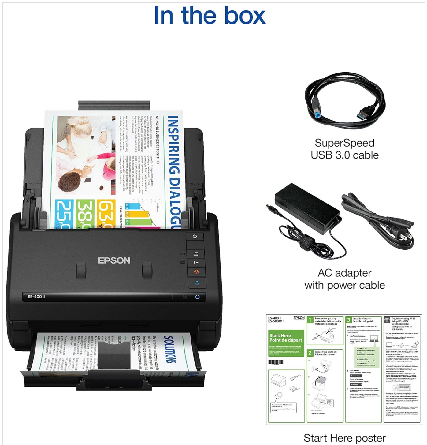
Image 2.1: The scanner and its included accessories: SuperSpeed USB 3.0 cable, AC adapter with power cable, and a 'Start Here' poster.

Carefully remove all components from the packaging. Ensure all items listed in the 'In the Box' section are present. Retain packaging for future transport or storage.