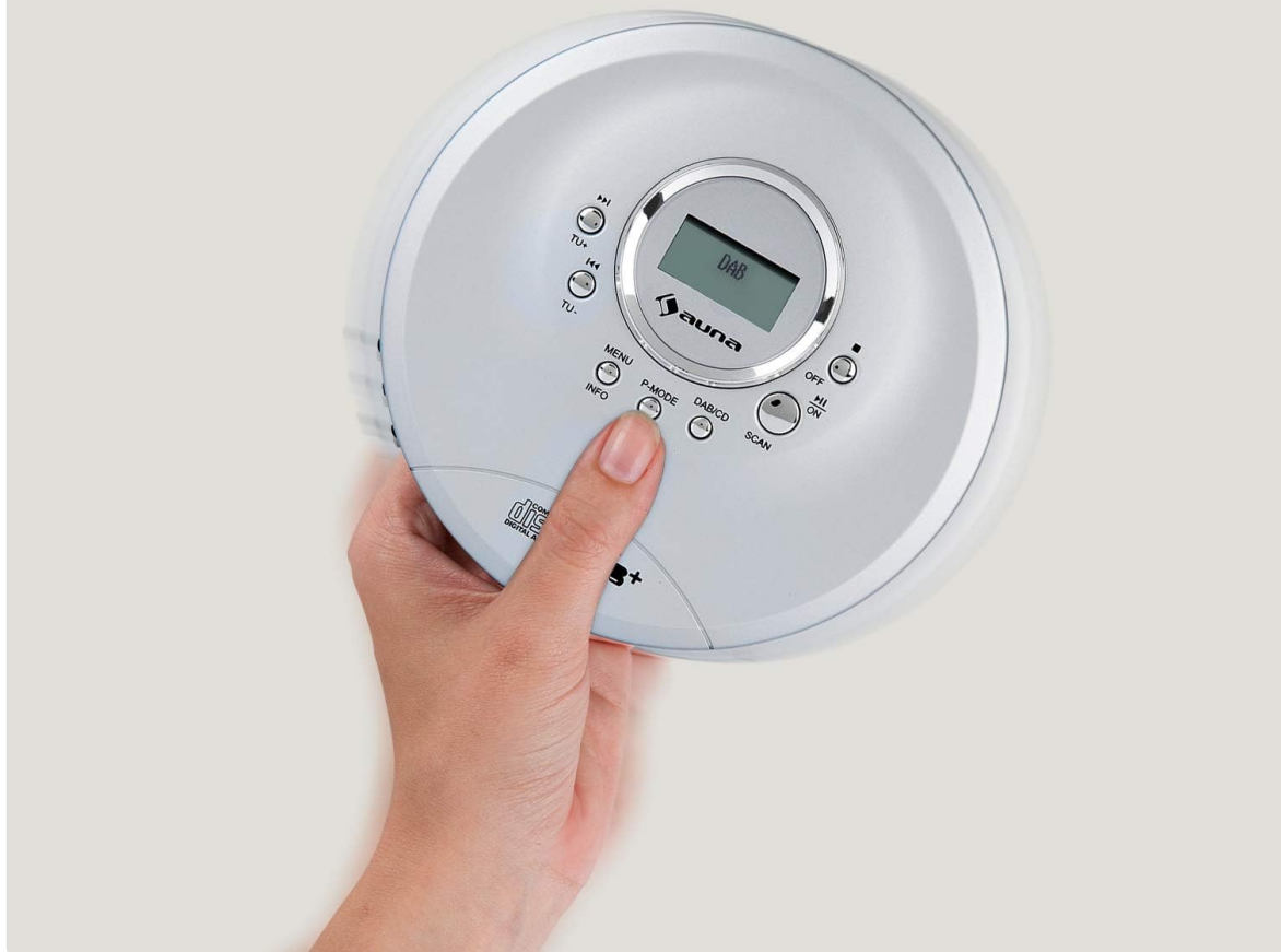
Image: The integrated anti-skip function ensures uninterrupted audio playback.