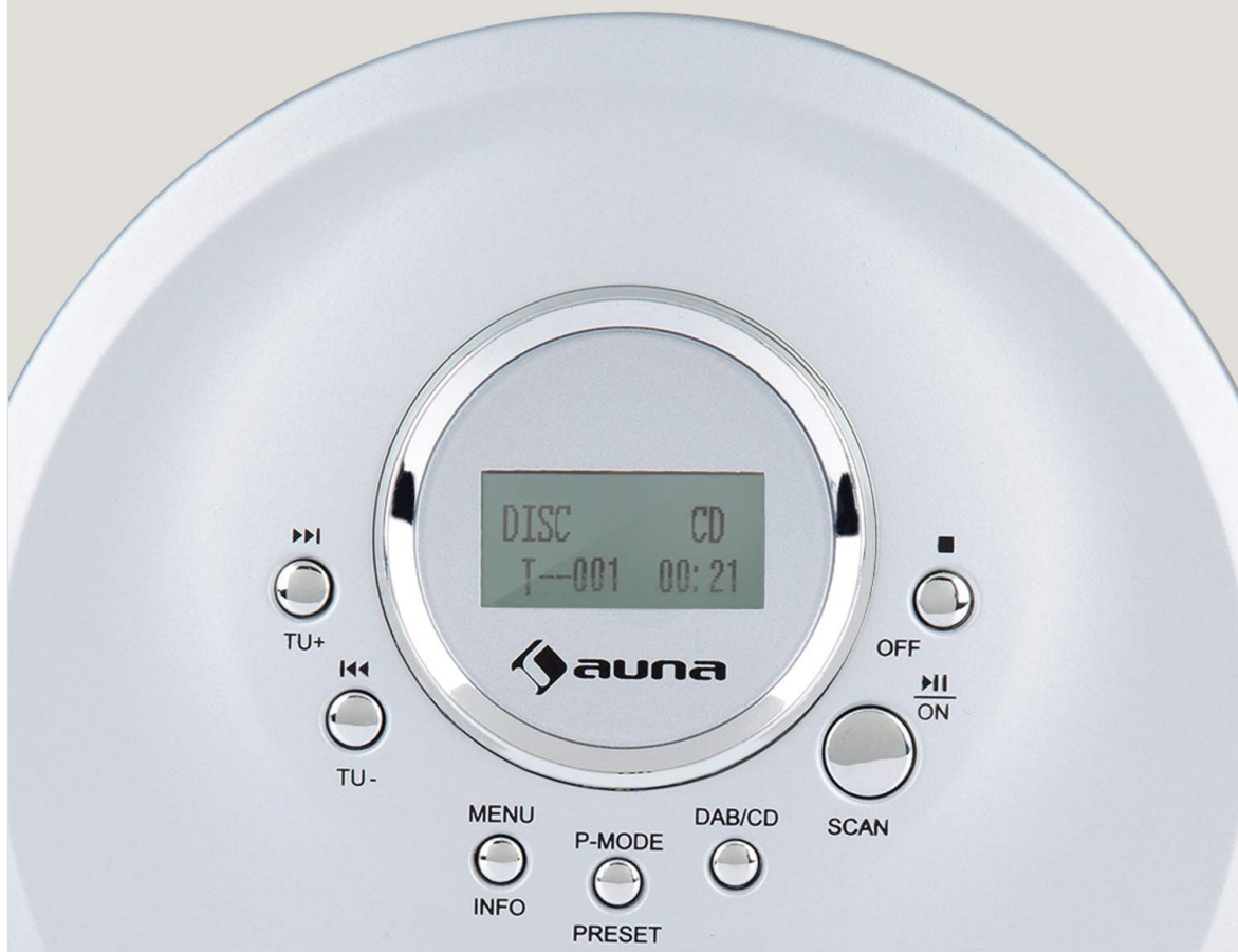
Image: The clear LC display provides all necessary information at a glance.