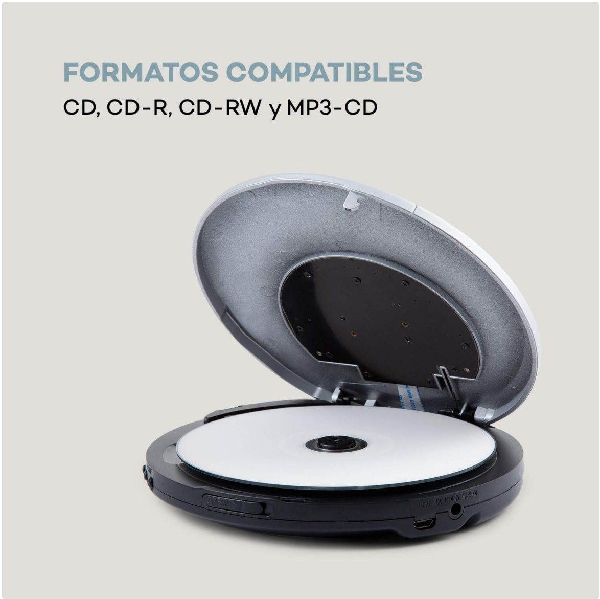
Image: The Discman supports various CD formats including CD, CD-R, CD-RW, and MP3-CD.