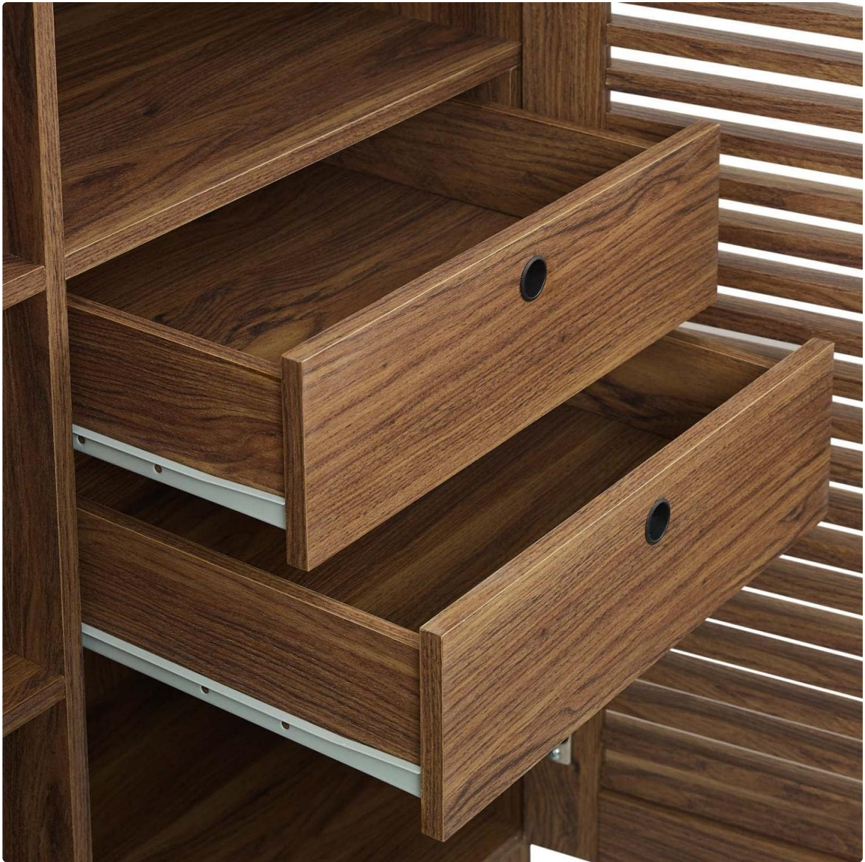
Image: A close-up view of the Modway Render Bar Cabinet's two soft-close drawers, demonstrating their smooth operation.