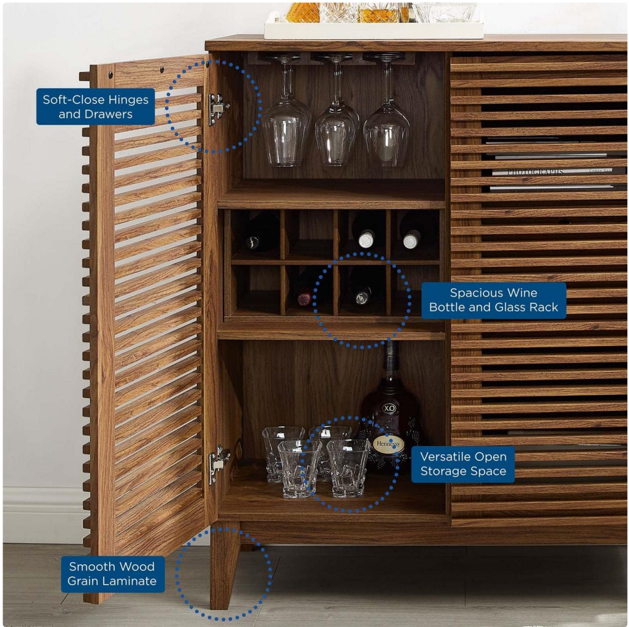
Image: A detailed view of the Modway Render Bar Cabinet's interior, showcasing the soft-close hinges, wine bottle and glass racks, and versatile open storage space.