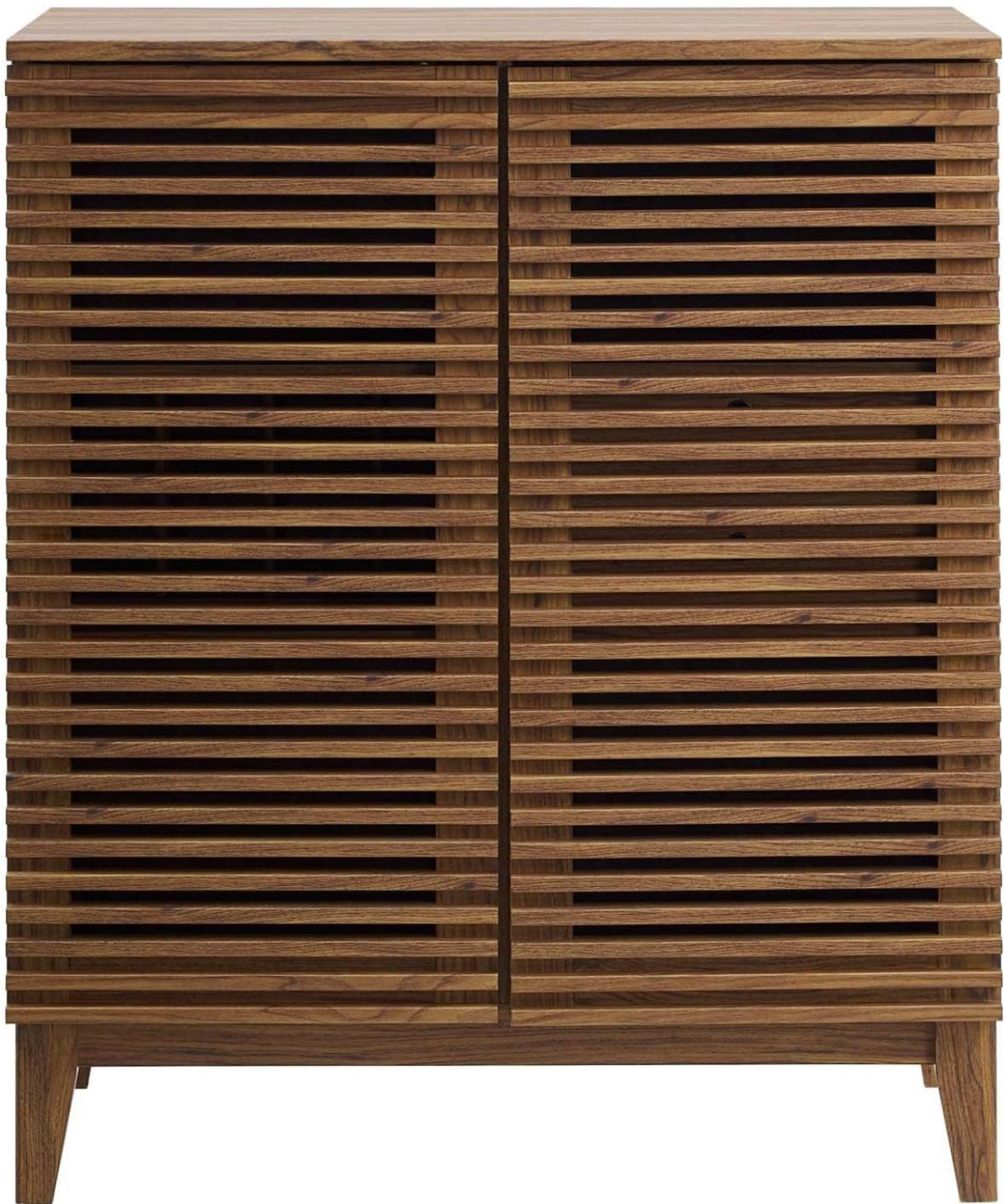
Image: The Modway Render Bar Cabinet with its slatted doors closed, showcasing the walnut finish and mid-century modern design.