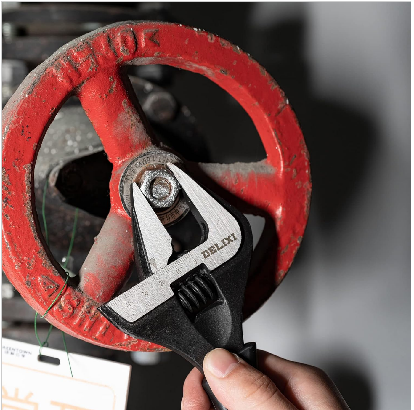
Image: A hand using the DELIXI adjustable wrench to turn a nut on a red valve, demonstrating its application in plumbing or industrial settings.