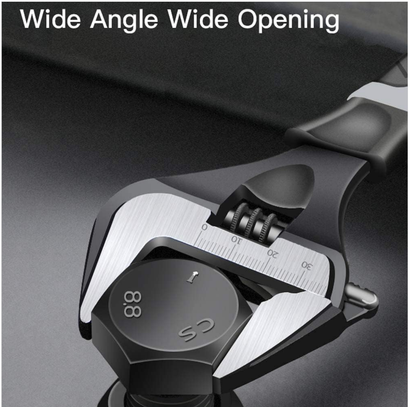
Image: The adjustable wrench gripping a hexagonal bolt, showcasing its wide jaw opening capability for various fastener sizes.