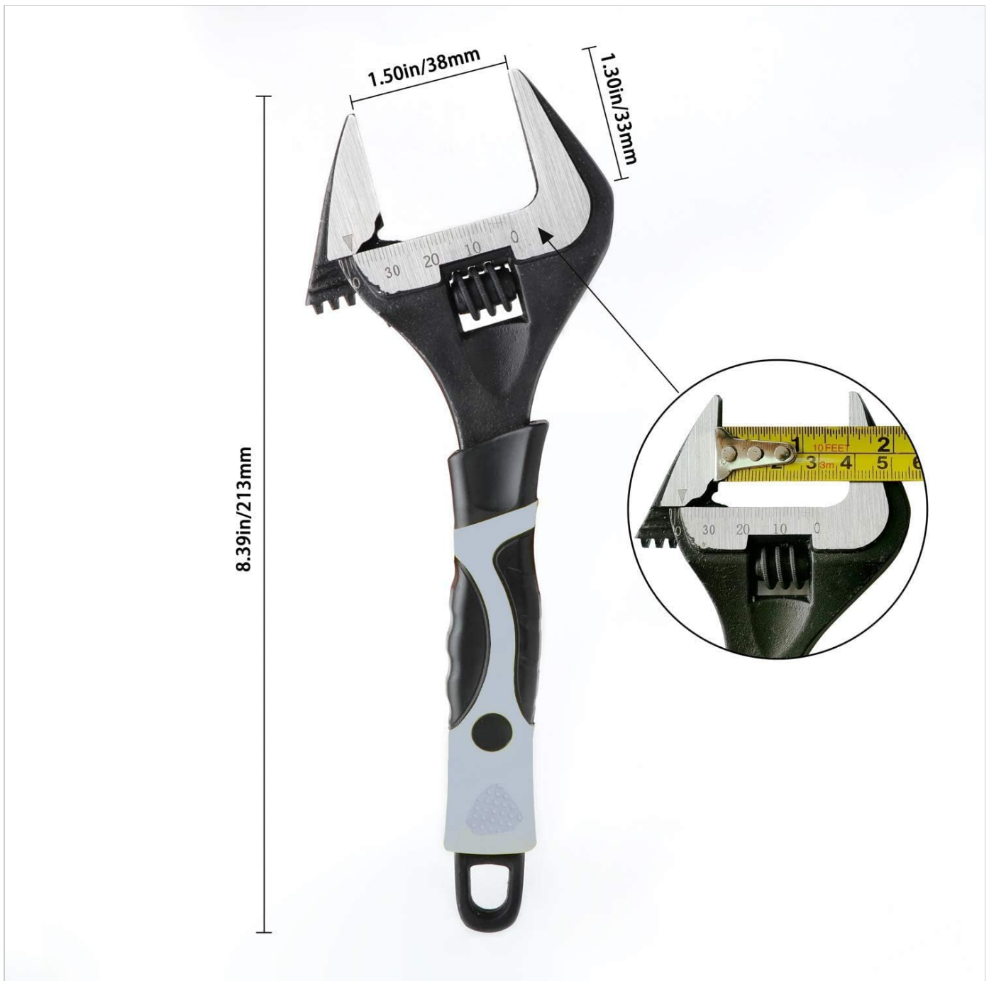
Image: The DELIXI 8-inch adjustable wrench, illustrating its overall length of 8.39 inches (213mm) and jaw opening dimensions of 1.50 inches (38mm) and 1.30 inches (33mm) for the deep jaw.