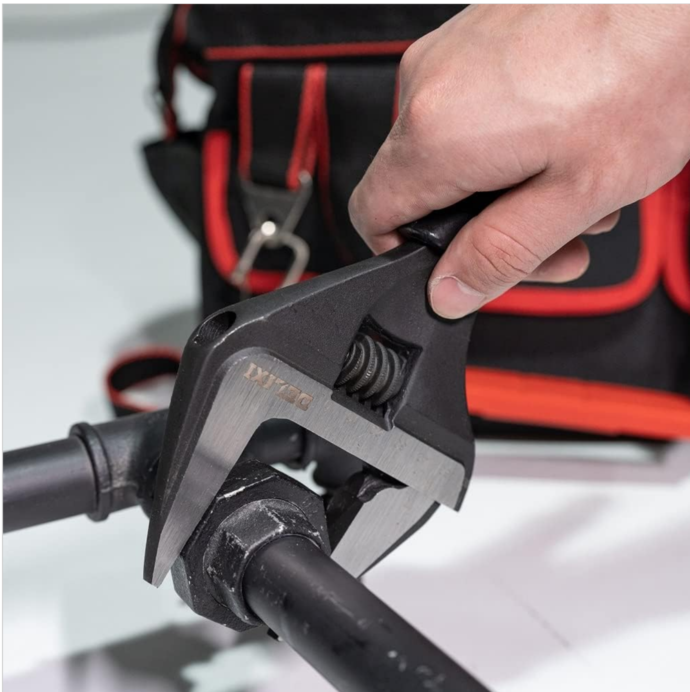
Image: The adjustable wrench in use on black plumbing pipes, illustrating its suitability for pipe fitting and similar tasks.