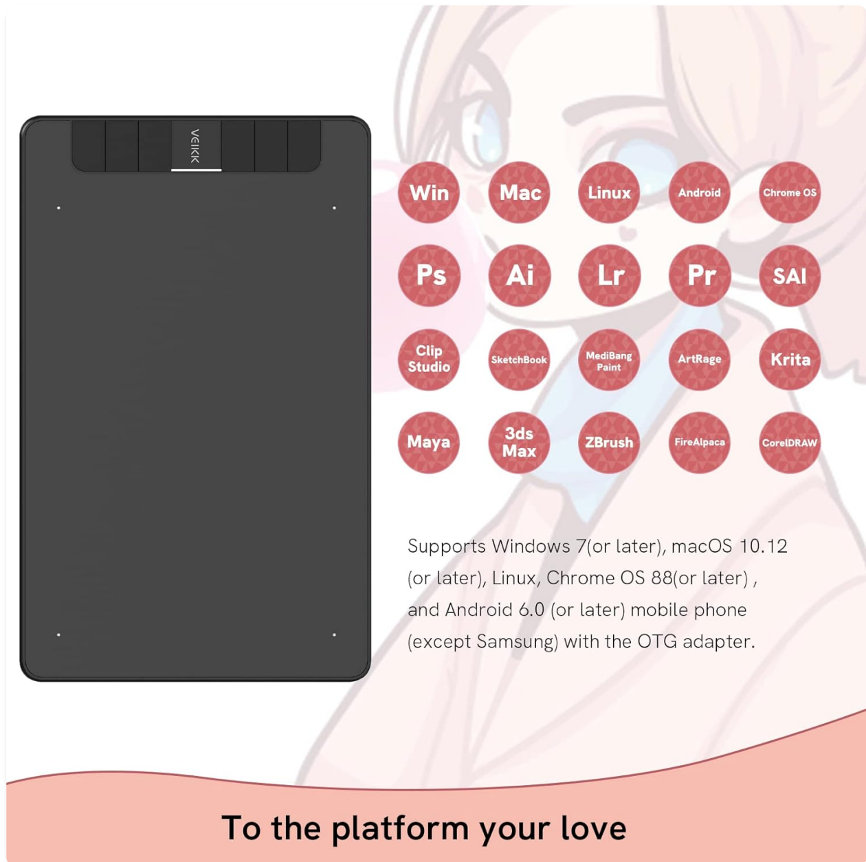
Figure 4: Key features of the VEIKK VK640 battery-free stylus.

The battery-free stylus supports 8192 levels of pressure sensitivity, allowing for precise control over line thickness and opacity. It also features up to 60 degrees of tilt function, enabling natural shading and brush strokes. The pen does not require charging, ensuring uninterrupted creative sessions.