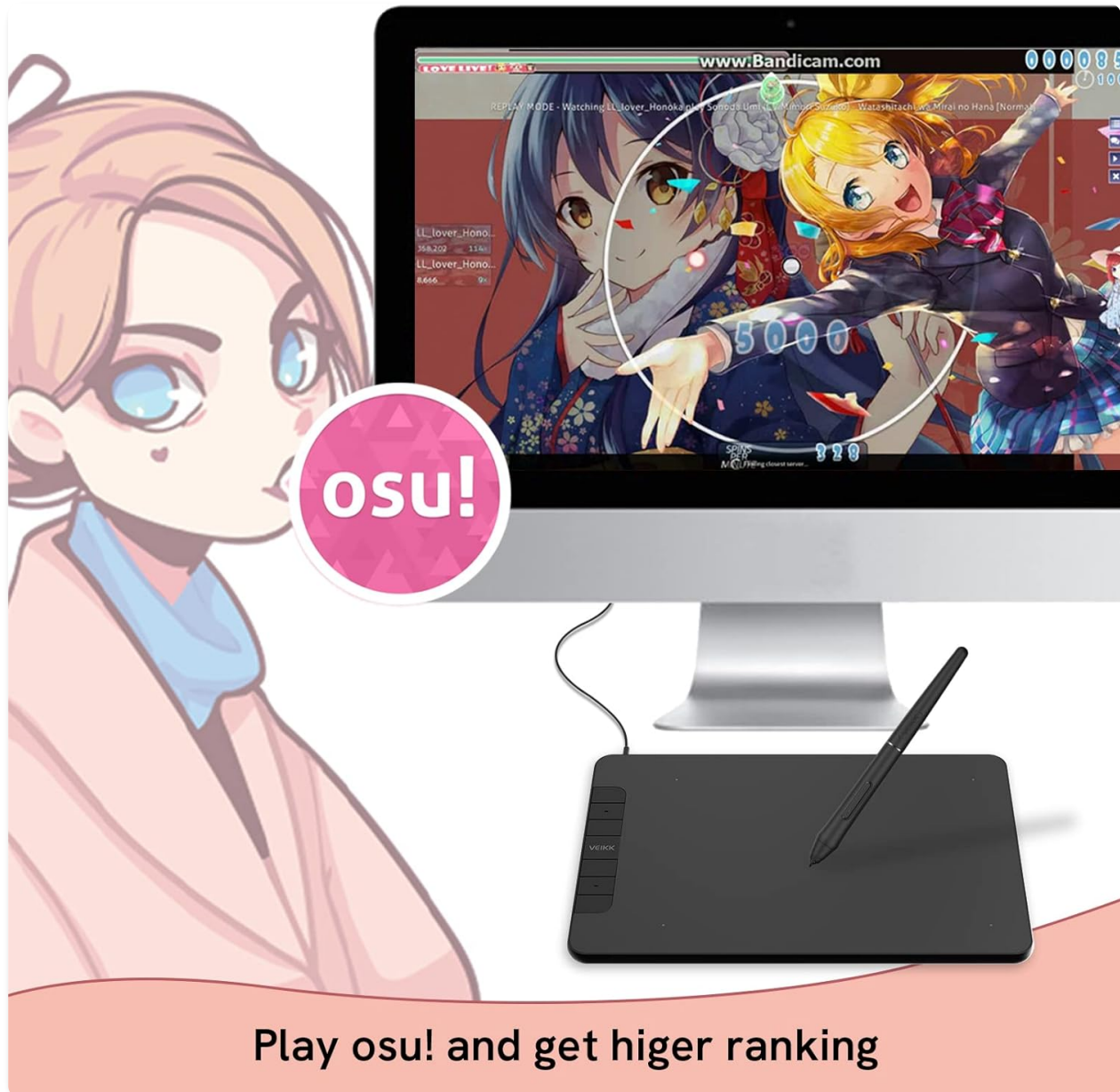
Figure 5: VEIKK VK640's broad compatibility with software and operating systems.

The tablet is compatible with most major drawing and design software, including Adobe Photoshop, Krita, Adobe Illustrator, SAI, SketchBookPro, FireAlpaca, OpenCanvas, and Manga Studio. It also supports various operating systems such as Windows 11/10/8/7, macOS 10.12 or later, Chrome OS, and Linux OS.