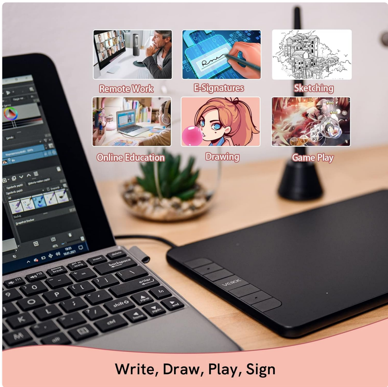
Figure 6: Diverse applications of the VEIKK VK640 tablet.