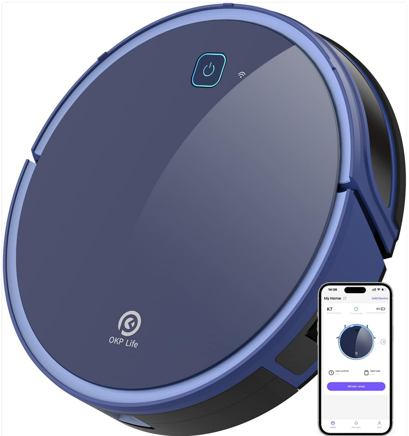
Image: Top view of the OKP K7 Robot Vacuum Cleaner, showing the main power button and Wi-Fi indicator light. A smartphone screen displaying the "OKP Life" app interface is shown next to the vacuum, illustrating app control capabilities.