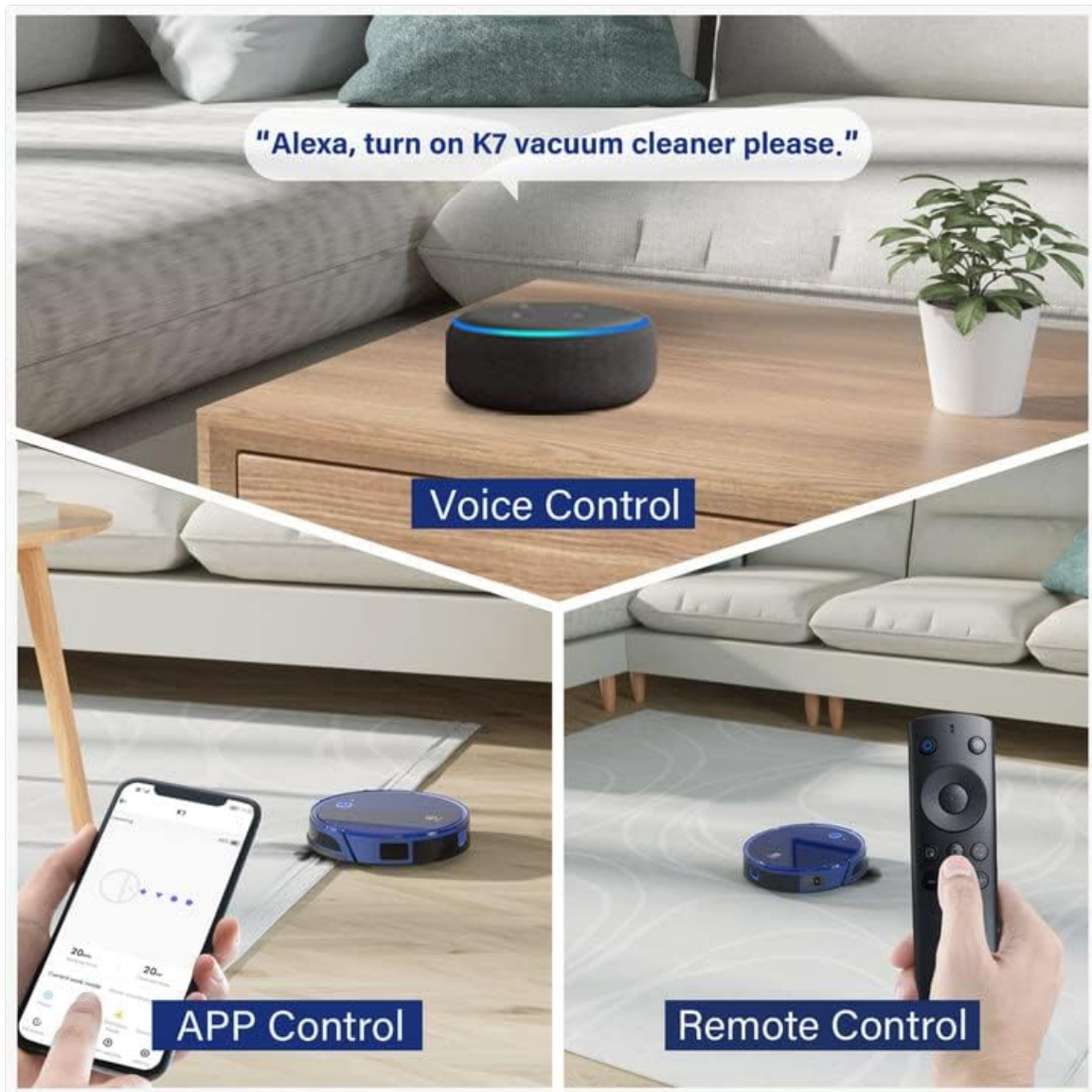
Image: This image illustrates the multiple control methods for the OKP K7 Robot Vacuum Cleaner: Voice Control (via Alexa, with an Echo Dot shown), App Control (via the OKP Life smartphone app), and Remote Control (with a physical remote shown). This highlights the versatility in operating the device.