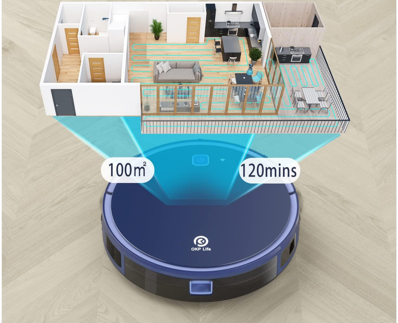
Image: An aerial view diagram illustrating the OKP K7 Robot Vacuum Cleaner's long running time and coverage. The robot is shown on a floor plan of a house, with blue lines indicating its cleaning path across multiple rooms, covering an area of 100m 2 for up to 120 minutes.