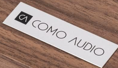
Image: A detailed view of the rich walnut finish on the turntable's plinth, showcasing the wood grain.