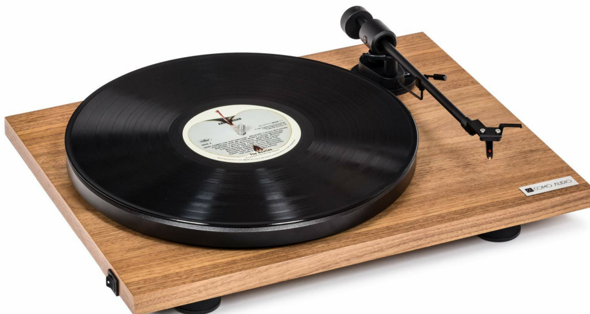
Image: The Como Audio Analog Turntable, featuring a walnut wood plinth, black platter, and tonearm.

This instruction manual provides essential information for the proper setup, operation, and maintenance of your Como Audio Analog Turntable, Model CATA. Please read this manual thoroughly before using the product to ensure optimal performance and longevity.