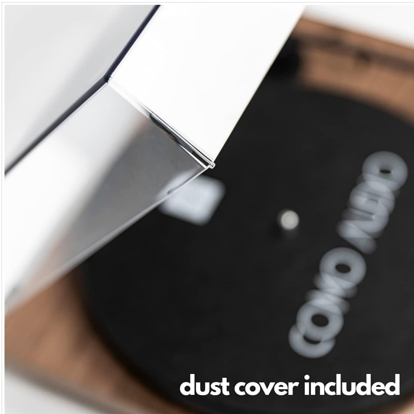
Image: Detail of the removable clear dust cover, designed to protect the turntable from dust.