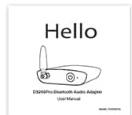
7 User manual

Image Description: This image displays the complete contents of the 1Mii DS200Pro package. It includes the main wireless audio adapter unit, a USB charging cable, a 3.5mm female to 2RCA splitter cable, a 2RCA to 2RCA stereo audio cable, an optical cable, self-adhesive feet bumpers, and a user manual.