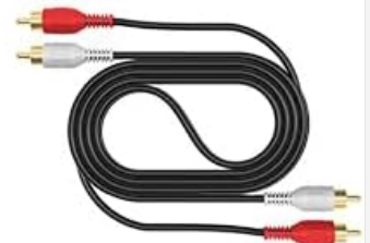
4 2RCA to 2RCA stereo audio cable