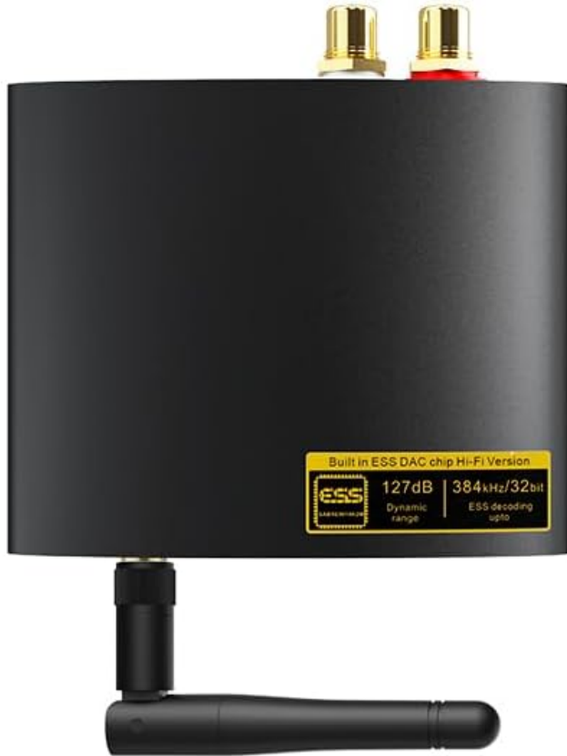
1 Wireless audio adapter