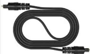
5 Optical cable