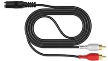
3 3.5mm female to 2RCA splitter cable