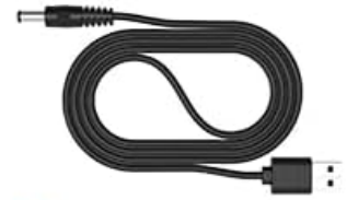
2 USB charging cable