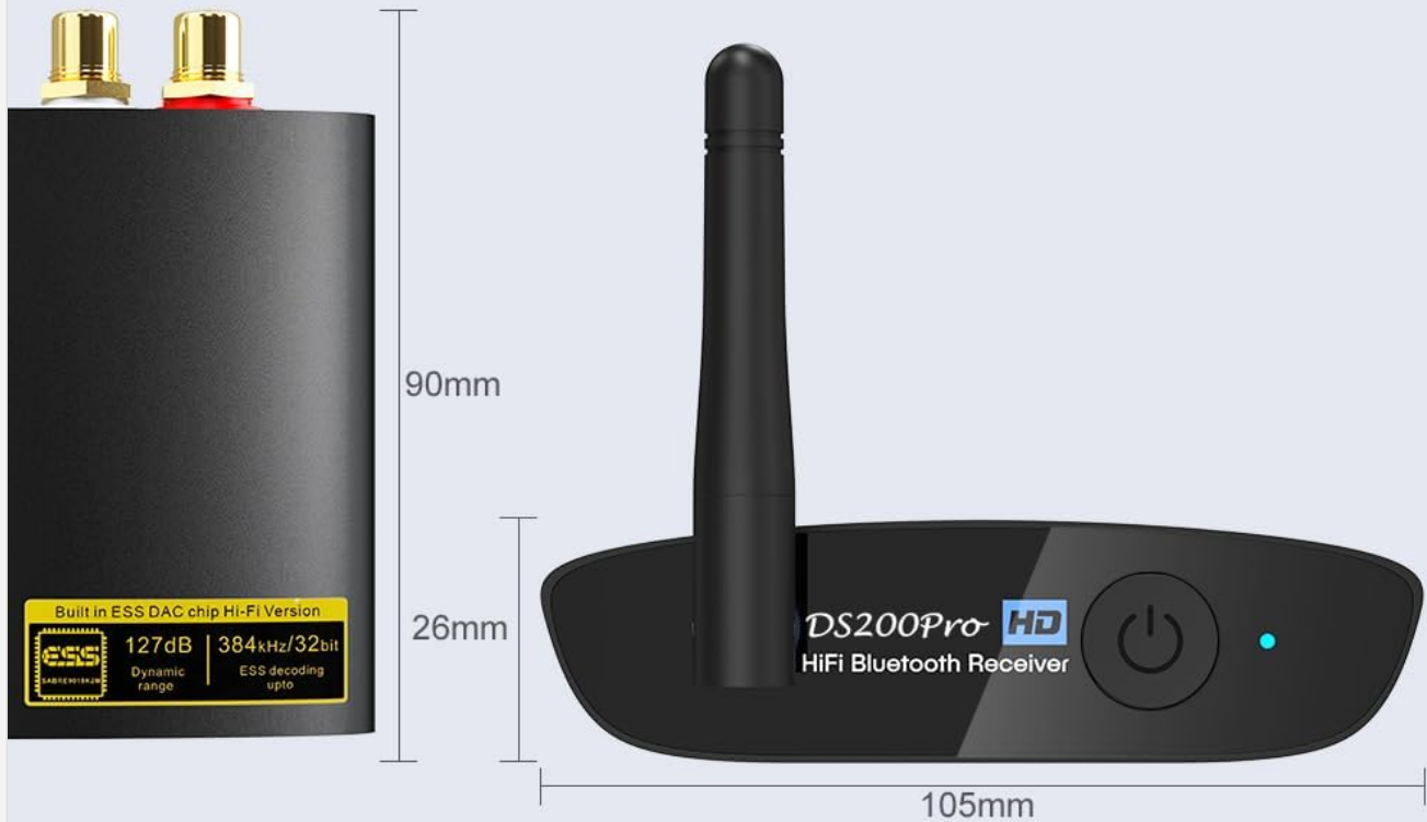
Image Description: This image illustrates the dimensions of the 1Mii DS200Pro receiver. The device measures 105mm in width, 90mm in depth, and 26mm in height (excluding the antenna). It highlights the compact form factor and the built-in ESS DAC chip specifications.

High-quality all-aluminum material, one-piece molding, to ensure a better appearance, and also provide better electromagnetic shielding