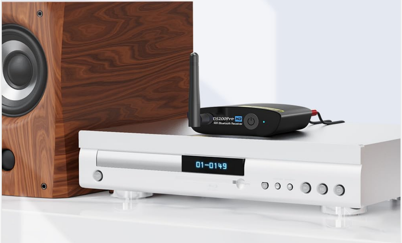
Image Description: This image highlights the strong decoding format support of the 1Mii DS200Pro, which includes LDAC, aptX HD, aptX Low Latency, AAC, and SBC, contributing to enhanced sound quality.