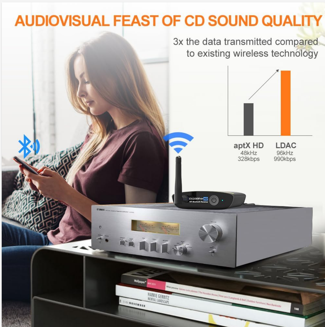
Image Description: This graphic illustrates the superior data transmission of LDAC (96kHz, 990kbps) compared to aptX HD (48kHz, 328kbps), indicating a higher quality audio experience. A smartphone is shown wirelessly connected to the DS200Pro, which is linked to a stereo receiver.

The DS200Pro supports various high-quality audio codecs, including LDAC, aptX HD, aptX, aptX LL, AAC, and SBC, ensuring optimal sound reproduction.