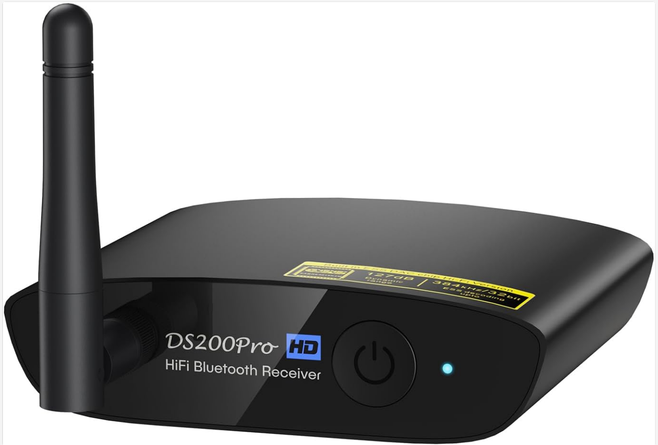
Image Description: A front-angle view of the 1Mii DS200Pro HiFi Bluetooth Receiver. The device is black with a prominent antenna on the left side. The front panel features the "DS200Pro HiFi Bluetooth Receiver" branding, a power button, and a blue indicator light.

The 1Mii DS200Pro is designed for seamless integration into your home audio system. Its compact and elegant design, crafted from high-quality aluminum, ensures both aesthetic appeal and effective electromagnetic shielding.