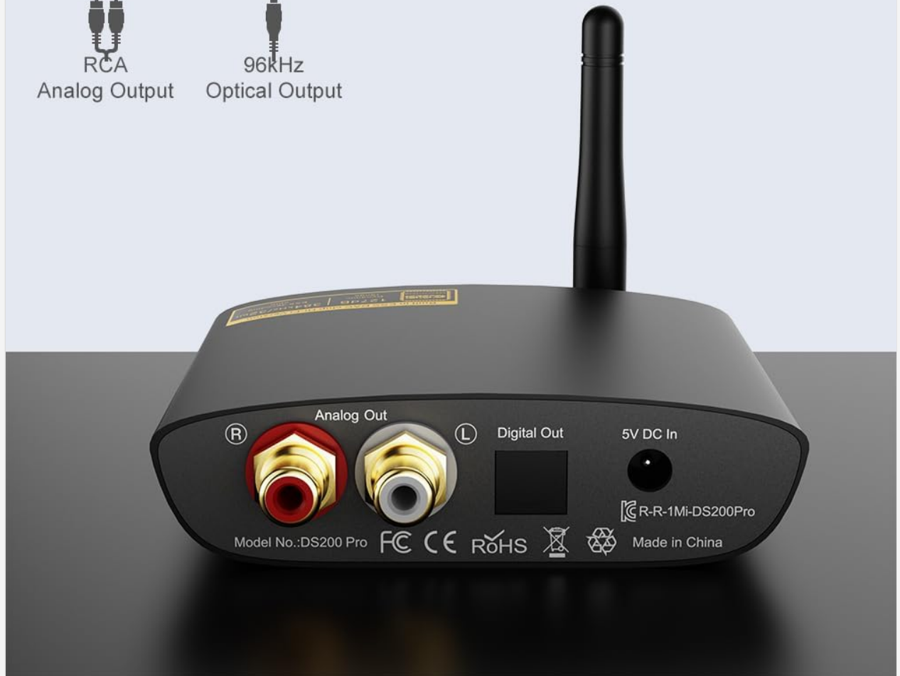
Image Description: The rear panel of the 1Mii DS200Pro receiver, highlighting its flexible output options. It features gold-plated RCA analog outputs (left and right channels) and a digital optical output. The 5V DC In port for power is also visible.