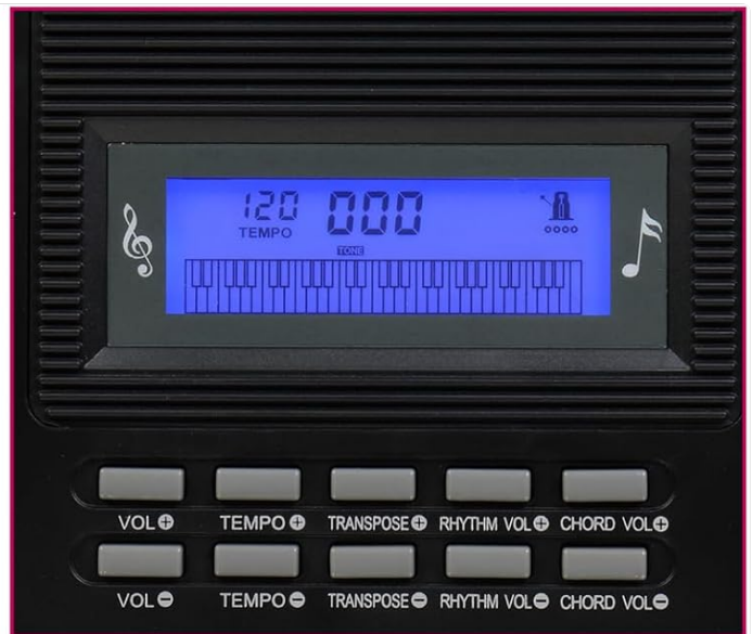
LCD Display Screen