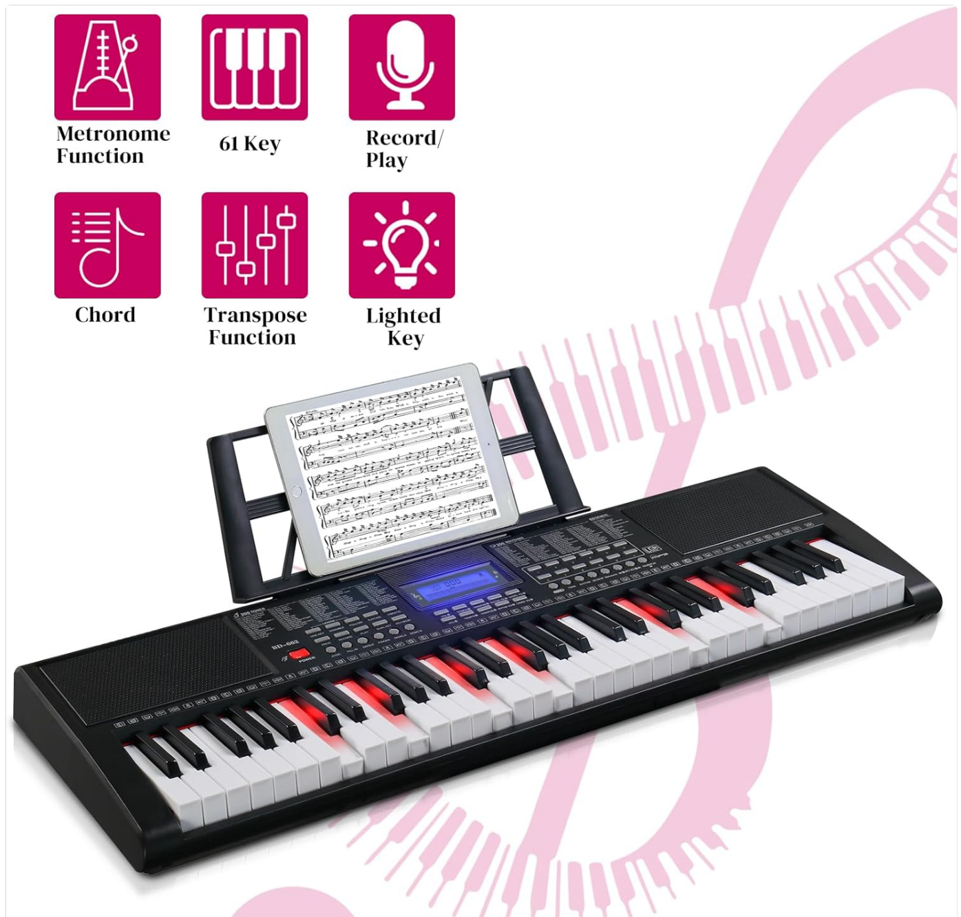
Figure 6: Overview of keyboard functions.

selection, split/touch control, sustain, and vibrato.