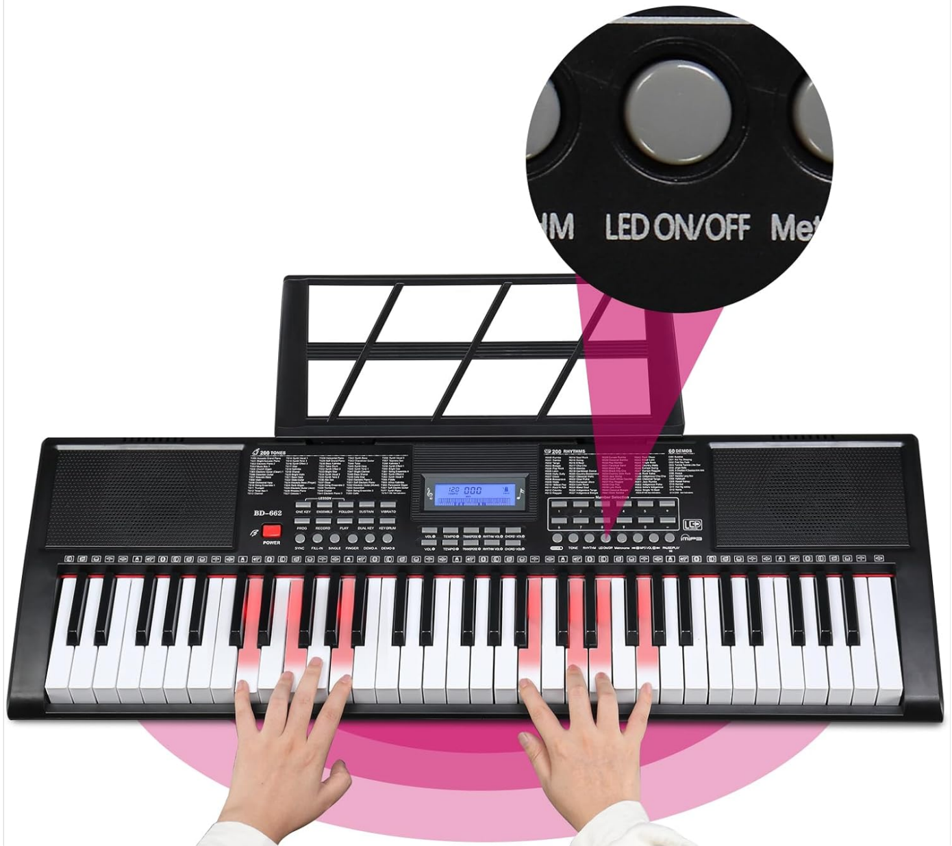
Figure 5: Lighted keys feature and LED ON/OFF button.

When you don't need to light the keyboard, you can turn it off at any time with one key.