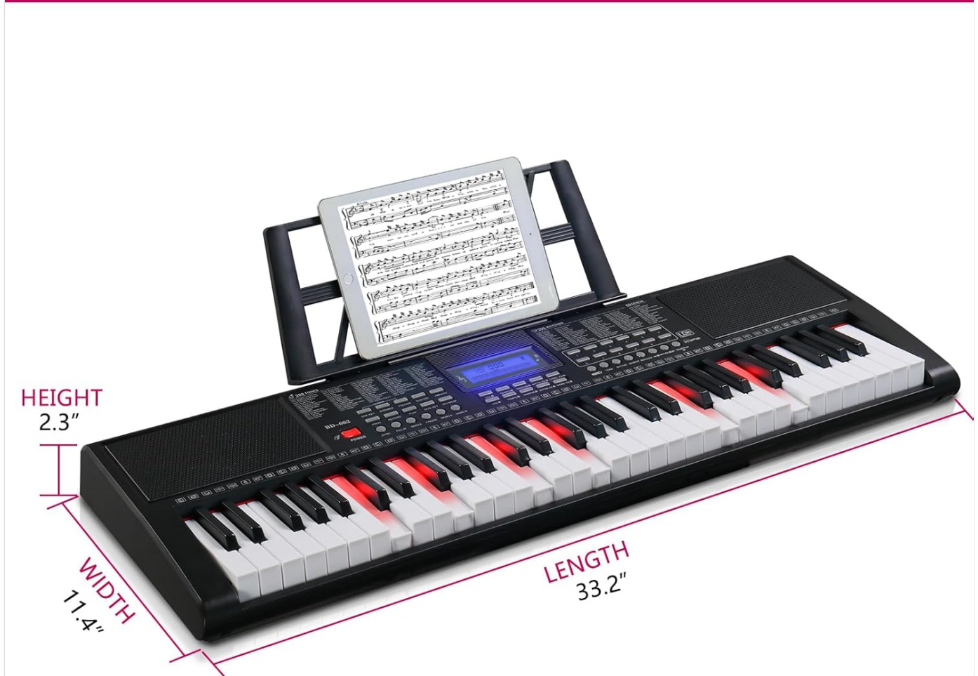
Figure 7: Keyboard dimensions.