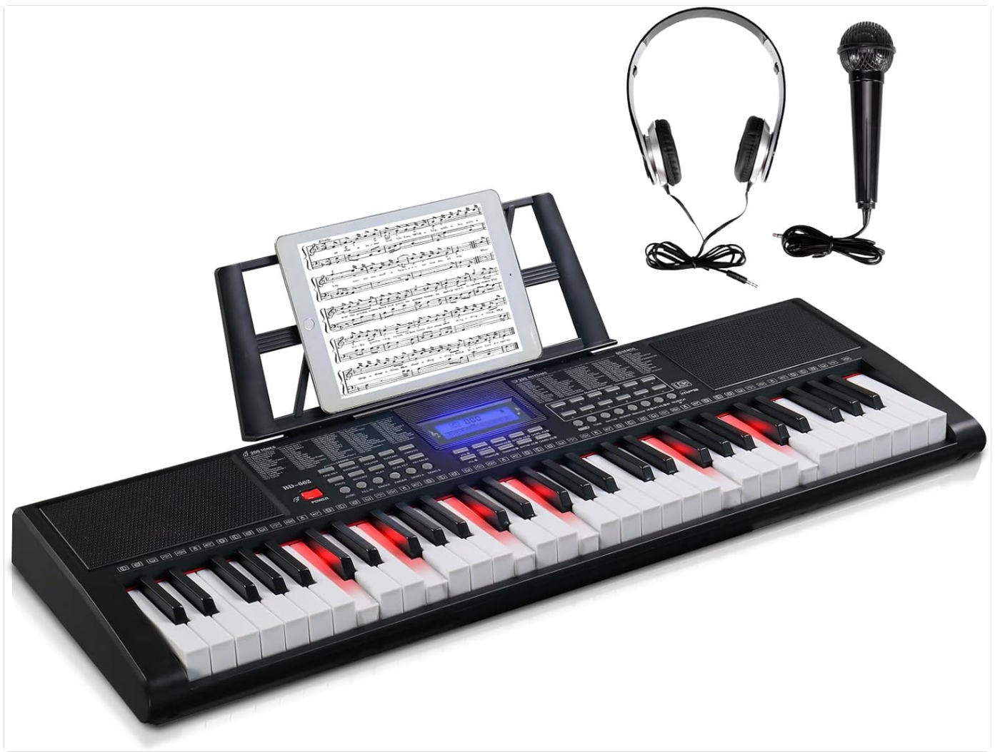
Figure 1: GLARRY 61-Key Portable Electronic Piano Keyboard with accessories.