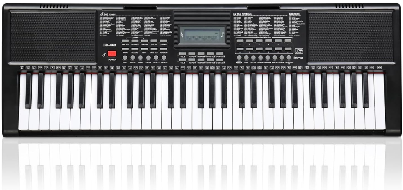
Figure 2: Power options for the keyboard.