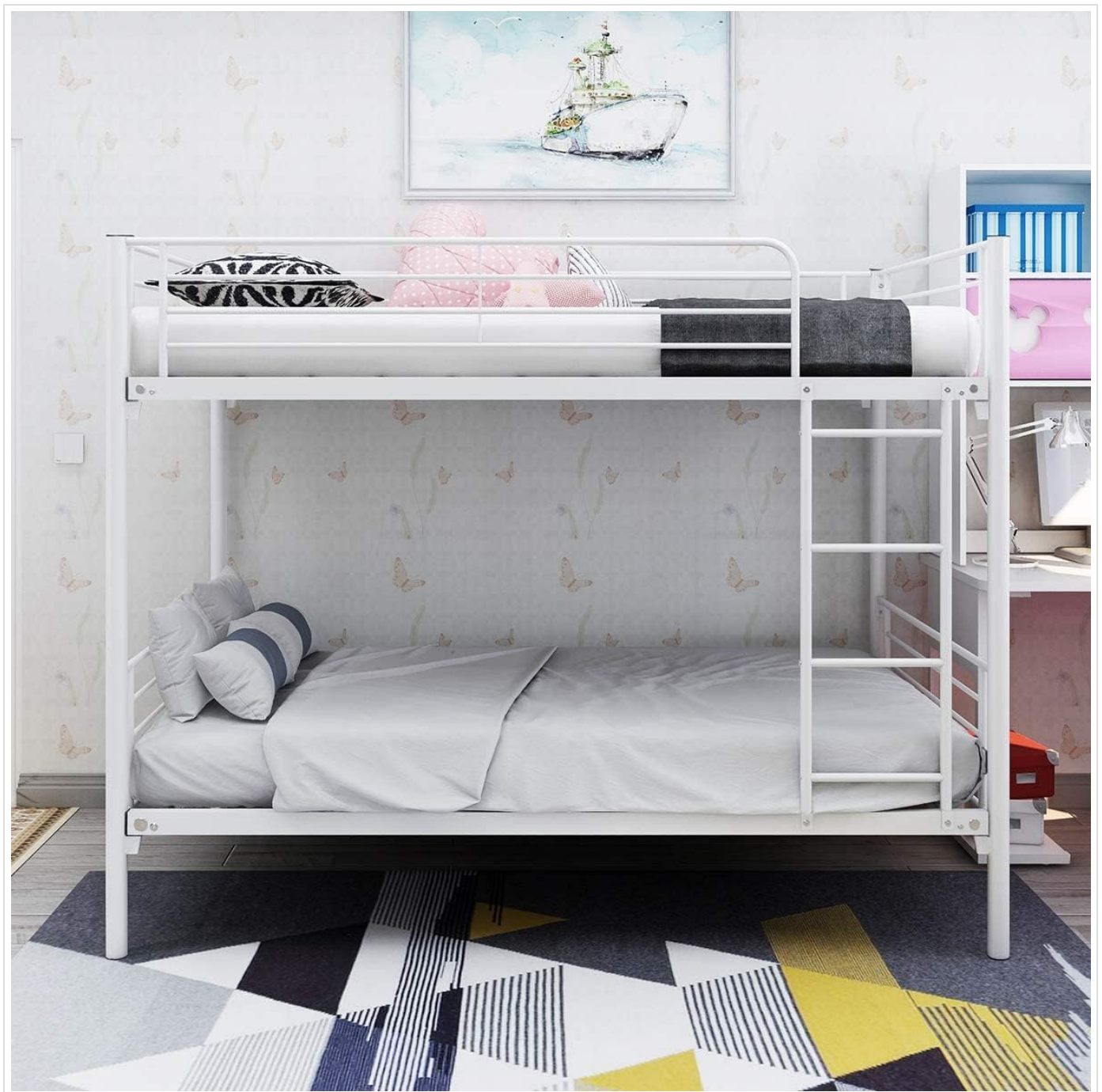
Image: Assembled JURMERRY Twin Over Twin Bunk Bed Frame in white, showcasing its design and integrated ladder.