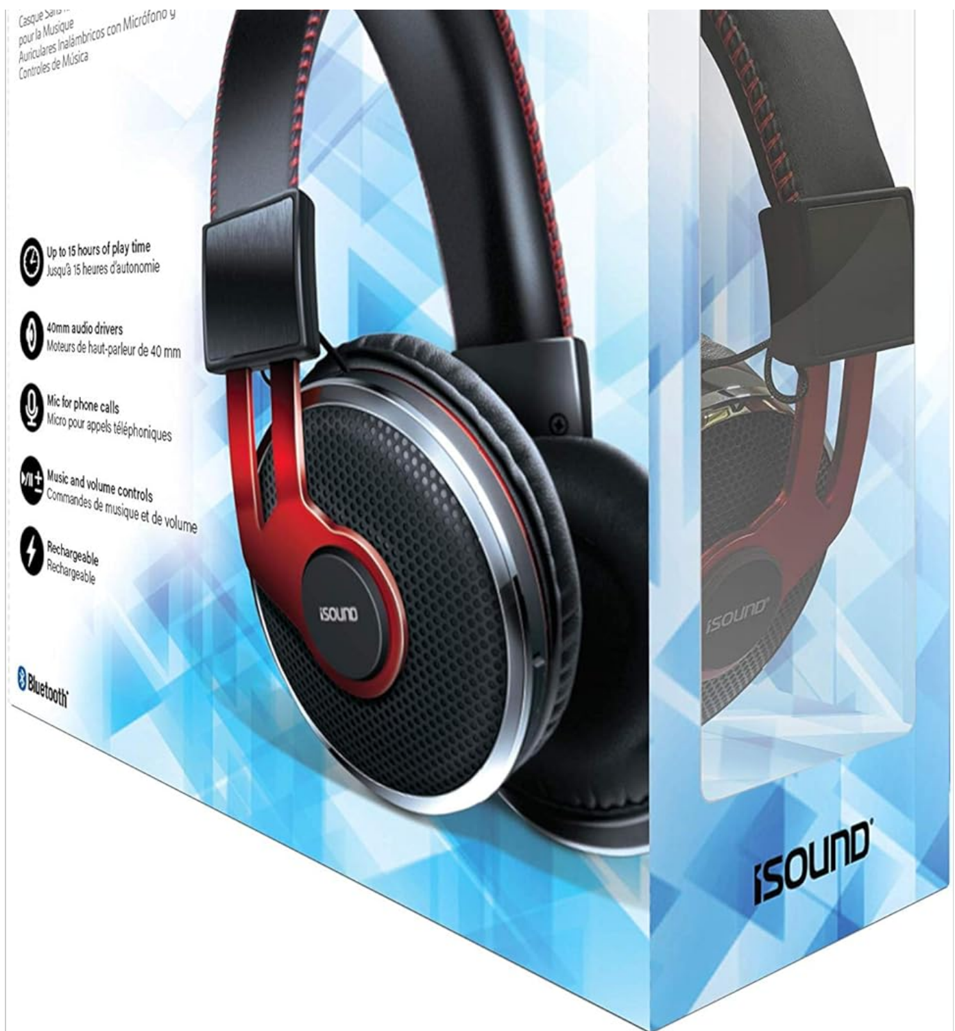
Image: Front view of the iSound BT-3500 Wireless Headphones and their retail packaging, showing the headphones, brand logo, and key features.